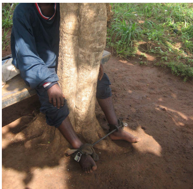
Figure 2 Chains in use in a prayer camp.