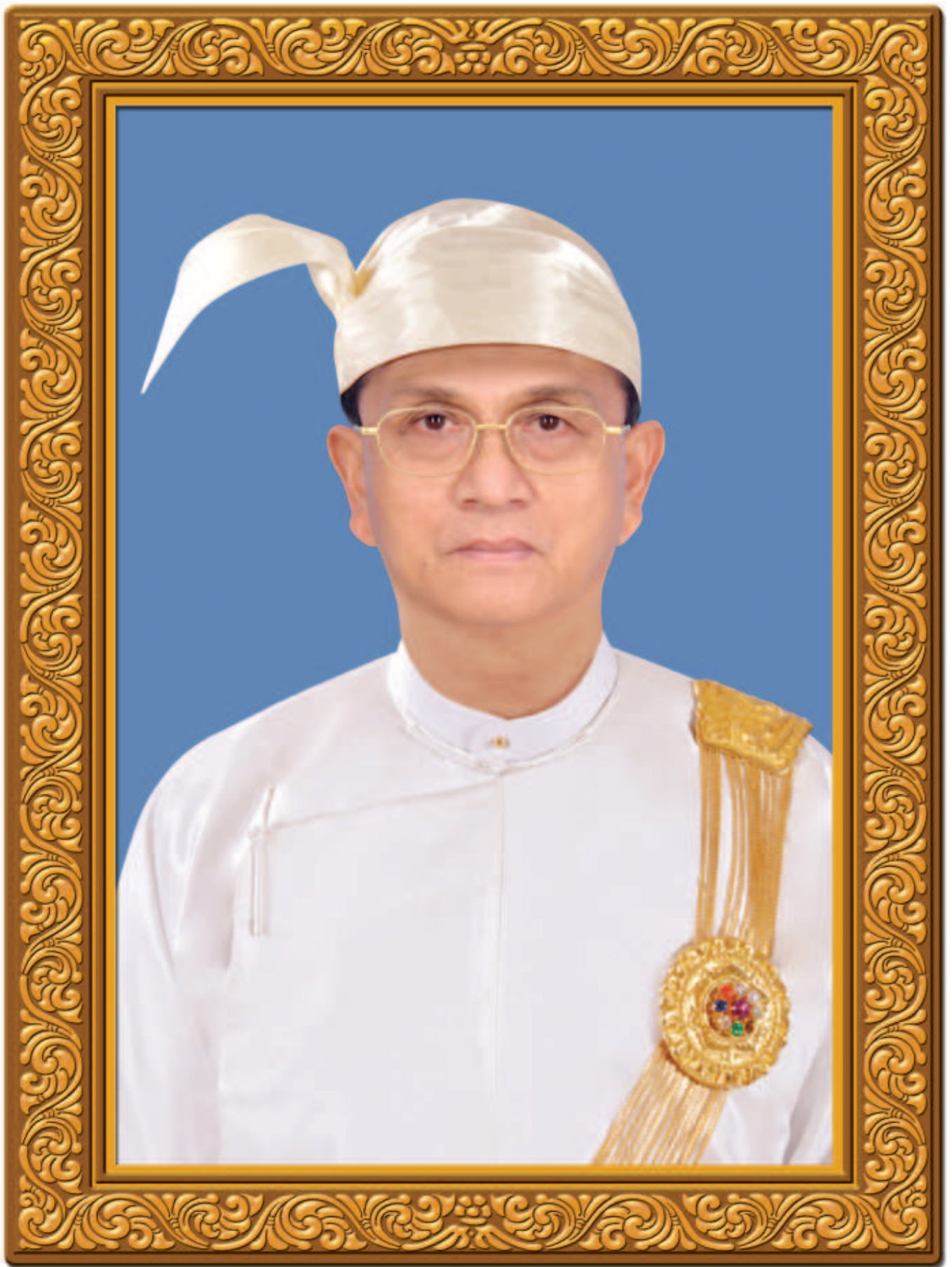
President Agga Maha Thayay Sithu Agga Maha Thiri Thudhamma U Thein Sein