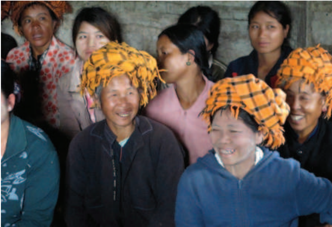
Pa-oh women actively participate in ECCD activities, Pinlaung Township

292. With the goal of offering children from ethnic and linguistic minorities all of the comprehensive ECCD services that are included in this ECCD Policy by 2018, priority will be placed on developing these services as rapidly as possible.