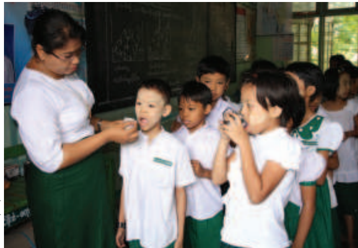
Deworming pills help prevent malnutrition

116. In the MoH, a separate budget exists for the Maternal, Newborn and Child Health Section. In 2008-2009, this MNCH received a budget of 3,634 million kyats from the MoH and 2,767 million kyats from non-profit institutions serving households for a total of 6,401 million kyats (MoH, 2009a). This separate budget for Maternal, Newborn and Child Health needs to be greatly expanded to ensure that sufficient funds will be allocated to this essential area of health care services. It must be noted that additional support for mothers and children is found in other parts of the MoH budget, the budgets of several other ministries, NGOs and INGO but these amount have not been tallied separately, making it difficult to assess the total national health investment in young children and mothers.