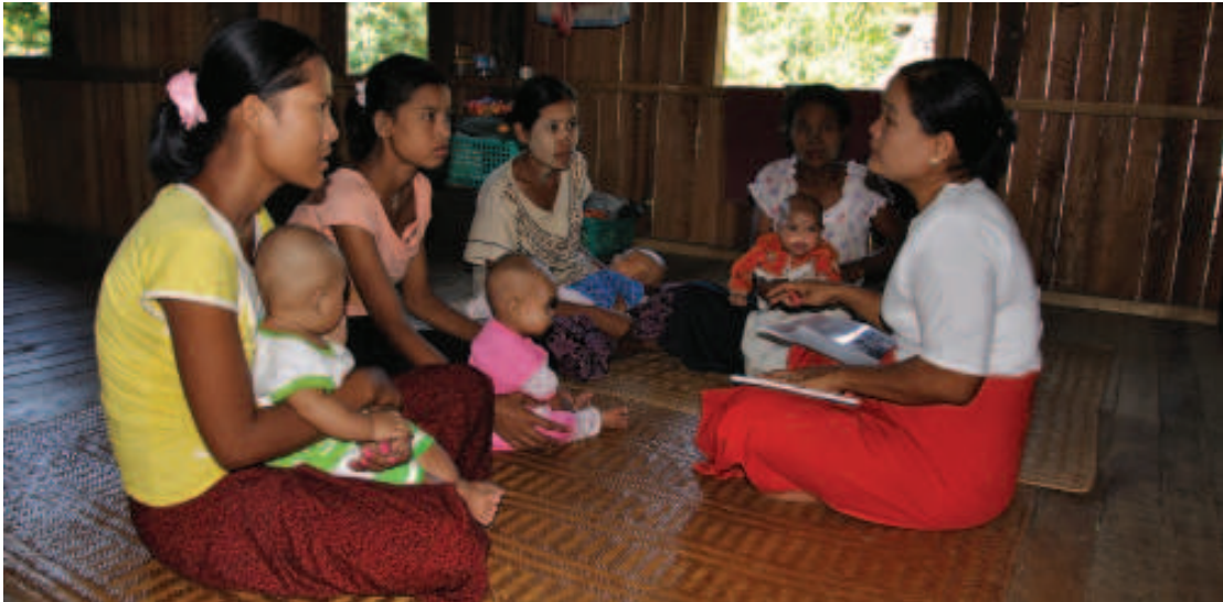
All parents should participate in parenting education activities at home or in centers

Child Health, Nutrition and Immunisation Card. Many of these services are listed in Community Integrated Management of Childhood Illness (C-IMCI), IMCI, and Care for Development services that are promoted by WHO.