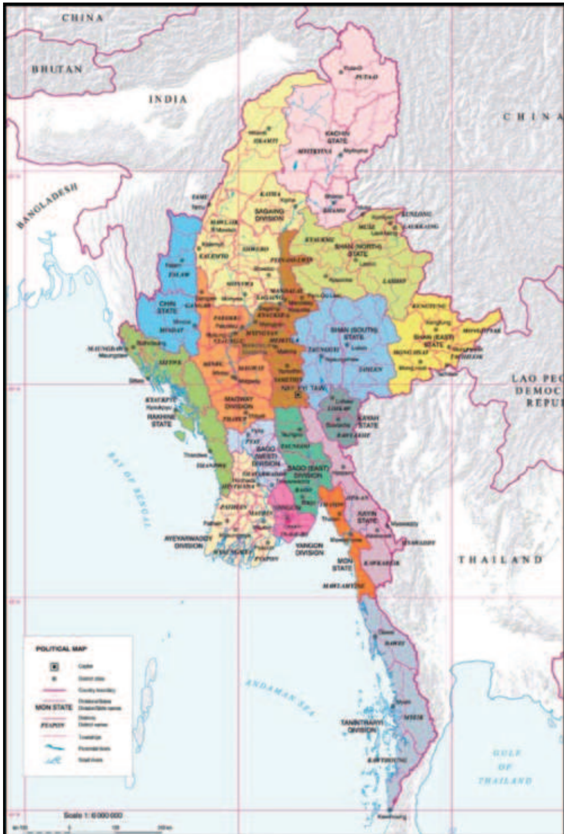
Map of The Republic of The Union of Myanmar