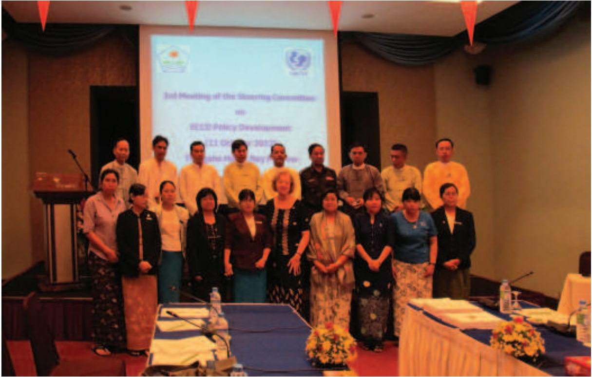
Multisectoral ECCD Policy Steering Committee