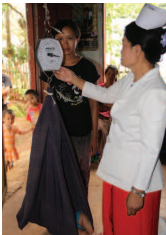
Regular growth monitoring for early intervention

and eventually eliminate child malnutrition and strengthen its efforts to promote exclusive breastfeeding until six months of age by raising awareness of health personnel and the public on the importance of exclusive breastfeeding." (United Nations, 3 February 2012).