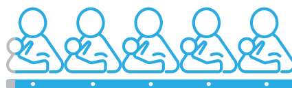
Figure 1 Share of babies that are breastfed in high-, low- and middle-income countries.

In low- and middle-income countries, almost all babies are breastfed