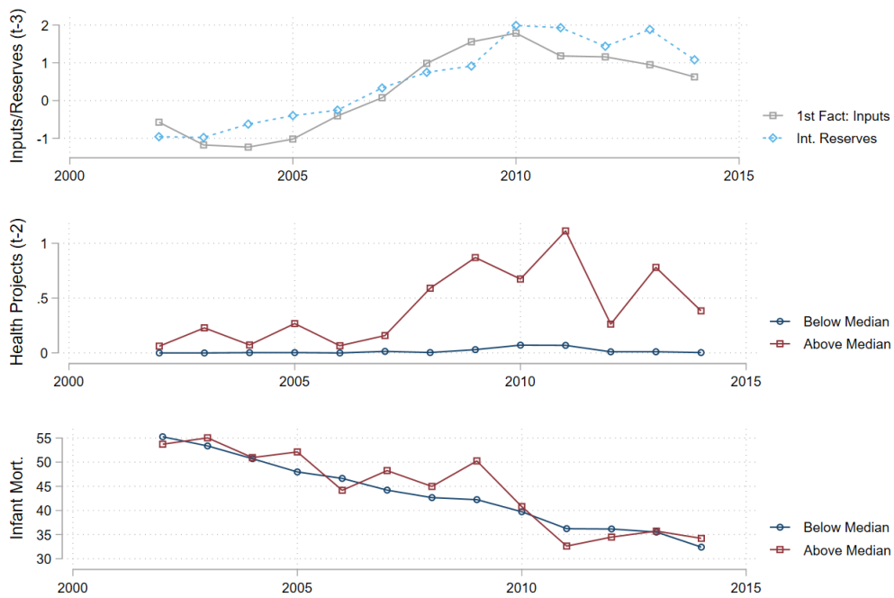
Figure 1 – Testing Spurious Trends: China

Notes: The first panel shows the first principal factor of China's (logged and detrended) production of aluminum (in 10,000 tons), cement (in 10,000 tons), glass (in 10,000 weight cases), iron (in 10,000 tons), steel (in 10,000 tons), and timber (in 10,000 cubic meters) over time. It also shows the (detrended) change in net foreign exchange reserves (in trillions of constant 2010 US dollars). The second panel shows the average number of Chinese health projects within the group that is below the median of the probability of receiving projects and the group that is above the median (conditional on receiving any project). The lower panel shows the infant mortality rate within these two groups.