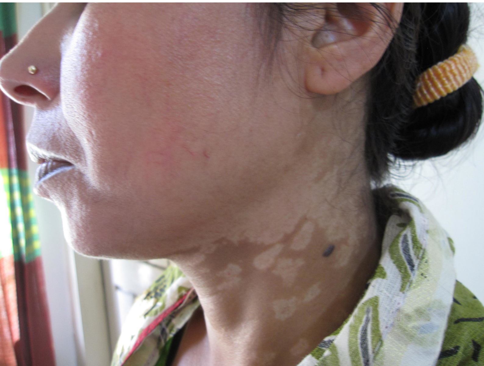
PKDL from Bangladesh: confluent macular rash involving most of the face.