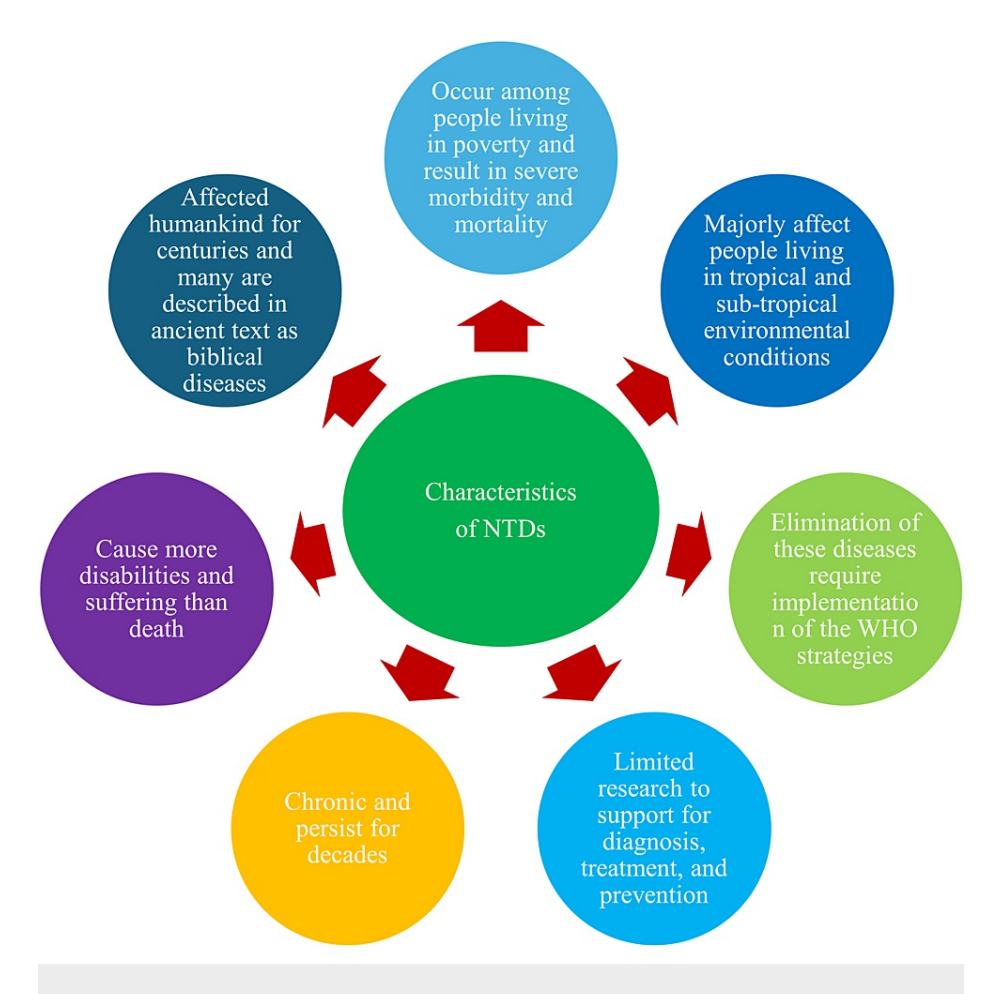
FIGURE 1: Characteristics of neglected tropical diseases (NTDs)