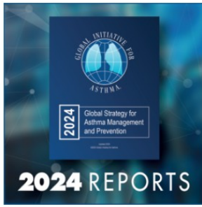
GUIDELINES & REPORTS