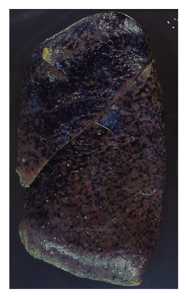
Figure 1 - Anthracotic lung. Inhaled particulates are usually cleared through the respiratory mucociliary apparatus and scavenged by alveolar macrophages. Particles can move into the interlobular septal lymphatics and be cleared by the lymphatic system, but if these mechanisms are overwhelmed, particulates may clog lymphatics and be deposited in the lung interstitium. Ultrafine particles gain entrance to mobile cells and can be transported to all parts of the body. Although this anthracotic lung is characteristic of smokers and workers in dusty occupations, anthracotic deposits are often found in urban dwellers from air pollution.

include Toll-like receptor 4, tumor necrosis factor-α, transforming growth factor-β, and many others, have been found to increase susceptibility to the respiratory effects of pollution.<sup>17</sup> Air pollutants affect both the innate and adaptive immune systems. PM disturbs the balance of the Th1 and Th2 leukocyte populations, resulting in dominant Th2 leukocytes, which is a feature of asthma.<sup>19</sup>