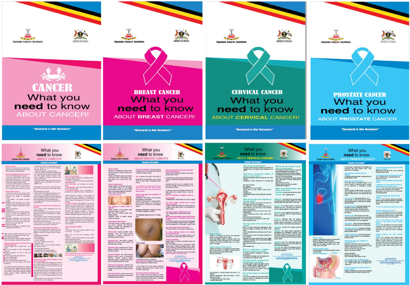
FIGURE 3 Cancer information brochures and posters for public cancer awareness.

planned districts were trained (Table 3). Cancer survivors' volunteers were included in this training to equip them basic cancer key messages to support raising cancer awareness and demonstrating the evidence of cancer survival, and benefit of early detection in saving life through sharing lived experience in the communities. During the training, each district health team were advised on the need to identify a focal point person in their district on matters concerning primary prevention and early detection of cancer. Forty-six health workers in the pilot East-central subregion (Figure 1) were further trained in cervical, breast, and prostate cancer screening techniques