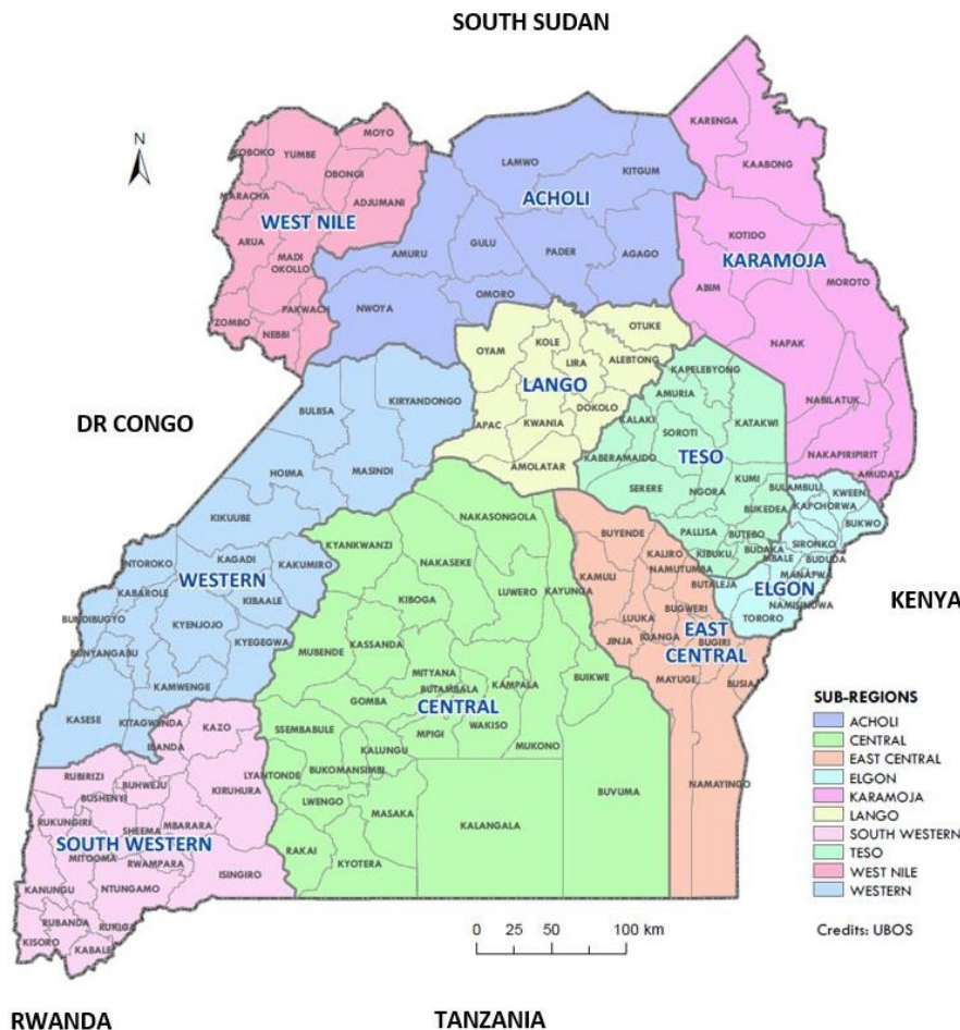
FIGURE 1 Map of Uganda showing the regions, subregions, and districts where the district stakeholders' meetings and training of PHC workers were conducted. Adapted from: Uganda Bureau of Statistics (UBOS). In this map, Western region = Western and South Western, Northern = Acholi, West Nile and Lango, Eastern region = East-central, Elgon, Teso and Karamoja. During the capacity building activities, Acholi, Lango, and Karamoja were zoned as Northern region and North-western districts zoned with West Nile.

prostate, Kaposi sarcoma, esophageal, liver, lymphoma, leukemia, colo-rectal, and childhood cancers. In cancer screening pilot districts in East-central subregion, 46 health workers from 10 health facilities were further intensively trained for 10 days and equipped to provide routine cancer screening for the most common types of cancer in Uganda.