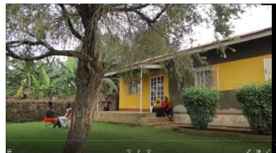
Cervical cancer awareness audiovisual messages for mass and social media dissemination