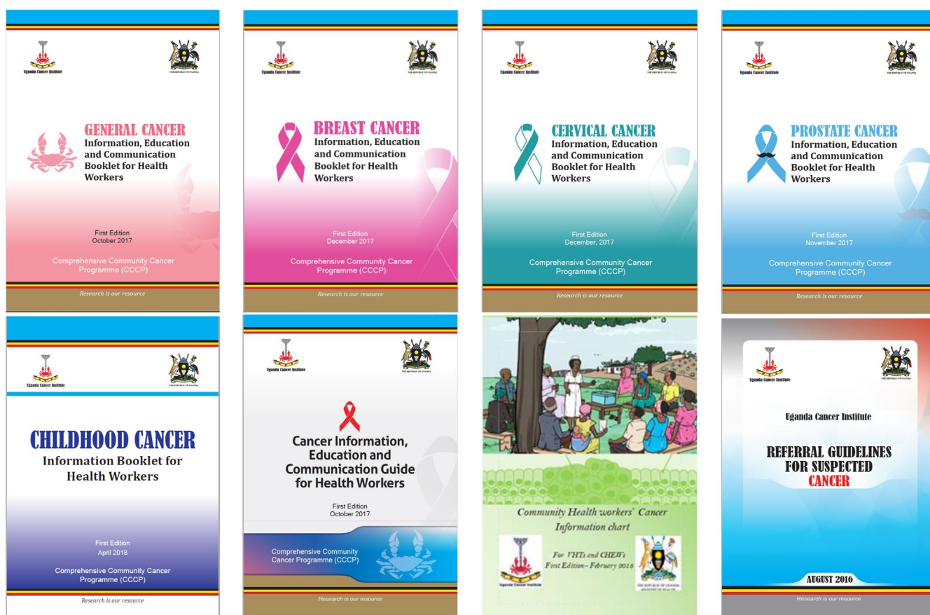
FIGURE 2 Cancer information, education, and communication materials for primary healthcare workers and community village health teams.

A total of 488 health workers (482 district health workers and six cancer survivors’ volunteers) from 118 out of 122