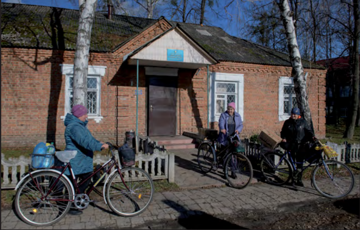
☞ ↑ Social workers in Krasnopillia, a town less than 10 kilometres away from the Russia-Ukrainian border, prepare to bike to remote villages with groceries and medications for their clients.