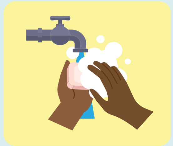
Lave men ou souvan avèk savon ak dlo potab.