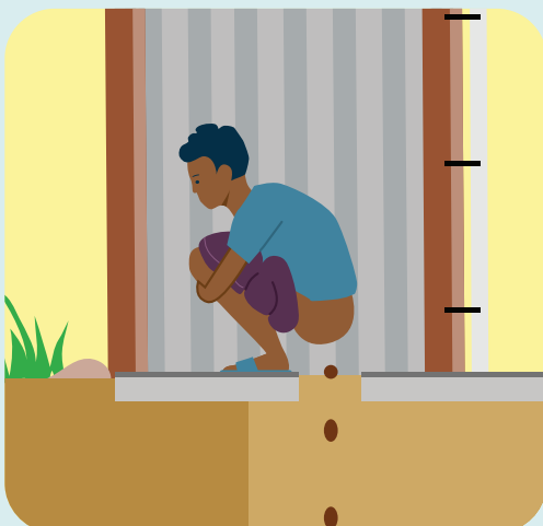
Itilize twalèt oswa latrin.