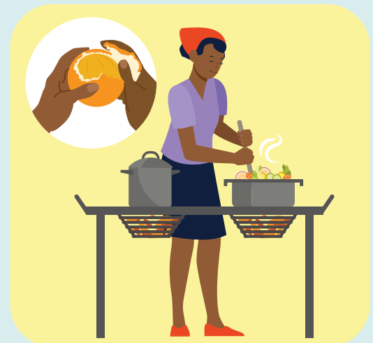
Kwit manje yo byen, kenbe yo cho, epi kale fwi ak legim yo.