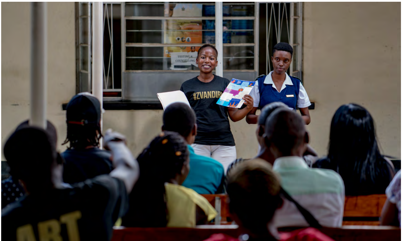
During an adolescent ART refill day at the clinic, young peers and a nurse use adolescent-focused fact sheets and group discussion to share information with other young people

There is a well established link between mental health and HIV outcomes. Poor mental health can directly affect the health and well-being of adolescents and young adults living with HIV by negatively affecting their ability and motivation to seek health care and to be retained in HIV care. HIV-associated mortality has declined at a slower pace in adolescents than in other populations, highlighting the significant and dire consequences of treatment interruptions and inadequate support for care, monitoring and adherence for this population (9). For adolescent girls and young women who become pregnant and give birth, these impacts can also extend to their children (10, 11). Evidence shows that younger mothers are at significantly higher risk of mother-to-child transmission of HIV than are older mothers (12, 13).