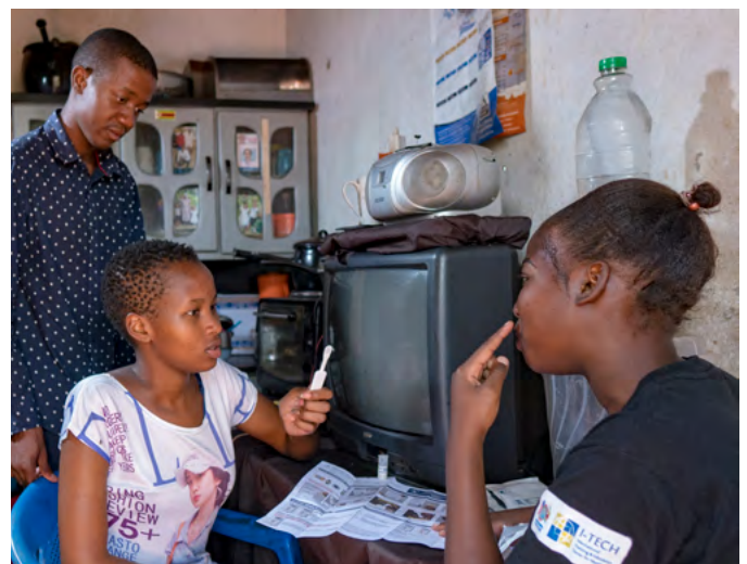
After a counselling session and with permission from the caregiver, a young peer shares information around HIV testing services with another peer.

Some studies work to integrate adolescents and young adults living with HIV from early on: co-development of interventions with adolescents and young adults is becoming a more prominent aspect of these interventions, as researchers and practitioners recognize the importance of equitable, intentional and mutually-respectful youth engagement (50, 51, 52). Importantly, these approaches may maximize acceptability, feelings of satisfaction and value, and attendance and engagement with the intervention.