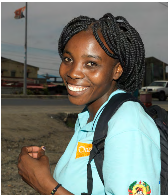
Peer Supporter going for a community visit under the READY+ Programme

M&E systems should be carefully considered in the implementation of integrated psychosocial and HIV services, with particular emphasis on age disaggregation along 5-year age bands by age and gender, with specific efforts to include data on and to monitor adolescents who may be marginalized and young key populations.