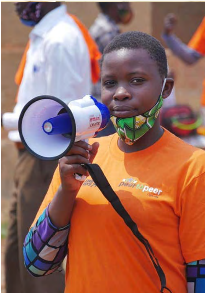
Peer supporter during Covid19 Awareness, 2020

Scale-up considerations should start from early on in the planning and implementation of evidence-based programmes. To effectively expand participation and build buy-in, diverse stakeholders, including representatives from the health, education, justice, social development, finance, civil society, academic and non-profit sectors, alongside community members, should be engaged to map needs and align priorities. Integration should be specifically supported through national strategies and policies, and within results-monitoring frameworks.