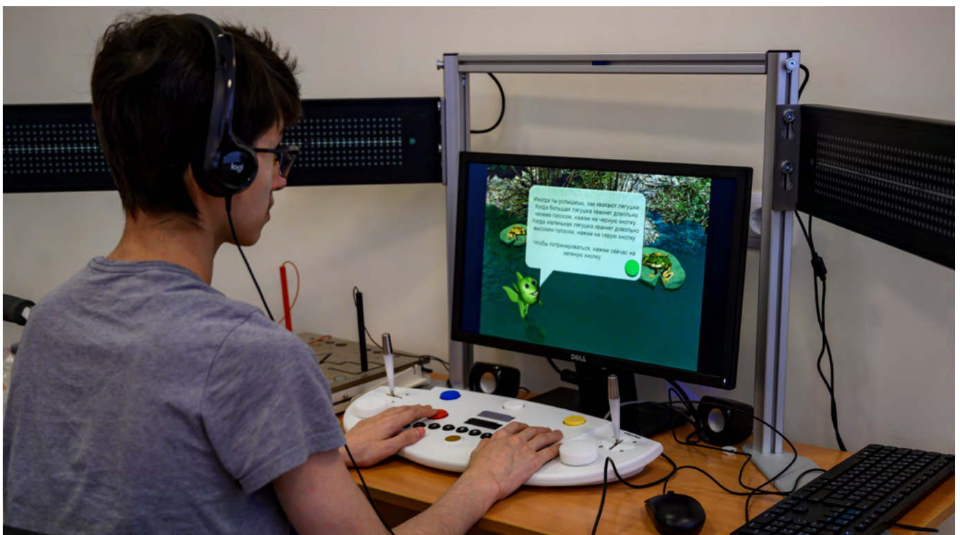
Patient during a Neurocognitive and psychophysiology lab session at the National Medical Research Center for Pediatric Hematology, Oncology and Immunology in the outskirts of Moscow.

Many of the participating young mothers facing isolation, blame and multiple types of stigma also learn of their HIV status during their first antenatal appointment. Linking these groups to facilities enables peer supporters to identify and enroll young mothers at these pivotal moments. In small group settings, peer supporters guide participating young mothers through modules that utilize cognitive-behavioural therapy (CBT) approaches in tandem with components such as psychoeducation and support networking. In some implementation settings, ABCD has moved from being strictly facility-based to a more flexible delivery approach, enabling young mothers to convene with peer supporters where they are most comfortable. Peer supporters also have a supervisor with whom they meet regularly who provides logistical support as well as additional mentorship and debriefing support, as needed.