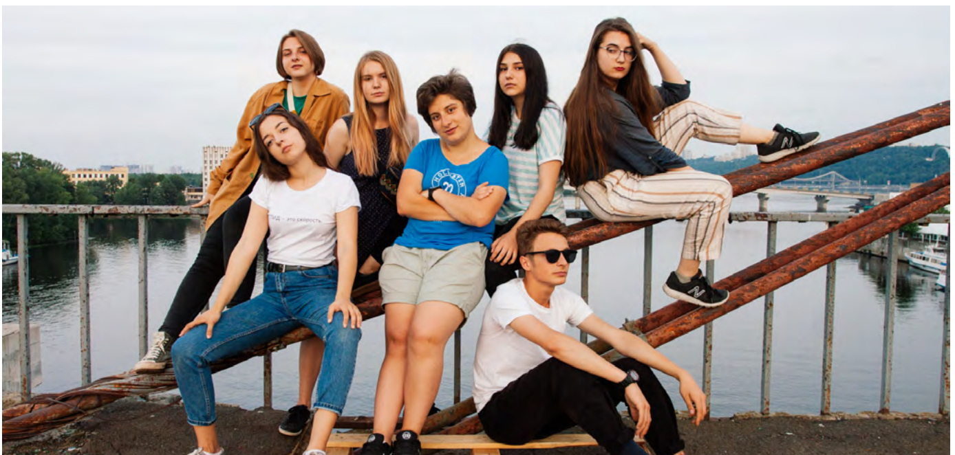
Group of young friends in cool pose, standing and sitting on pallet and metal bars, in front of railings by an urban waterfront.

“I could not face the society and the self-stigma was always around me, but I got support and somebody sharing her own experience and monitoring me, making sure that I attend the support groups. When my date for resupply was near, they would remind me. Psychosocial support (PSS) really helps adolescents living with HIV.” (WHO Values & Preferences Report, Zimbabwe)