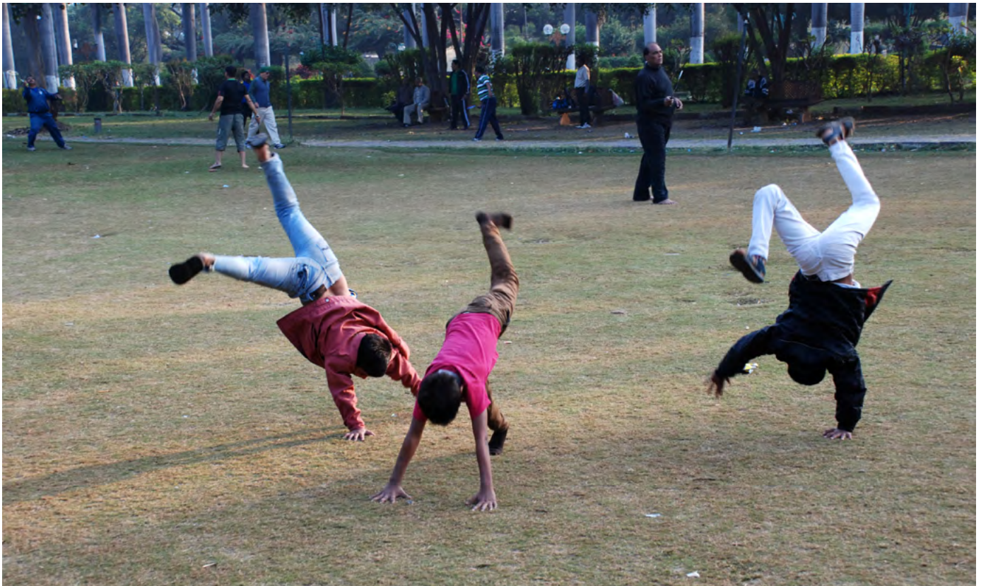
Adolescents doing cartwheels in a park

Mental health promotion and prevention is thus a critical priority for this group. Psychological and clinical services for mental health are out of reach for many of the world's adolescents and youth, especially in the countries and settings most affected by HIV. Broader-based interventions have greater potential to reach adolescents and young adults living with HIV at scale and to be tailored to their specific needs. Psychosocial interventions have the potential to support healthy behaviours, bolster mental health and lead to improvements in physical and mental health for this group (18, 19). These interventions can also play a role in preventing or mitigating mental health disorders. While these are critical strategies for supporting the mental health of all adolescents and young people, they are especially important for adolescents and young adults living with HIV, given their distinct experiences and the additional stressors they manage while living with chronic illness.