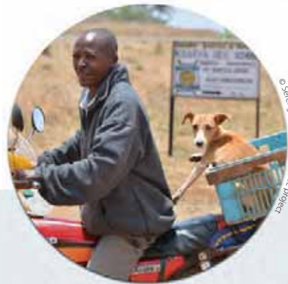
© Sanga Wet School, canine disease project