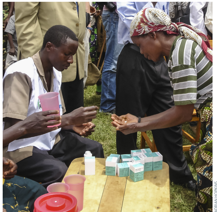
Community distribution of ivermectin (Mectizan®). BURUNDI

A further paradigm shift occurred when research showed that ivermectin alone could interrupt the transmission of infection in Africa. This had already been demonstrated in Latin America, where the disease occurs in small, isolated areas, or foci.