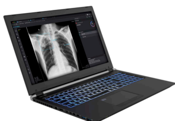
(Laptop to be procured separately)

InferRead DR Chest Software was introduced in the market in 2020. It is able to detect multiple different pathologies including TB, for which it processes both antero-posterior (AP) and postero-anterior (PA) chest X-ray in less than 10 seconds. The output is a binary outcome for TB, continuous values for TB-probability and annotated images with rectangles indicating the areas identified as TB.