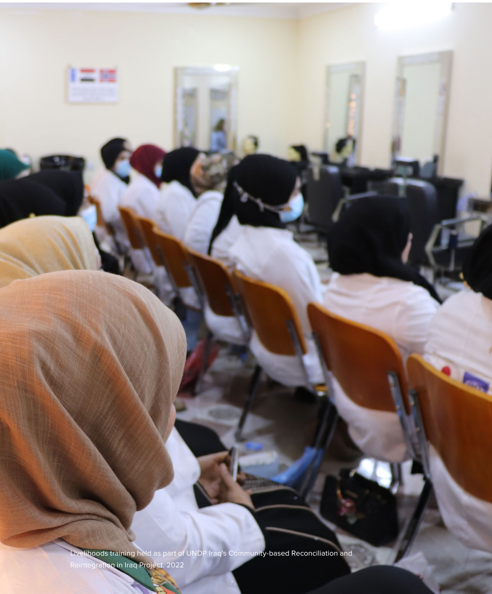
Livelihoods training held as part of UNDP Iraq's Community-based Reconciliation and Reintegration in Iraq Project. 2022