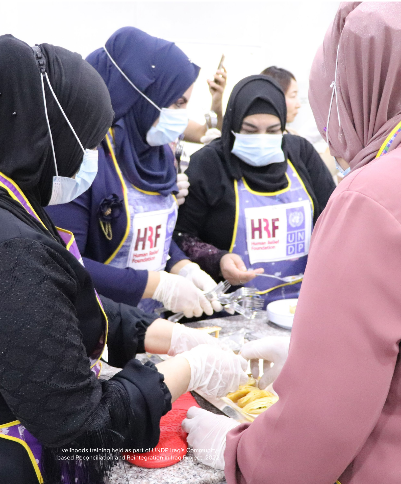
Livelihoods training held as part of UNDP Iraq's Community-based Reconciliation and Reintegration in Iraq Project, 2022.