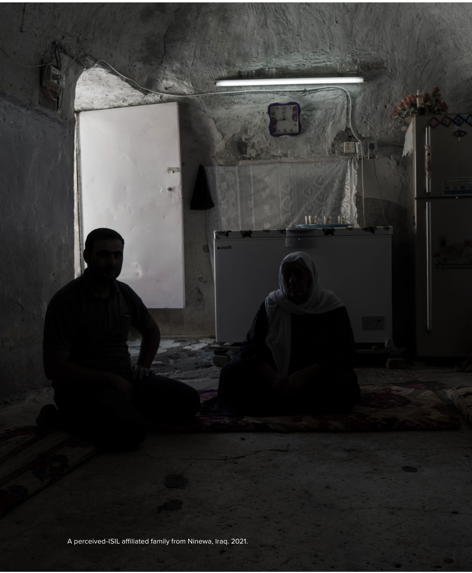
A perceived-ISIL affiliated family from Ninewa, Iraq. 2021.