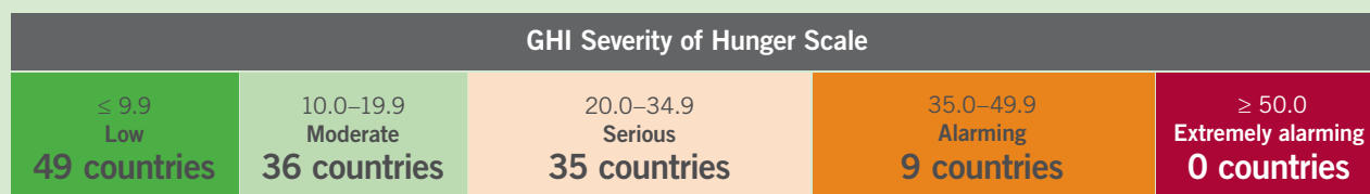
FIGURE 2 NUMBER OF COUNTRIES BY HUNGER LEVEL ACCORDING TO 2022 GHI SCORES

The GHI categorizes and ranks countries on a 100-point scale: values of less than 10.0 reflect low hunger; values from 10.0 to 19.9 reflect moderate hunger; values from 20.0 to 34.9 indicate serious hunger; values from 35.0 to 49.9 are alarming ; and values of 50.0 or more are extremely alarming (Figure 2).