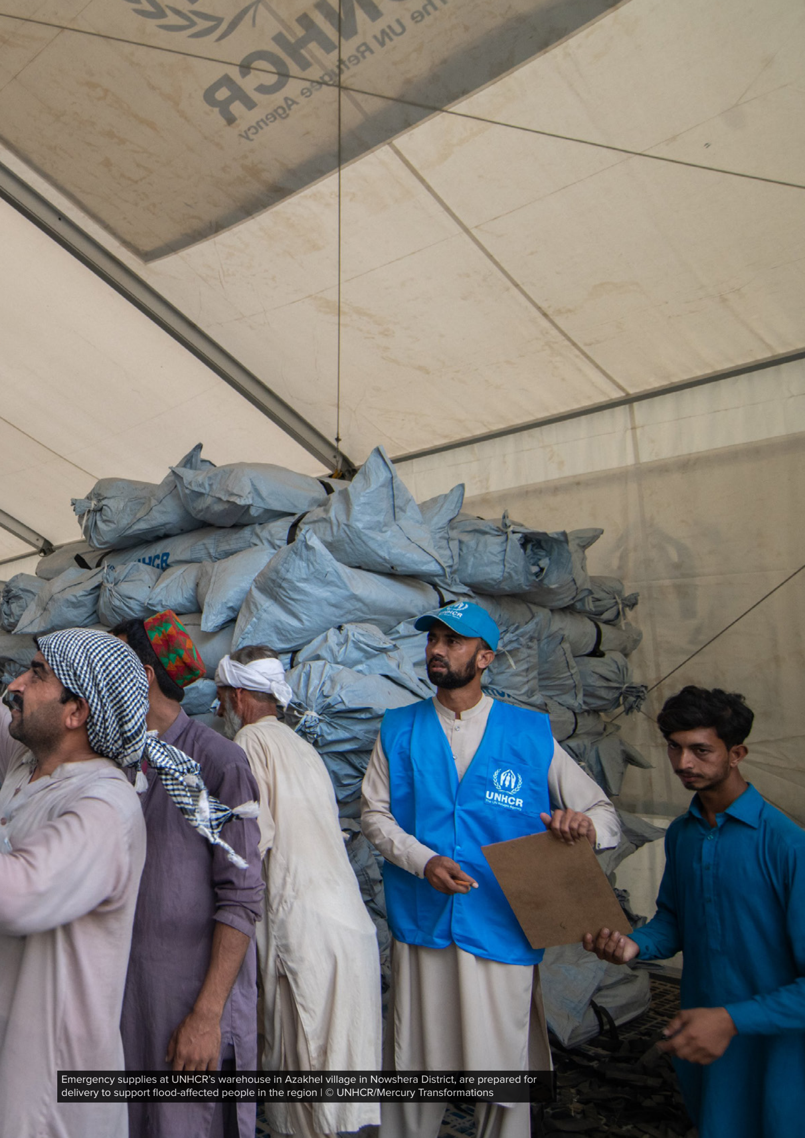
Emergency supplies at UNHCR's warehouse in Azakhel village in Nowshera District, are prepared for delivery to support flood-affected people in the region