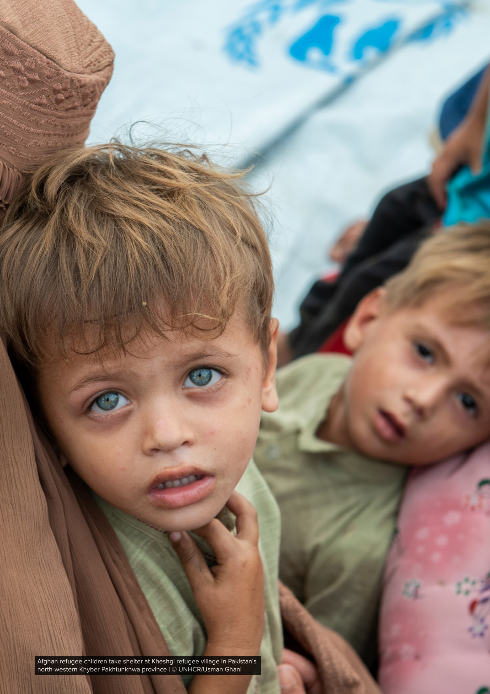
Afghan refugee children take shelter at Khesghi refugee village in Pakistan's north-western Khyber Pakhtunkhwa province