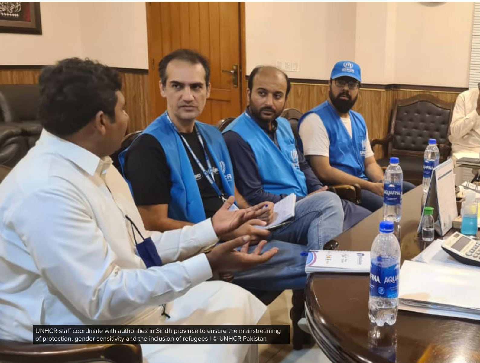
UNHCR staff coordinate with authorities in Sindh province to ensure the mainstreaming of protection, gender sensitivity and the inclusion of refugees

enhanced climate and flood resilience in Pakistan. The PDNA will incorporate principles of good governance, social inclusion and gender equality and sustainable development, and will seek to improve social, environmental and physical resilience. Currently data collection and analysis is in progress and the final report of PDNA will be submitted by mid-October, 2022.