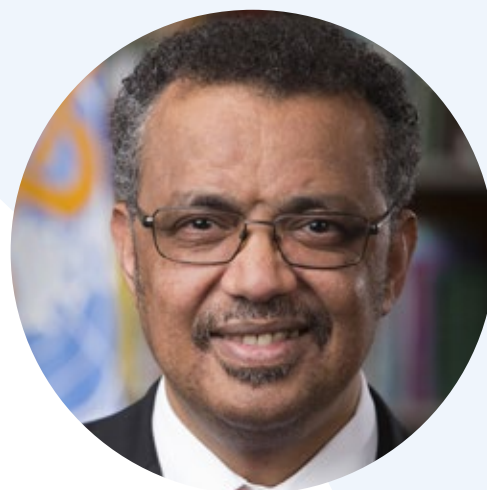
Dr Tedros Adhanom Ghebreyesus Director-General World Health Organization

The plan's ambitious scope is designed to address the long-standing neglect of neurological disorders. Member States, national and international partners, and WHO must work together to realize the action plan's vision of a world in which brain health is valued and protected across the life course; neurological disorders are prevented, diagnosed and treated; premature mortality and morbidity are avoided; and people affected by neurological disorders have equal rights, opportunities, respect and autonomy.