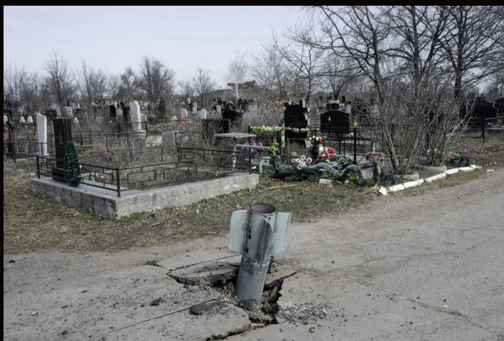
The rocket motor and tail section of a 220mm Uragan cluster munition rocket that struck a cemetery in Mykolaiv, southern Ukraine, March 21, 2022.

The report urges both Russia and Ukraine to immediately stop using cluster munitions. It also calls on them to join the 2008 Convention on Cluster Munitions, which bans all use of the weapon and requires destruction of stockpiles, clearance of areas contaminated by cluster munitions remnants, and assistance to victims.