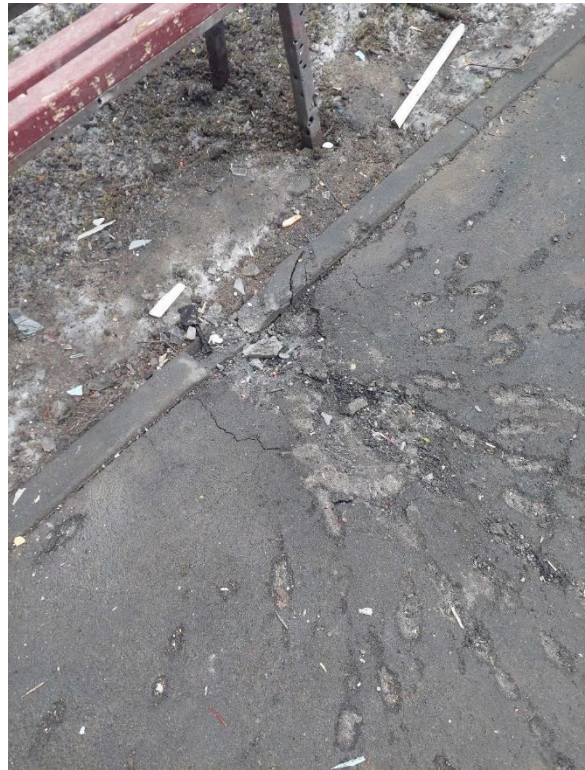
The splatter pattern at an impact site in Kharkiv consistent with the detonation of a 9N235 fragmentation submunition. A piece of stabilization fin from this type of submunition is visible in the crater.