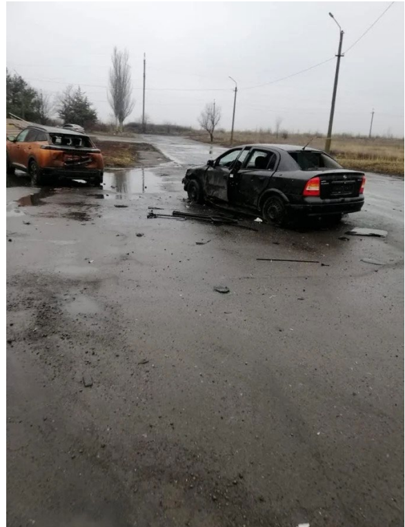
Two damaged civilian vehicles outside the entrance of the Central City Hospital in Vuhledar, February 25, 2022. The asphalt on the left shows impact splatter from the detonation of a submunition.