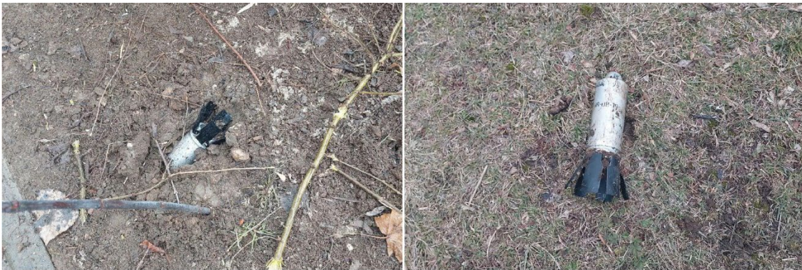
Unexploded 9N235 submunitions in Kharkiv after the February 28 attack. Each 9M55K Smerch cluster munition rocket carries a total of 72 of these submunitions.