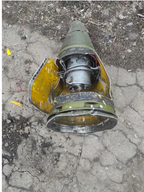
9N123 cluster munition warhead nose cone.