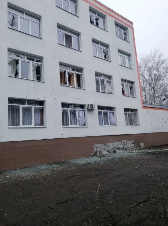
Fragmentation damage from a cluster munition attack outside the Central City Hospital in Vuhledar, February 25, 2022.

The exact number of Russian cluster munition attacks that have occurred thus far in the 2022 conflict is not known, but hundreds have been documented, reported, or alleged, and mostly in populated areas. At least eight of the country's 24 oblasts (provinces) have experienced the use of cluster munitions: Chernihiv, Dnipropetrovsk, Donetsk, Kharkiv, Kherson, Mykolaiv, Odesa, and Sumy.