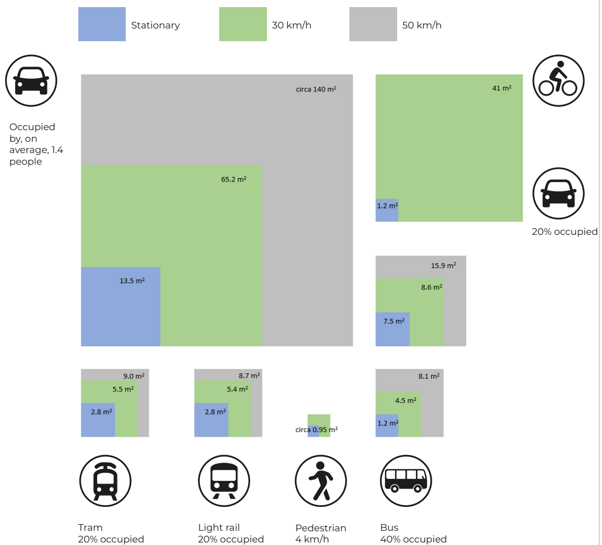
Figure III Comparison of space consumption (per person) for cars, buses, tramways, light rail, bicycles and pedestrians