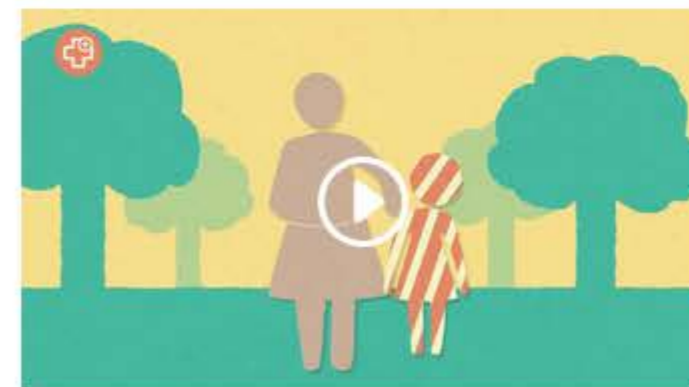
Extra care for children needing more help