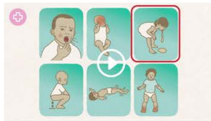
Healthcare when children are sick