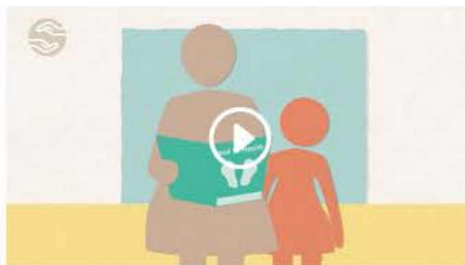
Protection to keep children healthy and happy