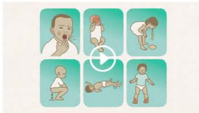
Introduction to the Road to Health book

Download and share these videos with caregivers using your social media channels, WhatsApp, or show them to caregivers on a screen during in-person interactions. These video should always be shown with sound on.