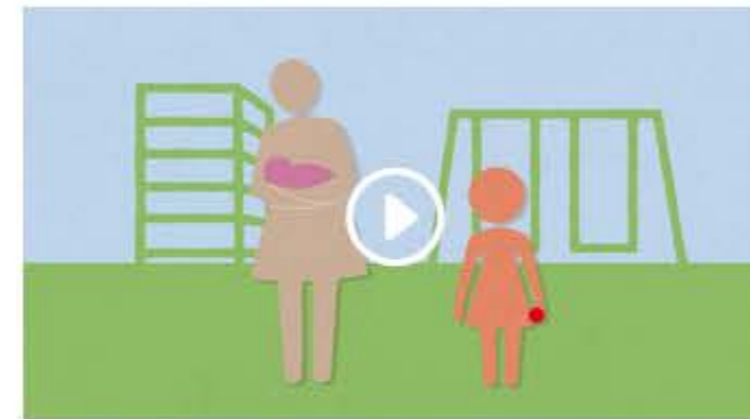
Responsive caregiving and its importance