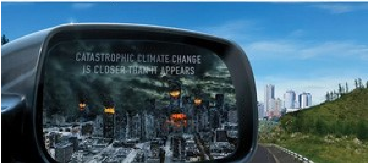
Impact of Health Care on Climate (12/22/2020)