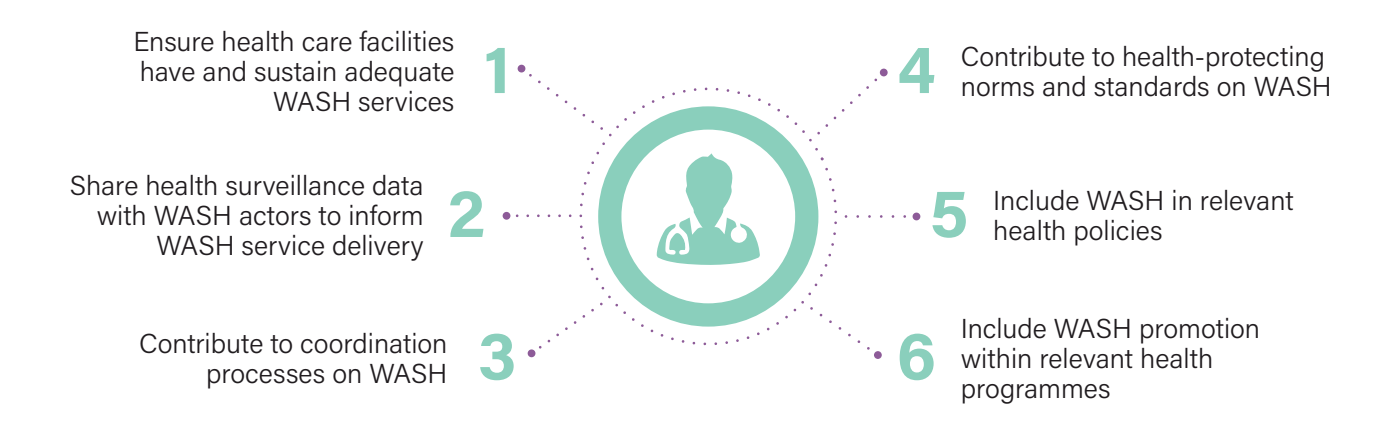
Fig. 2 | Key health sector's functions in WASH