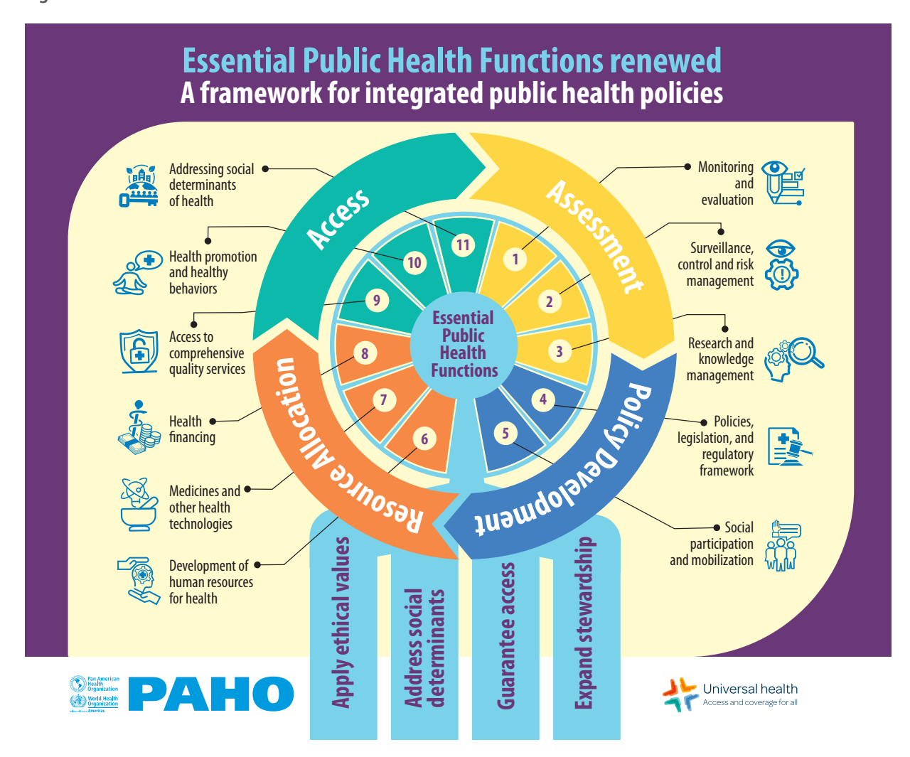
Figure 2. PAHO Essential Public Health Functions Framework