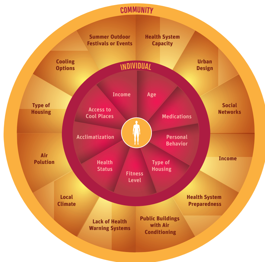
Figure 2. Factors that influence individual and community-level vulnerability to extreme heat events