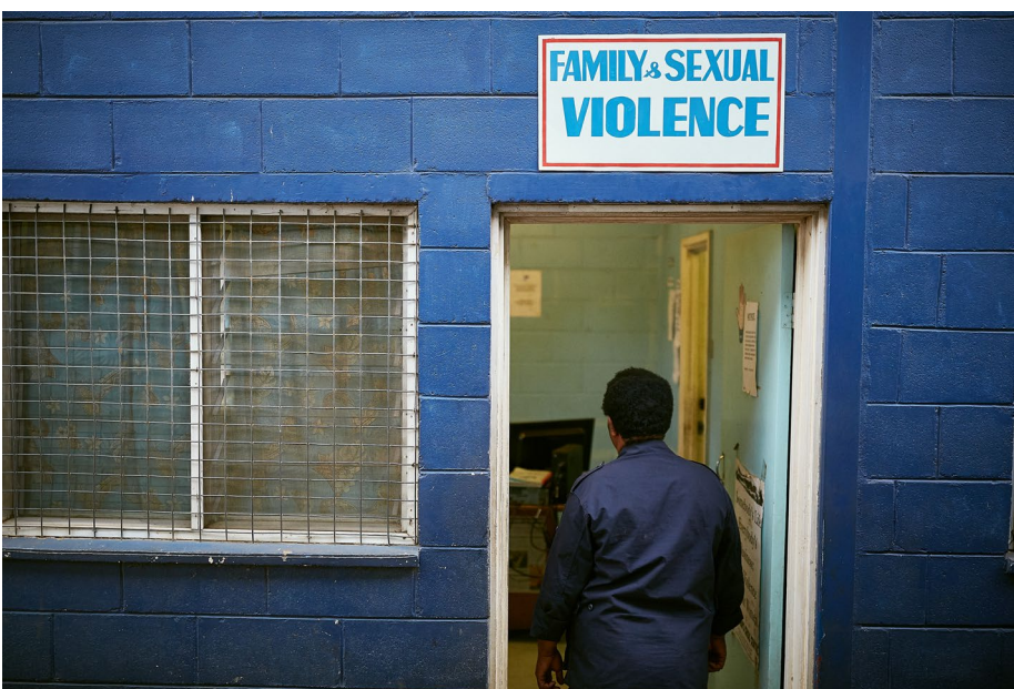
In Papua New Guinea: Marie* investigates gender-based crimes.

Outside of their homes, women were regularly forced to disobey curfews, lockdowns or stay-at-home orders due to their need to earn a living, to find food and water for their households, or to perform the care work society disproportionately expects of them and which, also increased during the pandemic. 18 More than 90% of women workers in developing countries are employed in the informal sector, 19 lacking employment protections and social safety nets such as coronavirus relief payments. With little choice but to continue working, they faced harassment and brutalization by police and military authorities enforcing coronavirus control measures such as checkpoints, quarantines and curfews. 20 Equally, in sectors of the workforce where women, including trans women are overrepresented, such as the domestic work and healthcare sectors, workers have seen dramatic increases in violence, 21 as have migrant women workers, isolated with their employers and unable to reach family and support networks. 22