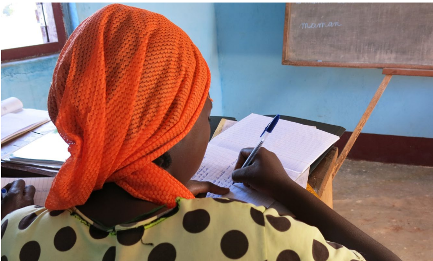
A young woman follows a literacy class at the Women’s Home in Bria, in the heart of the Central African Republic, which offers education to survivors of violence.