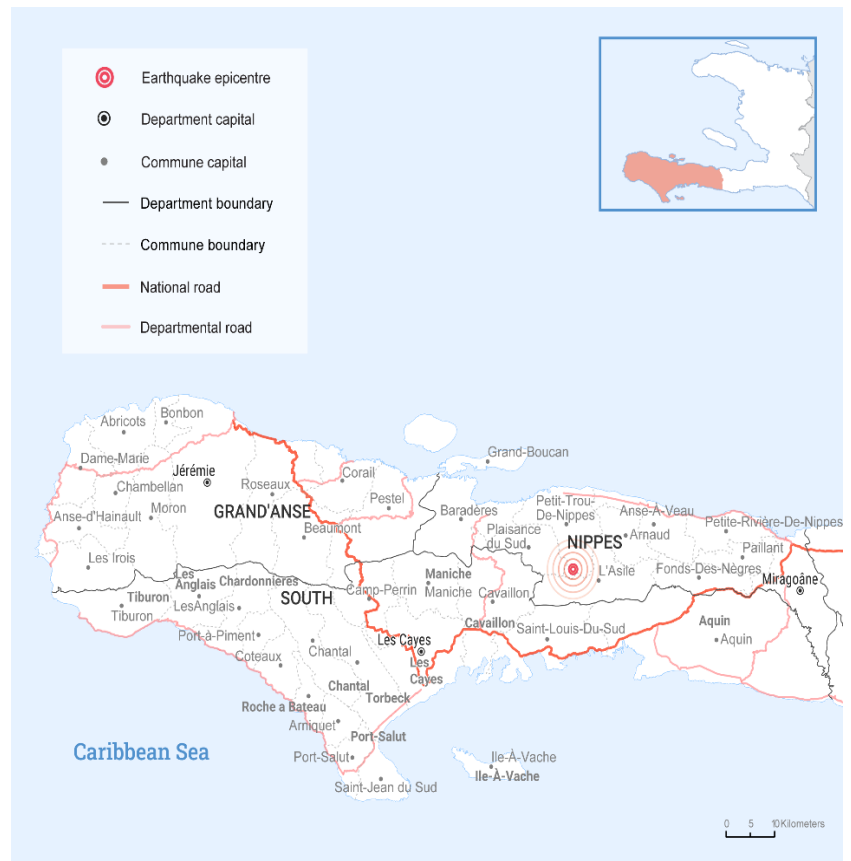
The boundaries and names shown and the designations used on this map do not imply official endorsement or acceptance by the United Nations. Creation date: 15 Aug 2021 Sources: CNIGS Feedback: ocha.haiti.im@gmail.com | www.unocha.org www.reliefweb.int | www.reliefweb.int