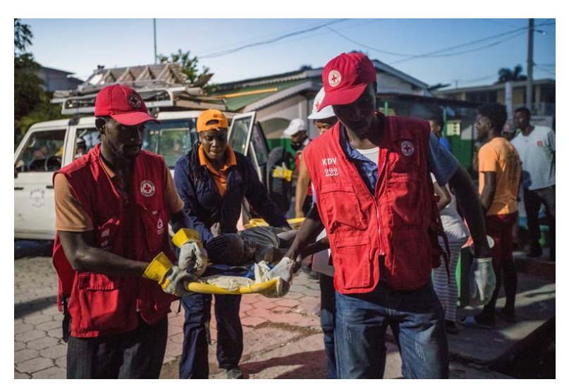
Red Cross paramedics carry a girl injured during a 7.2 magnitude earthquake in Les Cayes, Haiti 14 August 2021.

15 August 2021: The Haiti Red Cross Society mobilises its volunteers and personnel to support the affected population. 750,000 CHF allocated from the IFRC's Disaster Relief Emergency Fund (DREF). IFRC issues Emergency Appeal launched for 10 million CHF to support 25,000 people.