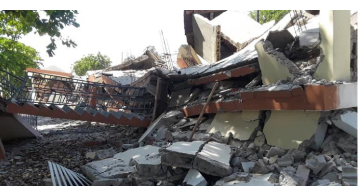
Collapsed buildings in Jérémie. Source: IFRC, 14 August 2021.

An earthquake with a magnitude of 7.2 at a depth of 10.0 km (6.21 miles) has occurred at 13 km southsoutheast of Petit Trou de Nippes, Haiti, as reported by the National Earthquake Information Center (NEIC) of the United States Geological Survey (USGS) on 14 August 2021, 16:02:56 GMT. Based on the preliminary data, earthquakes of this shallow of depth and magnitude are expected to result in moderate to severe shaking within 245.0 km (152.24 miles) from the epicentre. The US Tsunami Warning System issued a tsunami warning that was later rescinded. No tsunami threats are expected.