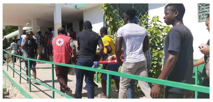
HRCS volunteers and personnel providing first aid services to the affected population.

The Haiti Red Cross Society (HRCS) with support from IFRC is already assessing damages and needs in the affected areas, where services are affected. There are either heavily damaged or destroyed homes, roads, and infrastructure, and the affected communities and households are forced to seek shelter. The HRCS is also supporting search and rescue, first aid, emergency health care, and shelter, which is a priority for the Red Cross. Currently, search and rescue teams are supporting Les Cayes, Nippes, and Grand'Anse. The HRCS is in close communication for a coordinated response with