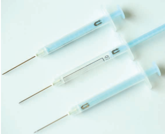
Table 3. Description and sample images of safety features