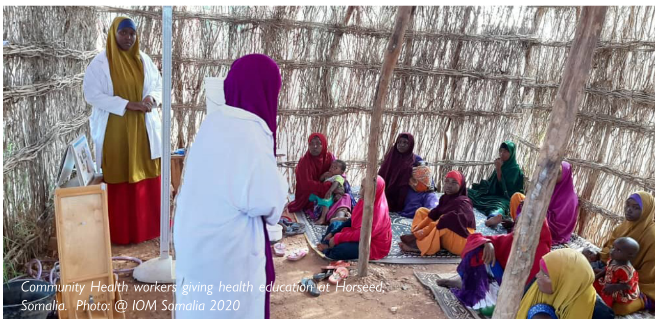
Community Health workers giving health education at Horseed, Somalia.