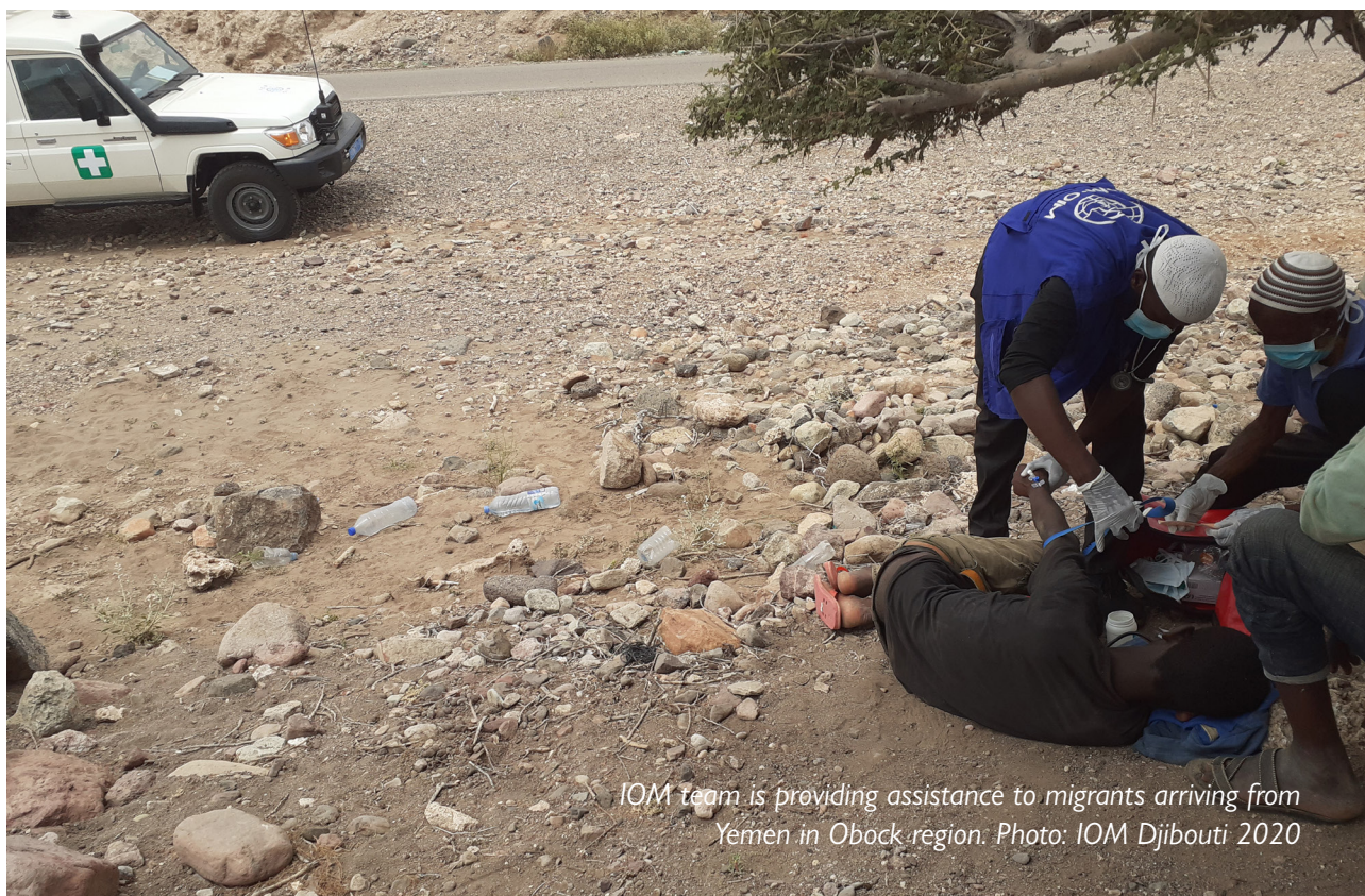
IOM team is providing assistance to migrants arriving from Yemen in Obock region.