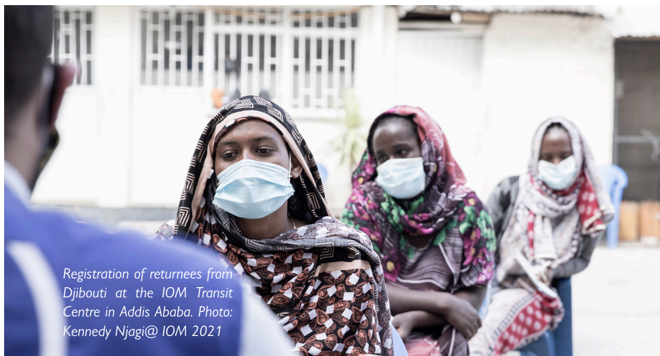
Registration of returnees from Djibouti at the IOM Transit Centre in Addis Ababa.

The longer-term impact of COVID-19 is unknown. Partnerships at national, regional, and global levels are needed in order to develop and enact effective responses. Such responses must guide collective action to leverage well governed migration to support COVID-19 response in line with the policy brief outlining the applicability of the Global Compact in preventing and responding to COVID-19. Recovery from the pandemic will be achieved through well managed intra and inter-regional partnerships, on a whole of government and whole of society approach so that no one is left behind, that recognize the different strengths and expertise of partners by promoting collaboration, enhancing synergies and avoiding duplication.