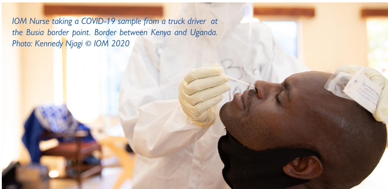
IOM Nurse taking a COVID-19 sample from a truck driver at the Busia border point. Border between Kenya and Uganda.