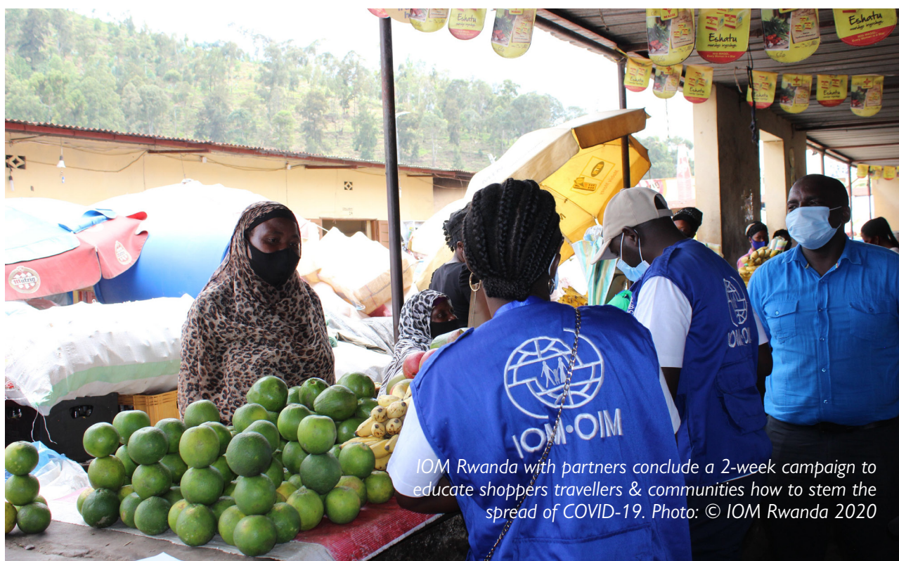
IOM Rwanda with partners conclude a 2-week campaign to educate shoppers travellers & communities how to stem the spread of COVID-19.