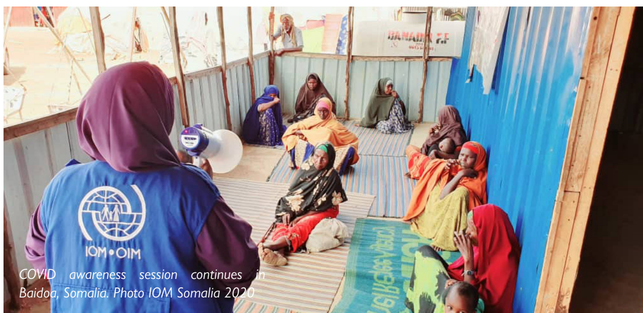
COVID awareness session continues in Baidoa, Somalia.