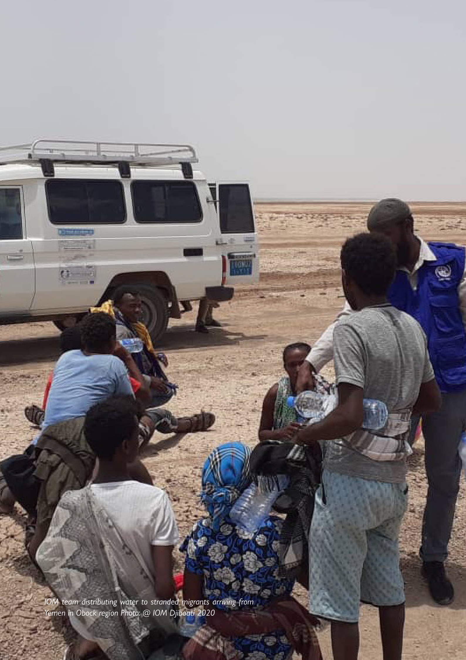
IOM team distributing water to stranded migrants arriving from Yemen in Obock region