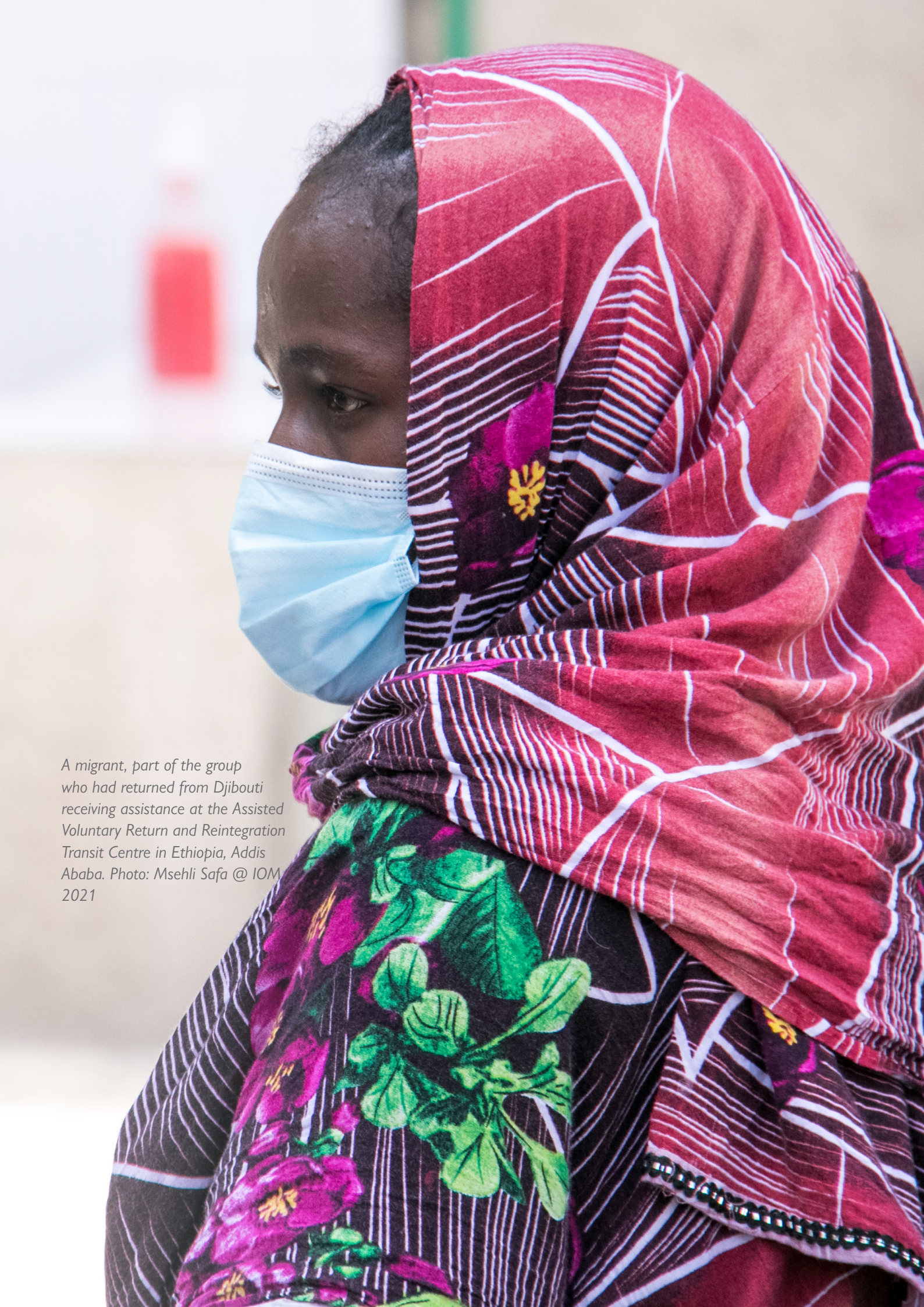
A migrant, part of the group who had returned from Djibouti receiving assistance at the Assisted Voluntary Return and Reintegration Transit Centre in Ethiopia, Addis Ababa.