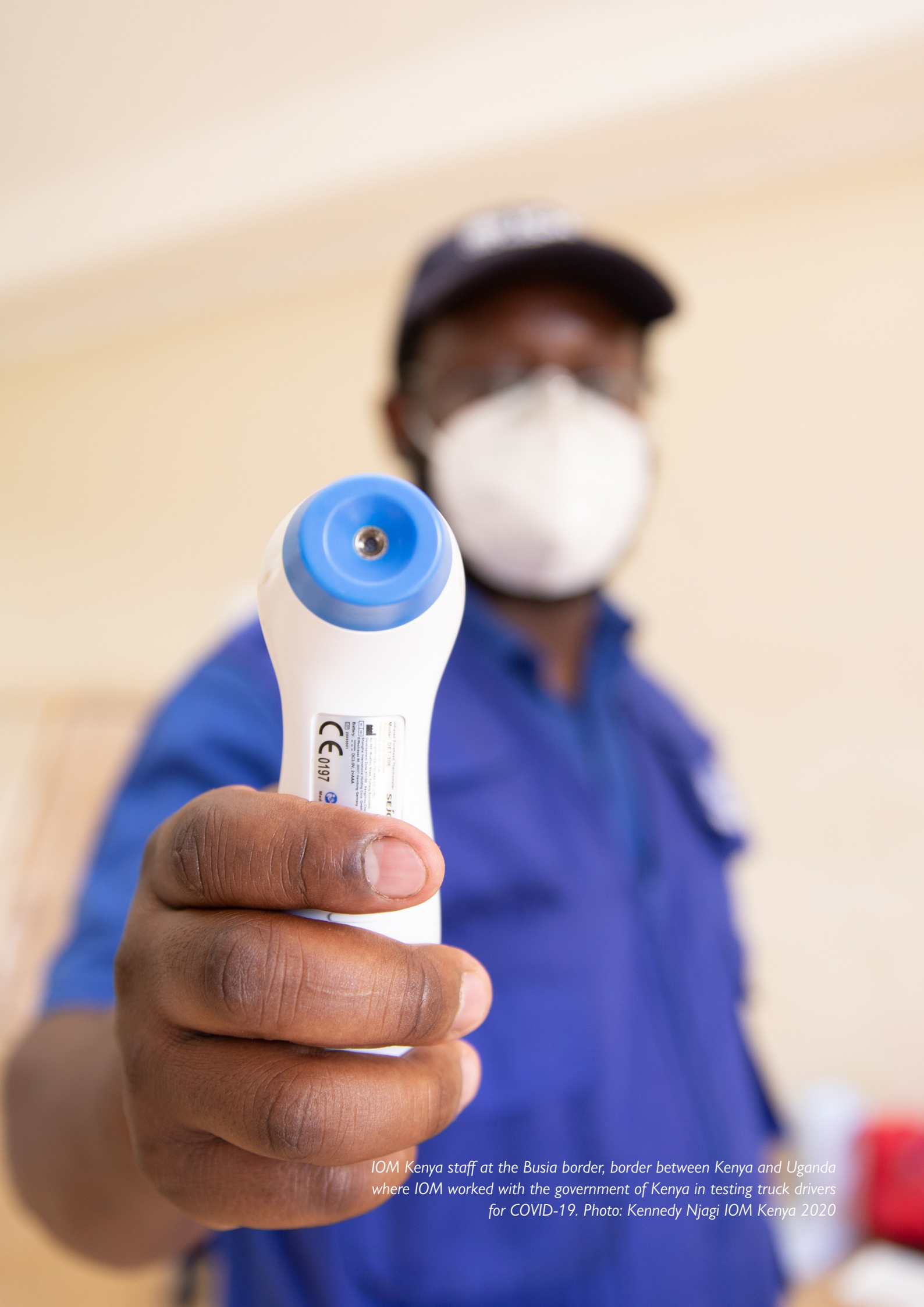
IOM Kenya staff at the Busia border, border between Kenya and Uganda where IOM worked with the government of Kenya in testing truck drivers for COVID-19.