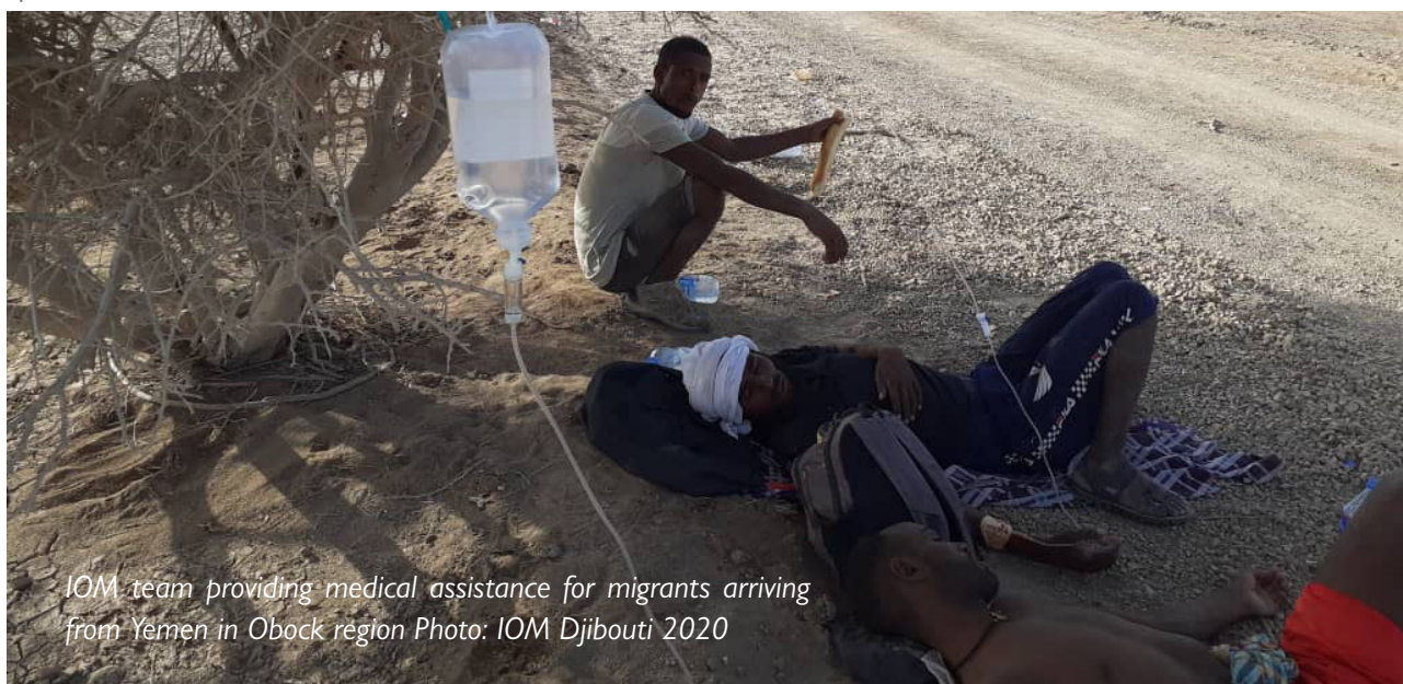
IOM team providing medical assistance for migrants arriving from Yemen in Obock region