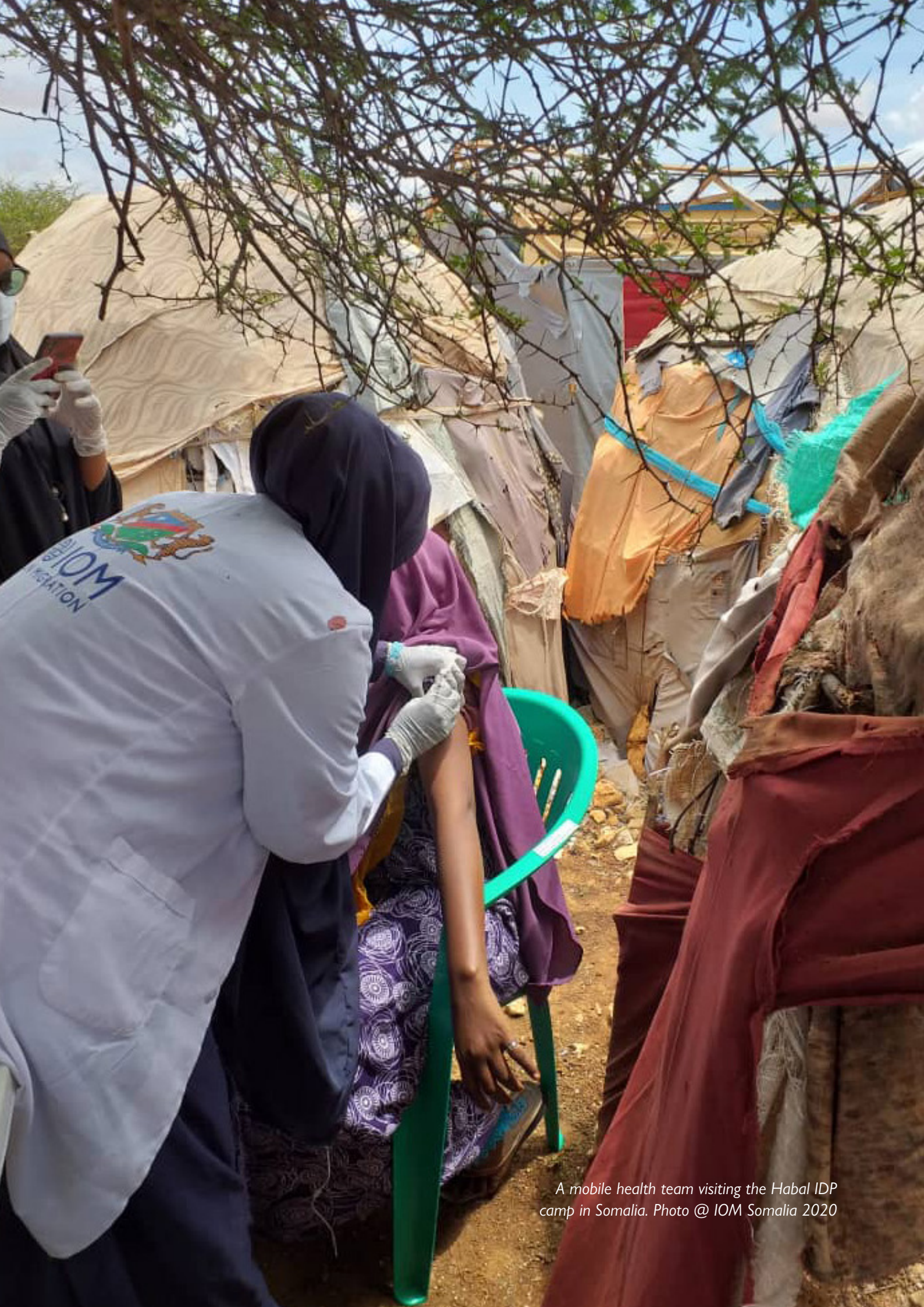
A mobile health team visiting the Habal IDP camp in Somalia.