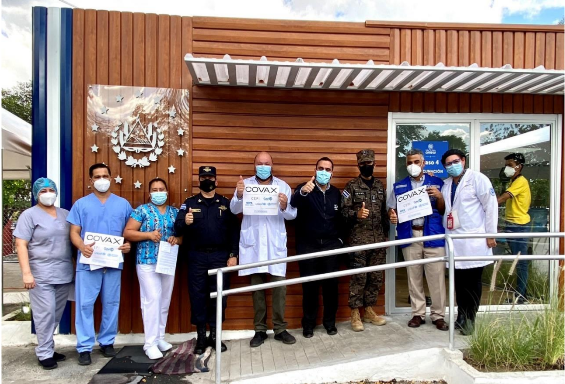
Health Workers thanking for having access to COVID-19 vaccination through COVAX.

The national deployment and vaccination plan (NDVP) for COVID-19 vaccines got underway in July 2020 when news of their development became widespread. In close coordination with PAHO/WHO headquarters in Washington, DC, all critical areas have been upheld, resulting in a comprehensive plan that has hitherto been able to mobilize about US$70 million from national funds. These funds have been used to support training exercises, nominal information systems, repairing cold rooms, setting up storage warehouses, and allocating cold chain equipment. An information system has also been set up to ensure timely administration of second vaccine doses. There are 22 freezers in the country able to stock the Pfizer vaccine, which requires an especially low storage temperature before use.