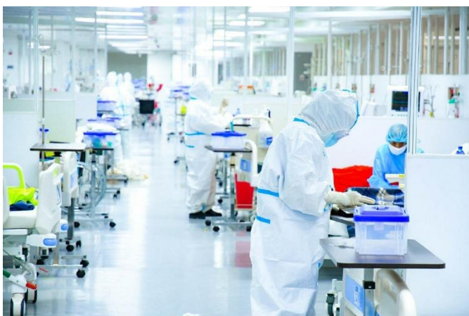
El Salvador went from having only 30 to having over 2,000 beds available in the national hospital network.

The Government took steps, in the absence of a strong welfare system, to absorb the economic shock of lockdown and limit the pandemic's impact on households and businesses. Measures included a cash transfer of US$300 to approximately 60 percent of all households, especially those deriving their income from the informal sector, and the distribution of 2.7 million "food baskets" to lower-income households. Regular instalment payments for basic utilities, mortgages, and personal loans were frozen for three months, income tax payments for individuals and applicable firms were extended, and lending conditions and requirements were relaxed for banks along with a grace period for loan repayments.