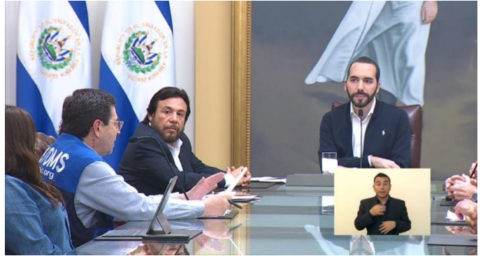
On March 11, after the WHO declared a pandemic, the President of El Salvador mandated a national lockdown and suspended commercial activity for all non-essential sectors.

Although the number of persons testing positive for the new coronavirus has risen gradually since August 5 , El Salvador remains one of the least affected countries in the region with, [As of 16 March], a total of 62 377 positive cases of SARS-CoV-2 and 1954 COVID-19-related deaths.