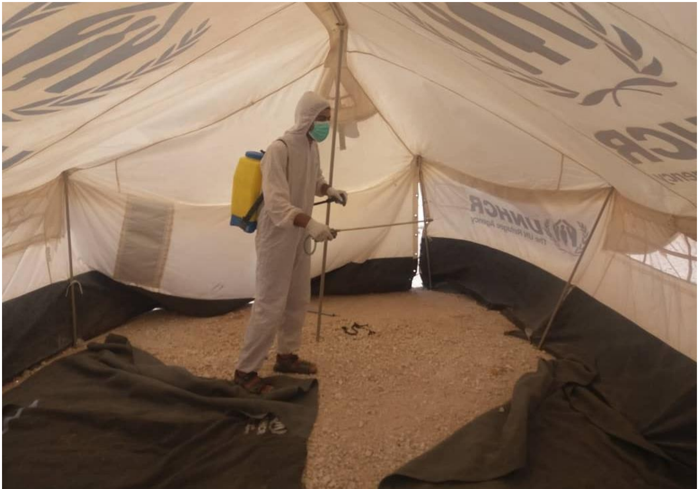
A health worker fumigates a UNHCR tent in Al-Hol Camp, Al Hasakeh Governorate, Syria.