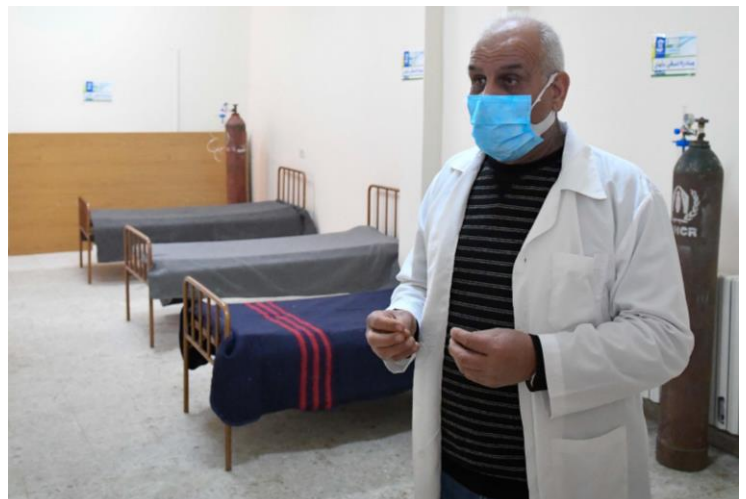
UNHCR equipped a special COVID-19 ward in a primary health care facility in rural Homs, Syria.