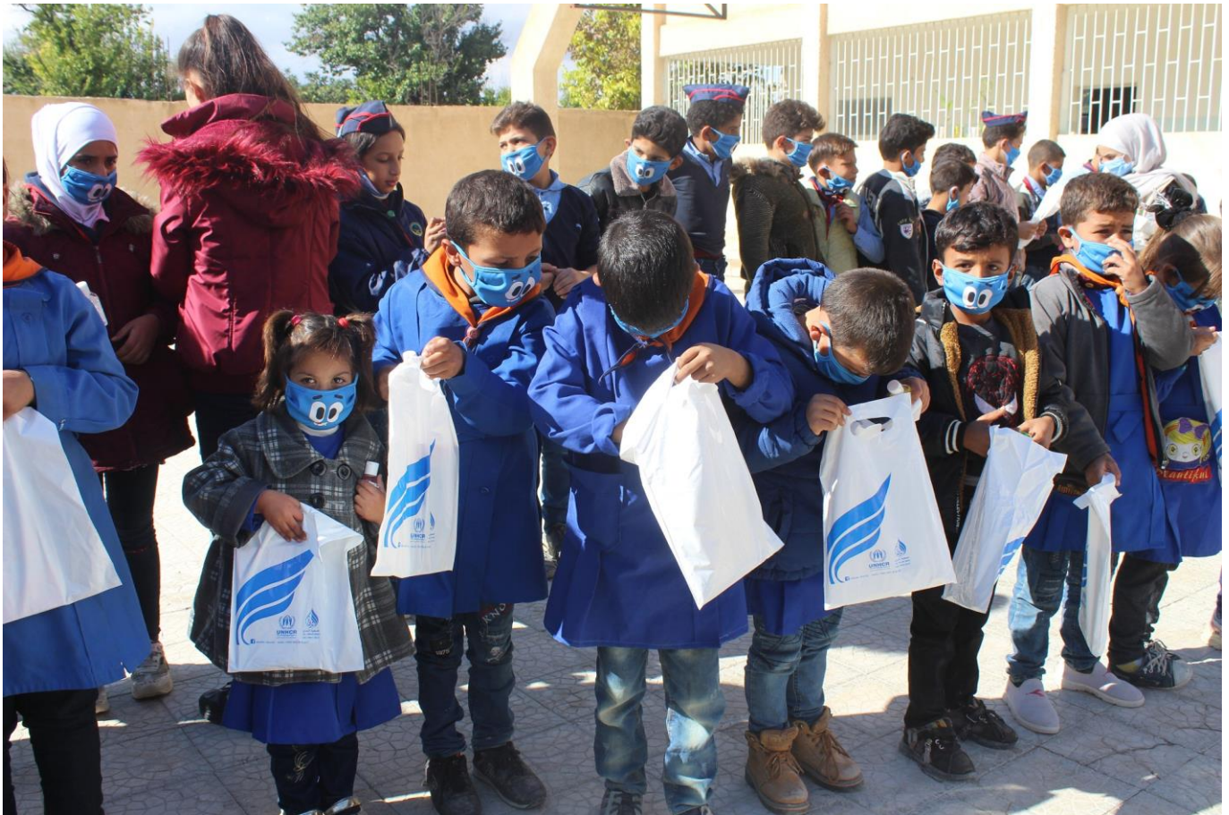
School children in Mleiha village receive facemasks and hygiene kits in Rural Damascus Governorate, Syria.