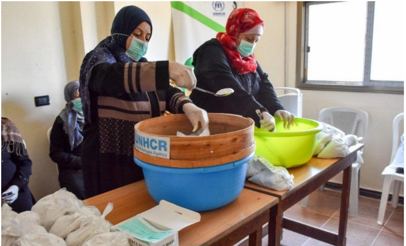
Syrian IDP women distribute washing powder to vulnerable families as part of a community-led initiative in Maskaneh, Homs Governorate.