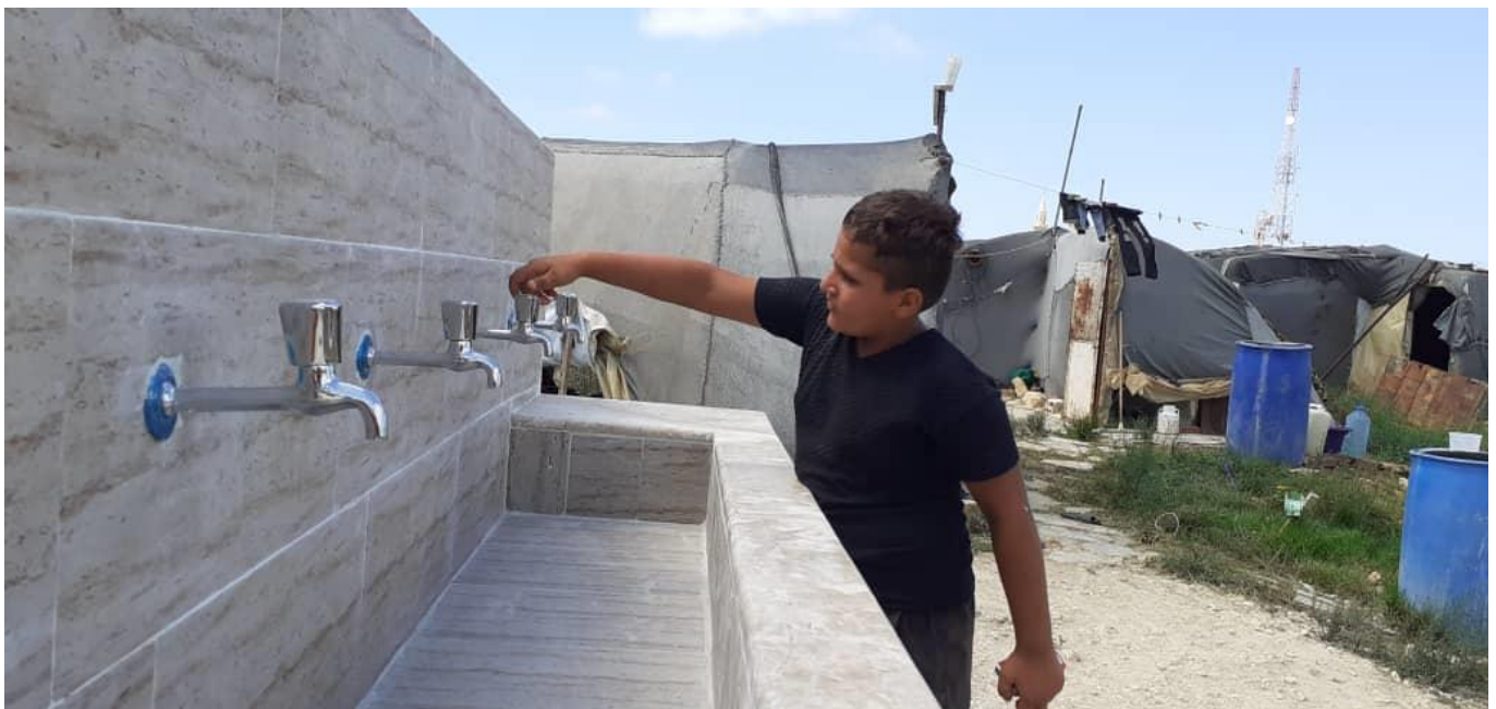
A Syrian IDP boy uses the newly installed communal hand-washing area in Al Hamediyeh Camp in Tartous Governorate, Syria.

By end-2020, the Ministry of Health announced the total number of registered COVID-19 cases had reached 11,344. Of this total, just under half (46.5%) had recovered and 704 had reportedly died. In the northeast of the country authorities reported that the number of cases had reached almost 7,000 by year-end.