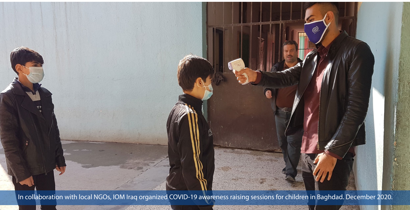
In collaboration with local NGOs, IOM Iraq organized COVID-19 awareness raising sessions for children in Baghdad. December 2020.