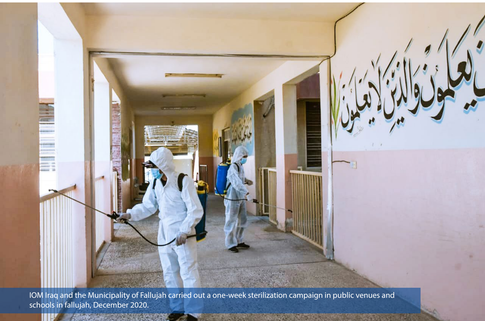
IOM Iraq and the Municipality of Fallujah carried out a one-week sterilization campaign in public venues and schools in fallujah, December 2020.