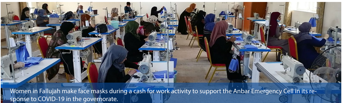
Women in Fallujah make face masks during a cash for work activity to support the Anbar Emergency Cell in its response to COVID-19 in the governorate.

IOM is mainstreaming gender and disability inclusion. This includes encouraging female participation, tracking disability prevalence, and supporting that programming is responsive and inclusive to the needs of females and persons with disabilities. Specifically, in this reporting period, IOM has been shifting CfW activities in order to implement activities more suitable to female participants. These activities are in safe and socially acceptable spaces for women to work at.