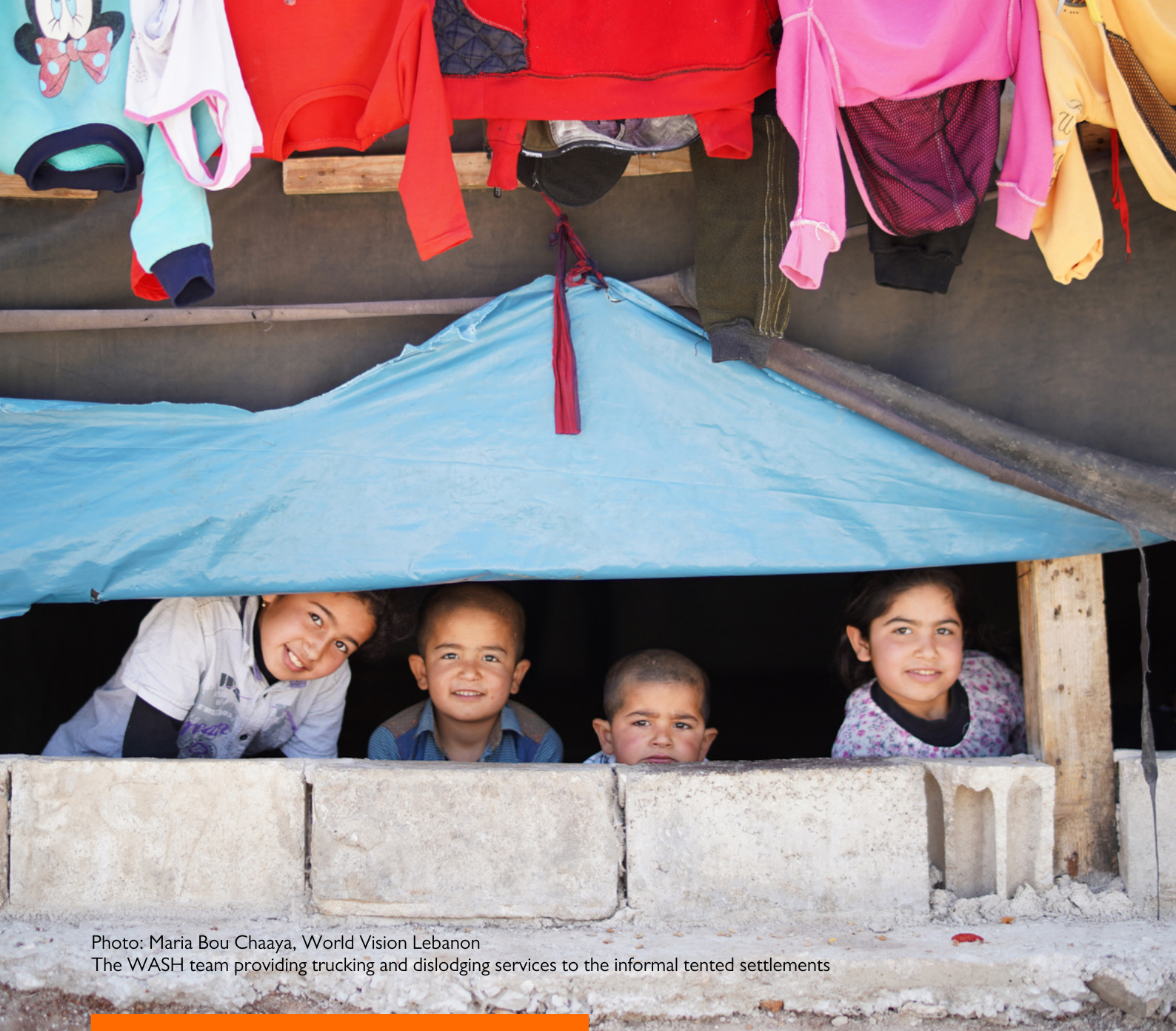
The WASH team providing trucking and dislodging services to the informal tented settlements

World Vision Middle East and Eastern Europe Regional Office