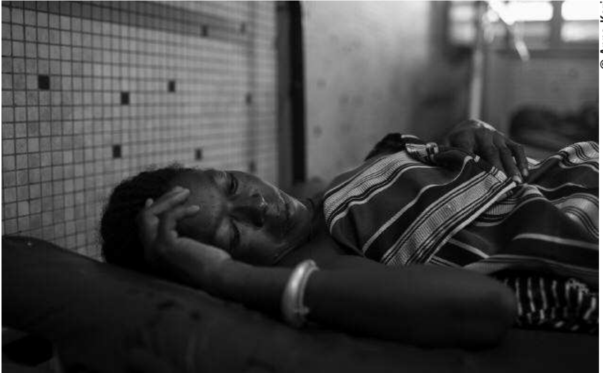
A 45-year-old mother of five in the recovery ward after a caesarean to remove her twins who had died due to complications at seven months. Yalgado Hospital, Ouagadougou, Burkina Faso.

In practice, although modern contraception was introduced in Burkina Faso in the late 1980s, its use remains very limited, especially in rural areas. The inadequacy of sexual and reproductive health services in Burkina Faso was noted by the CEDAW Committee in 2005, when it called on the government “to improve the availability of sexual and reproductive health services, including family planning... [and to] enhance availability of contraceptive services.” 88