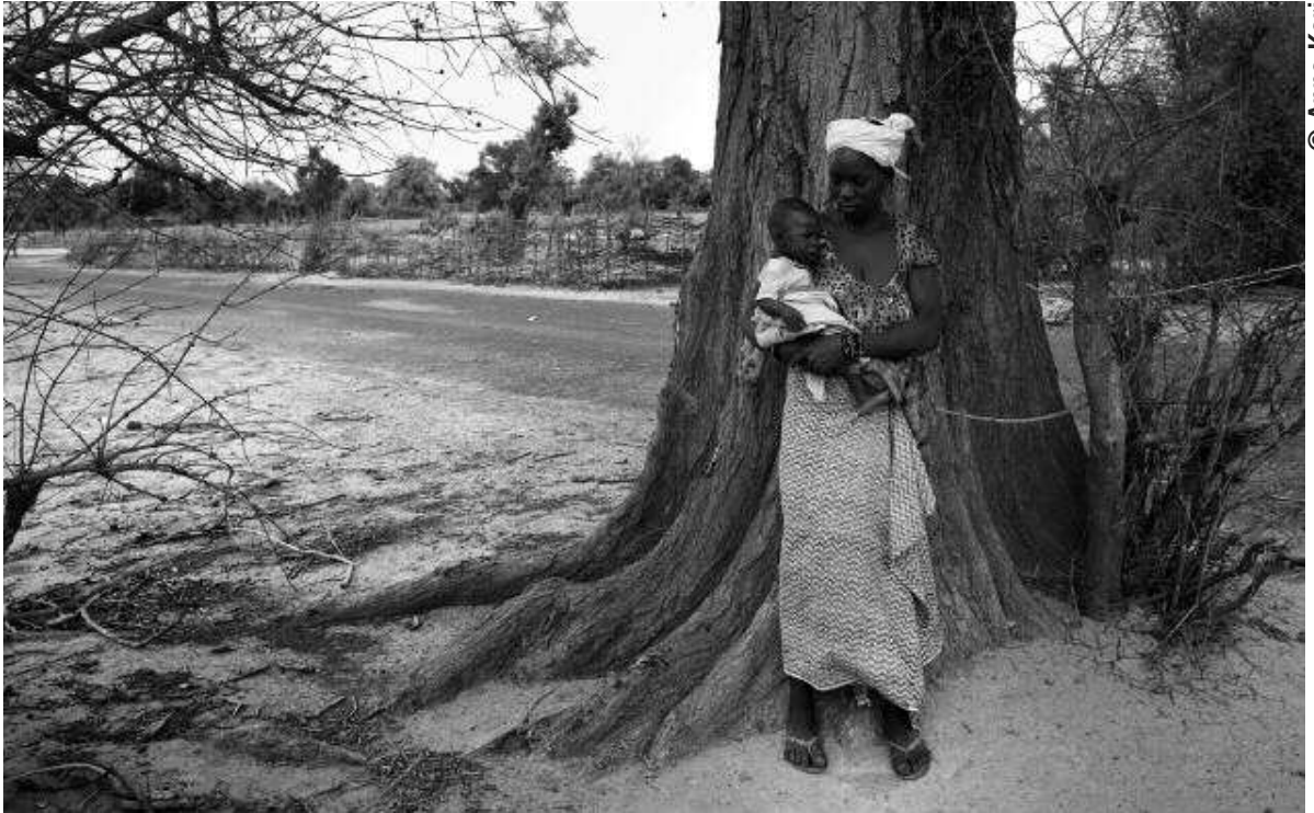
A woman and her seven-month-old son, pictured by the tree where she gave birth. Women in rural areas often cannot reach a health facility in time.

facility. There is no ambulance system to help transport women to a CSPA, even in an emergency. The ambulance system, where it exists, only operates between the CSPA and other health facilities.