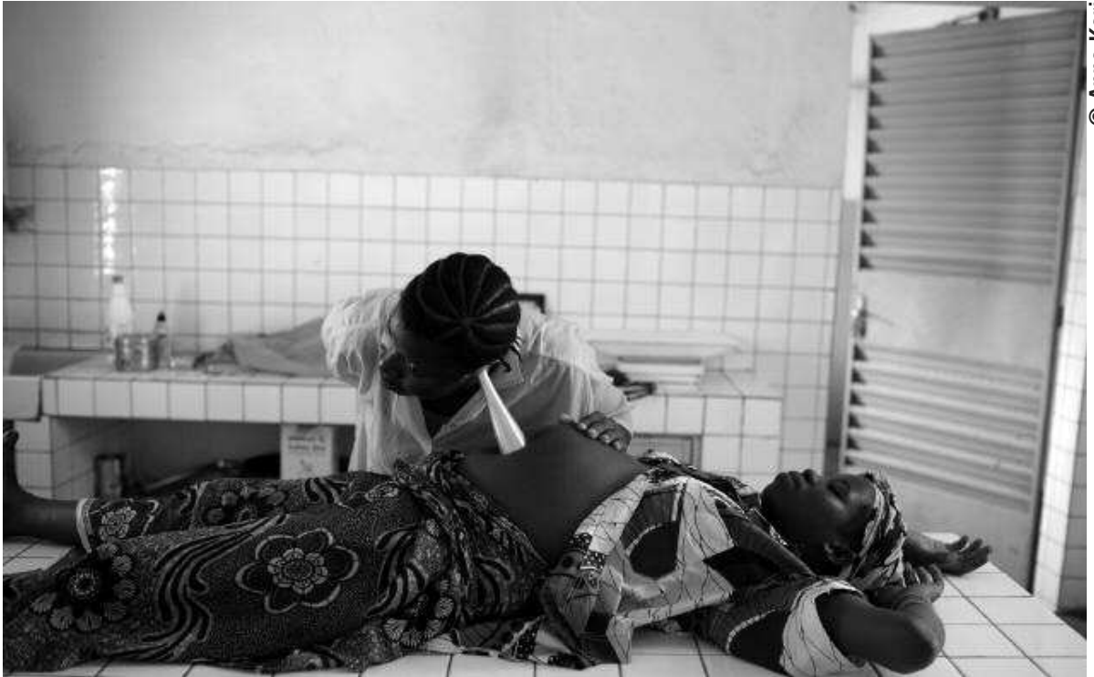
A midwife checks a 17-year-old girl who is in the first stages of labour. This is her first child. Lankoué, Burkina Faso.