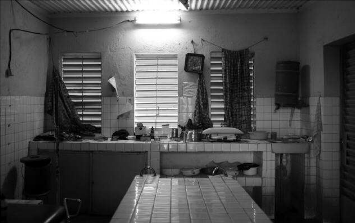
The delivery room at Kiembara health centre, Burkina Faso. More than a third of all births still take place without medical assistance.

is the first reference level for pregnant women with complications. In 2008, there were 1,352 CSPS and 42 district hospitals. 53