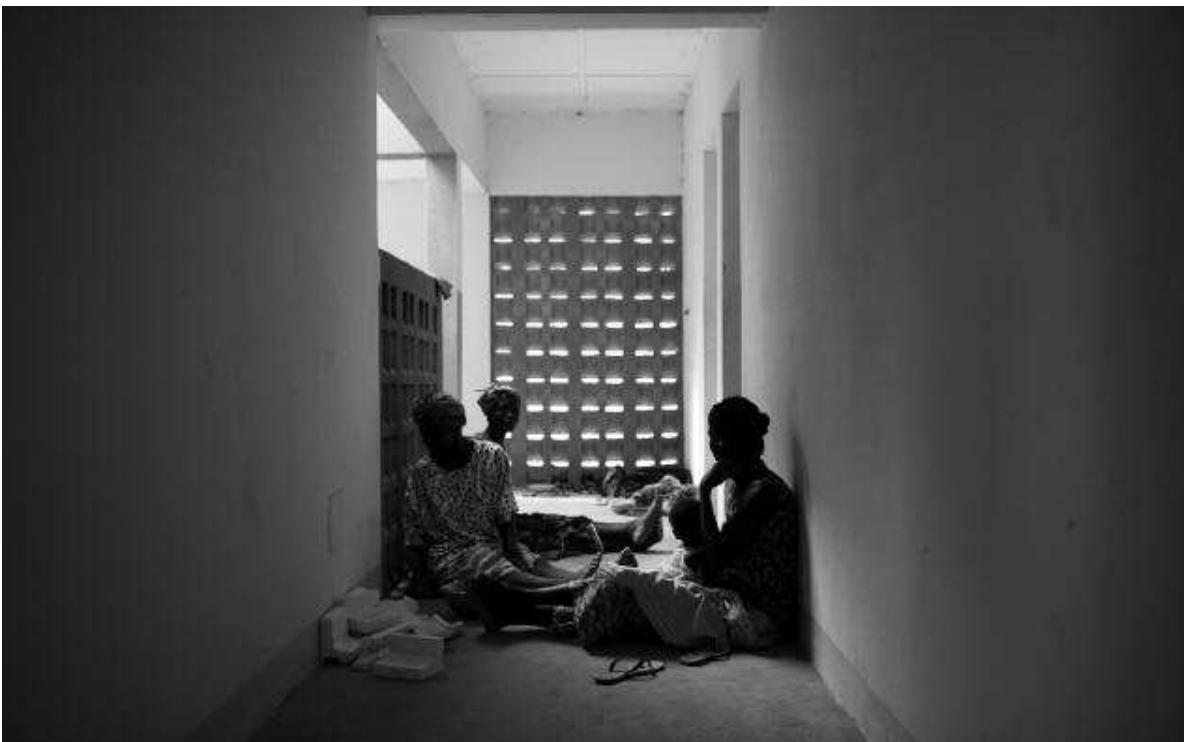
The aunts of a young woman in labour wait patiently outside the delivery room at a new community health centre (CSPS) in Gorgare, Burkina Faso.