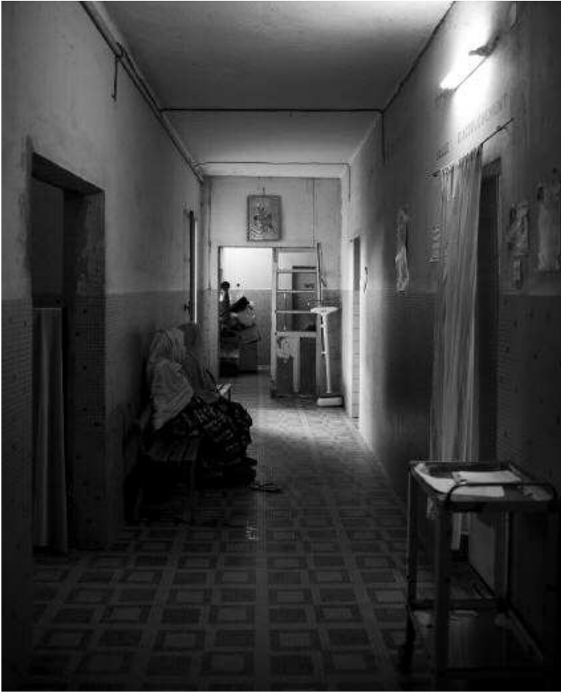
Maternity ward, Ouahigouya regional hospital, Burkina Faso.