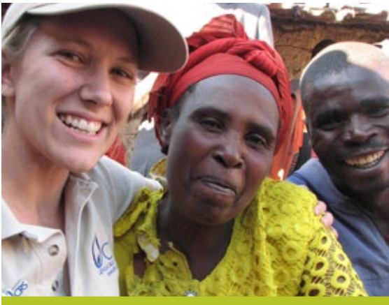
CRS is helping farmers in the Democratic Republic of Congo grow strong, healthy crops so they can earn a living and feed their families.

Solidarity is one of the seven principles of Catholic social teaching (United States Conference of Catholic Bishops) and means that all people are part of one human family. We call God “Our Father,” acknowledging that we are all brothers and sisters before him. As one human family, we are deeply connected to people around the world—wherever they may be. And because we are one, we are affected by the joy and suffering of all. “If one member of Christ’s body suffers, all suffer. If one member is honored, all rejoice.” (1 Corinthians 12:12–26) Living in solidarity means we take action to make sure that every member of our human family is living in conditions that honor human dignity. “We are all really responsible for all.” (St. John Paul II, Sollicitudo Rei Socialis , no. 38)