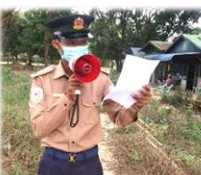
Preparing for disasters