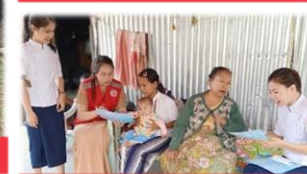
Inviting women to lead