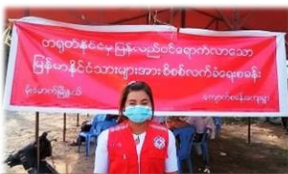
Welcoming returning migrants

Looking back and moving forward: Myanmar Red Cross volunteers making a difference on the ground click the captions to meet our volunteers