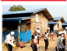
Helping IDPs open up