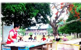
Raising funds to provide food