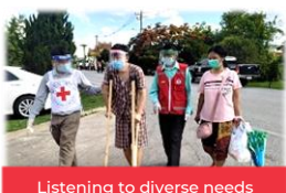
Listening to diverse needs