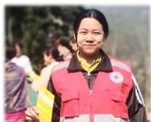
Using ethnic languages