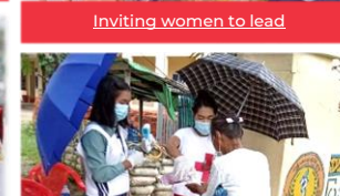
Leaving no one behind