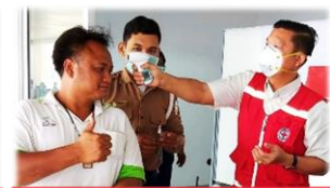
Being a life-saving gatekeeper