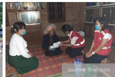
Southern Shan state

3,209+ activities in 80+ townships addressing psychosocial needs of COVID-19 affected population in quarantine facilities and communities.