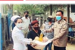
Addressing basic needs