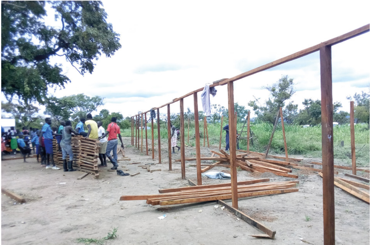
The Diocese of Liwolo lead the construction of a temporary learning space in Korijo, 2019.

when the organisations from another faith either did not meet the eligibility requirements or did not want to apply for reasons that were unclear. Likewise, many local organisations that had adapted to conform to the norms and parameters of the international humanitarian system (and therefore met eligibility requirements) identified themselves as secular actors. It is notable that local actors identified themselves as secular in many cases. This is due in part to the national structure as the country is a secular state and Muslims, as religious minorities, may not be comfortable in identifying as Islamic LFAs. On the other hand, as stated in Section 2, there is also the influence of the secularised humanitarian system, in which local actors are disinclined to identify as faith-based if that could be a barrier to participation because of negative perceptions of LFAs.