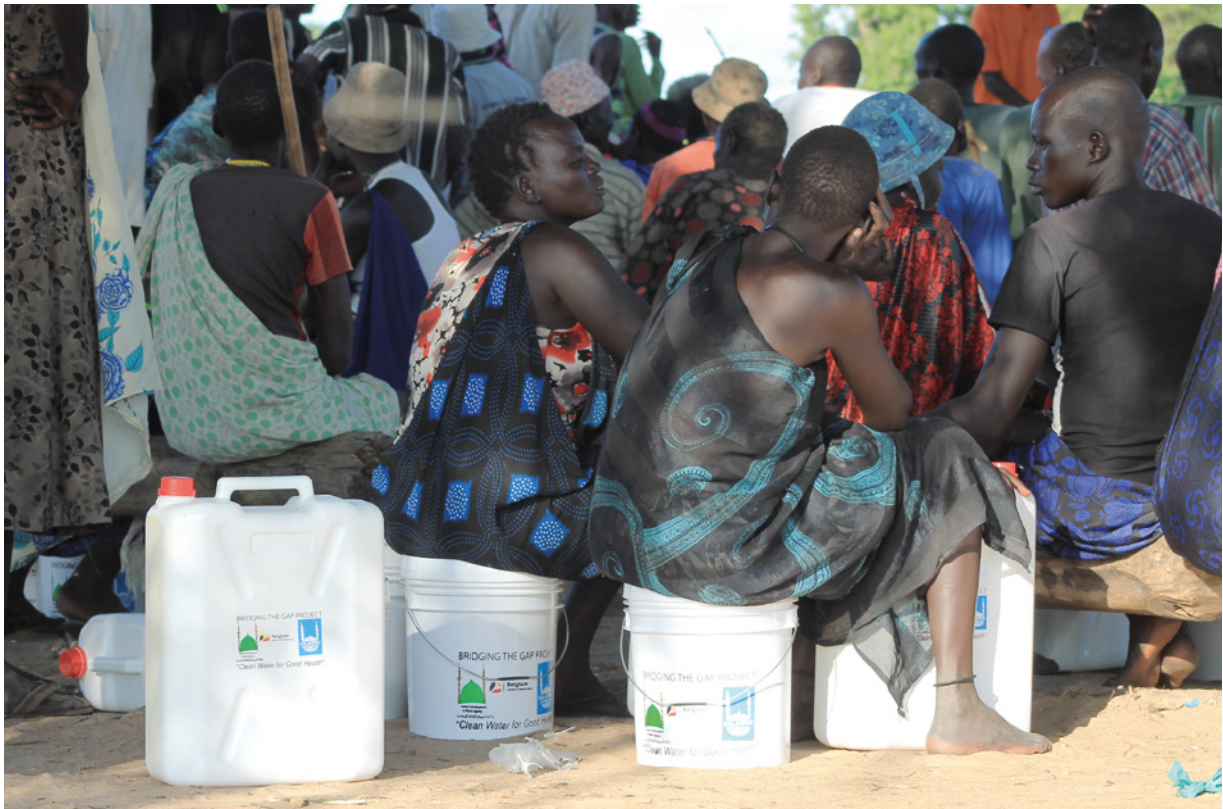
Local community members at a humanitarian relief distribution held by IDRA in Terekeka, 2019.

International humanitarian responders often step in when local and national capacities are overwhelmed. However, critics of the international humanitarian system note that it fails to strengthen the capacity of local and national actors or sufficiently to engage and recognise the existing capacities of local actors (Barbelet 2019).