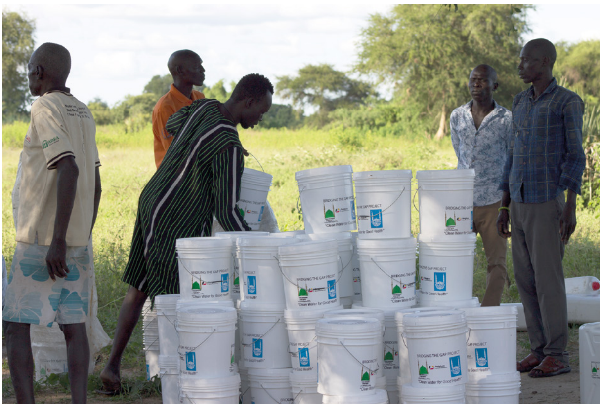
Local faith actors from Islamic Development Relief Agency (IDRA) distribute relief assistance in Terekeka, 2019.

Section 2 provides a background to localisation and LFAs, as well as giving an outline of the context of South Sudan. Section 3 outlines the main elements of the Bridge Builder Model, before Section 4 sets out the research methodology. The key findings from the research are presented in Section 5, followed by conclusions and recommendations.