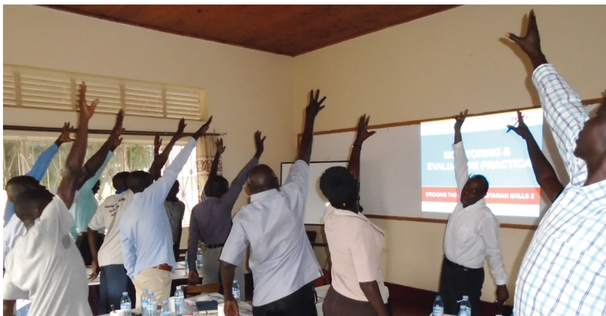
Local faith actors take a break at a humanitarian capacity-strengthening workshop in Juba, 2019.