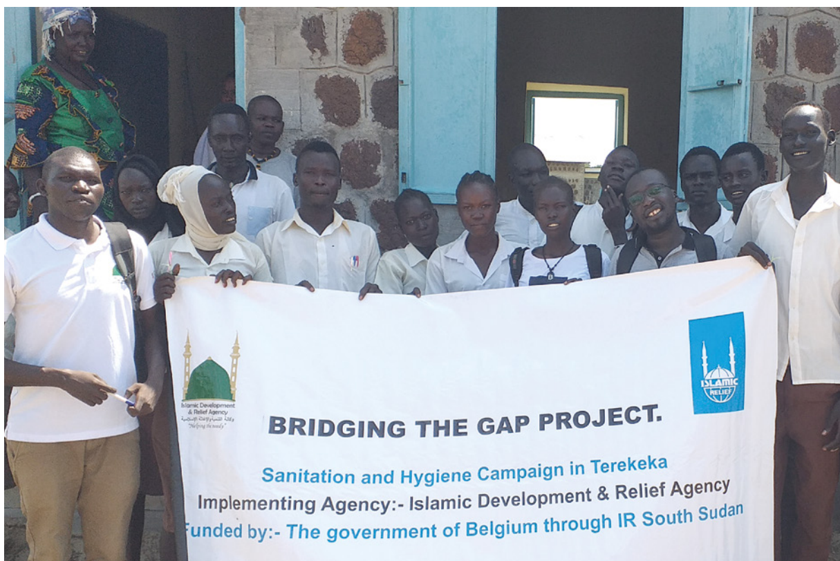
IDRA members carry out a sanitation and hygiene campaign at a primary school, Terekeka, 2019.

Before the training, most participants were not familiar with the Core Humanitarian Standards (CHS), the international humanitarian cluster system,