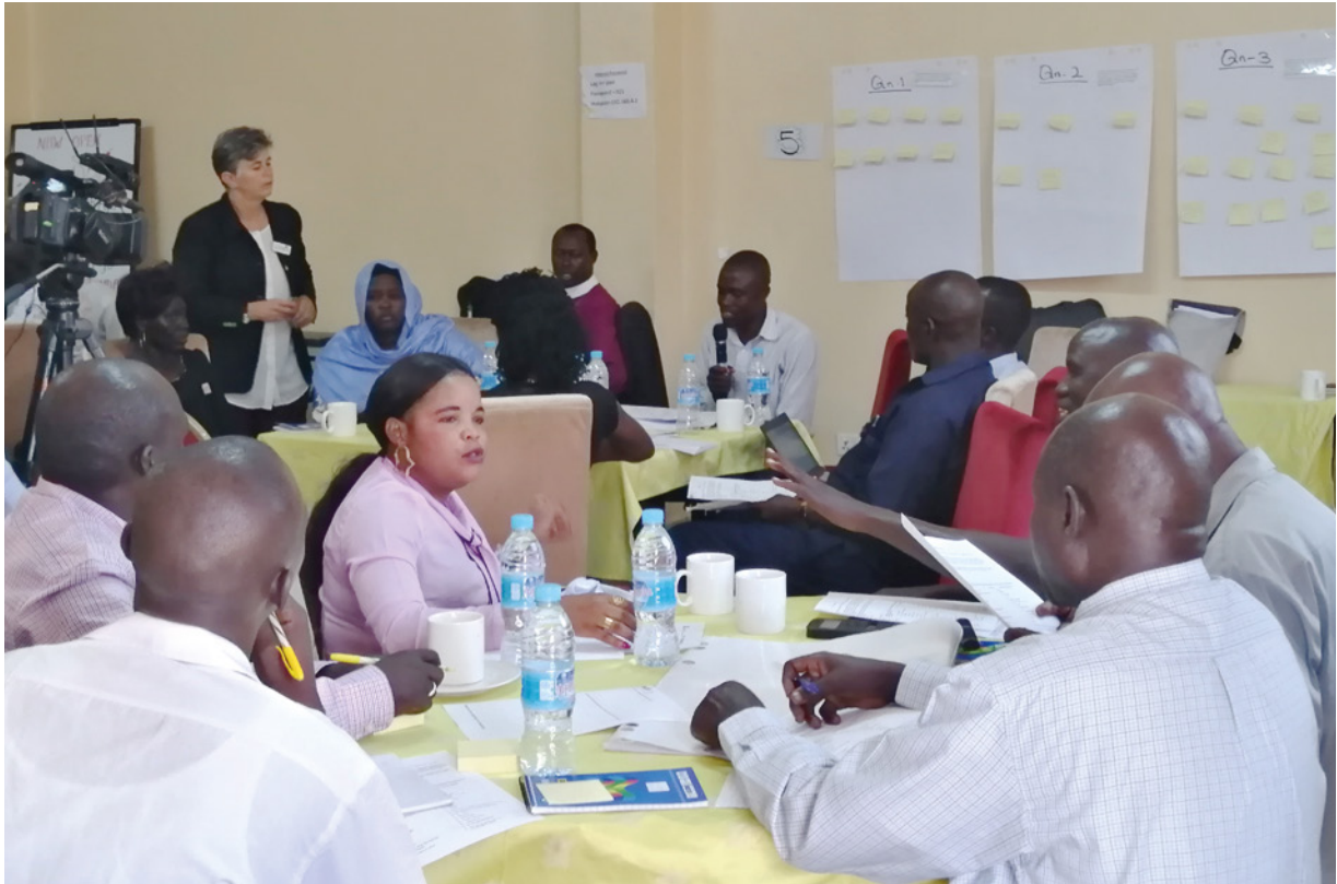
Participants at a workshop on linkages between local faith actors and humanitarian actors, 2019.

Management, formed in 2011. All NGOs, both national and international, must register with the RRC, and are bound by the 2016 NGO Act and the 2016 RRC Act (National Legislative Assembly Juba 2016). LFAs carrying out humanitarian work also have to register with the RRC; many are also registered with the Bureau of Religious Affairs.