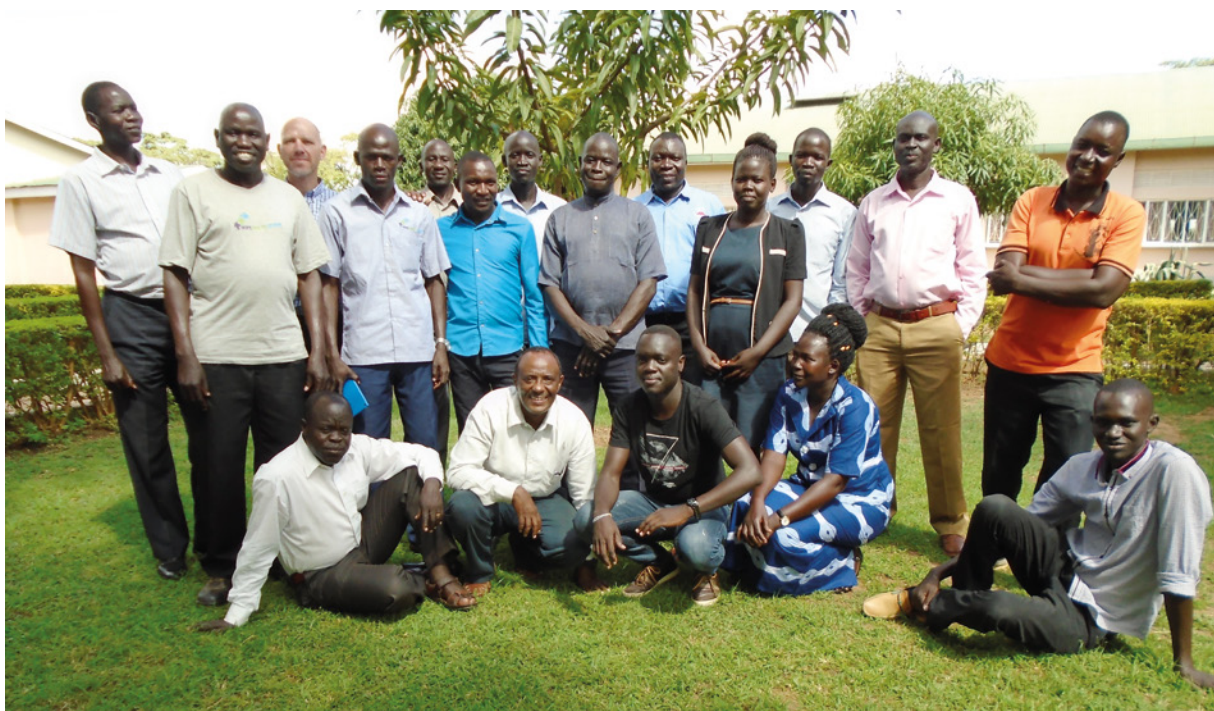
Participants from the Diocese of Liwolo and the Baptist Convention of South Sudan / Hope Help Action (BCoSS/HHA) at a humanitarian skills workshop held in Moyo, Uganda.