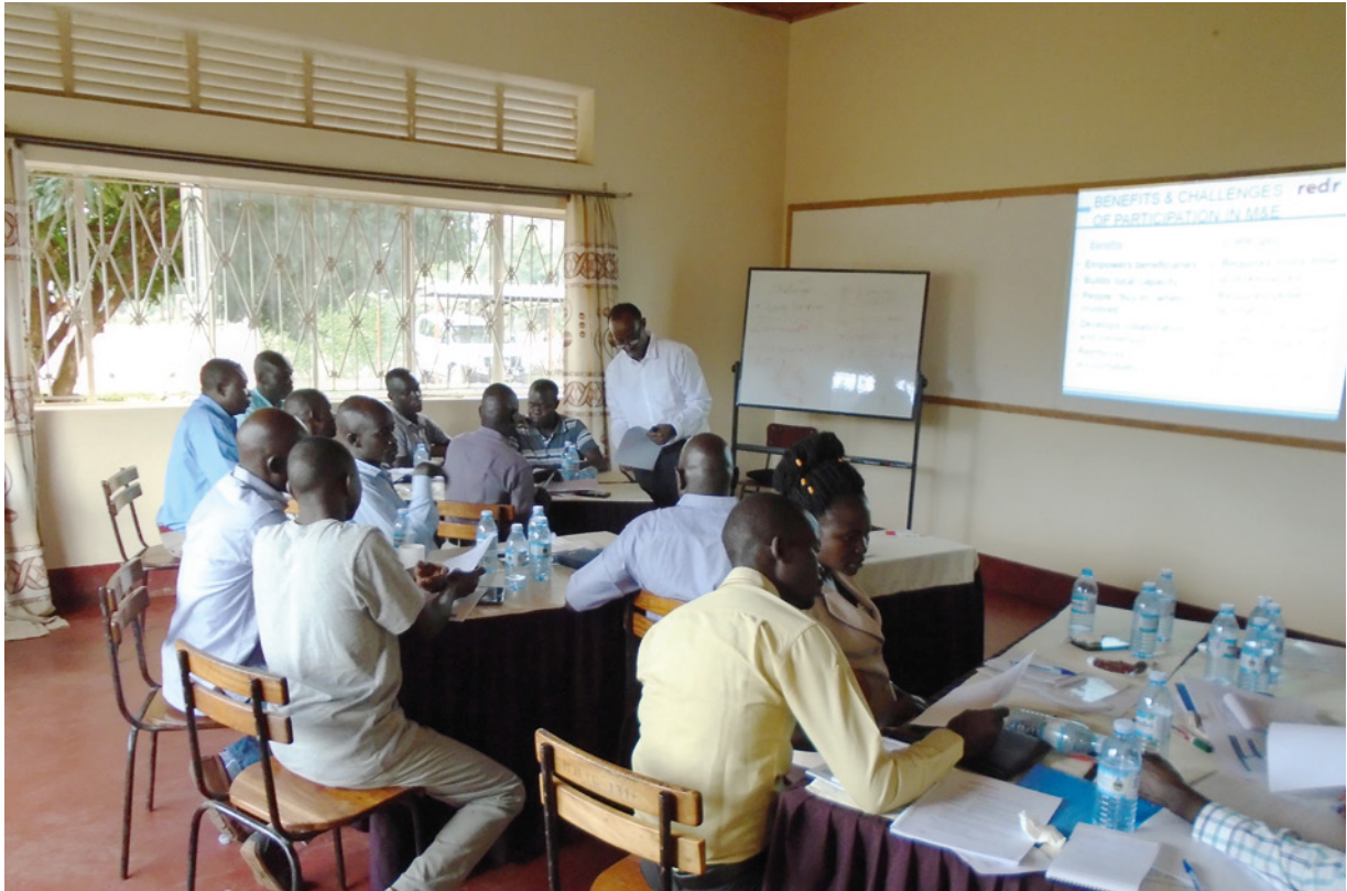
Local faith actors at a humanitarian capacity-strengthening workshop in Juba, 2019.

remains unbalanced, according to this interviewee. Instead, the Bridge Builder Model asserted the value of local actors' involvement at each stage and sought to find ways to bring LFAs to the table.