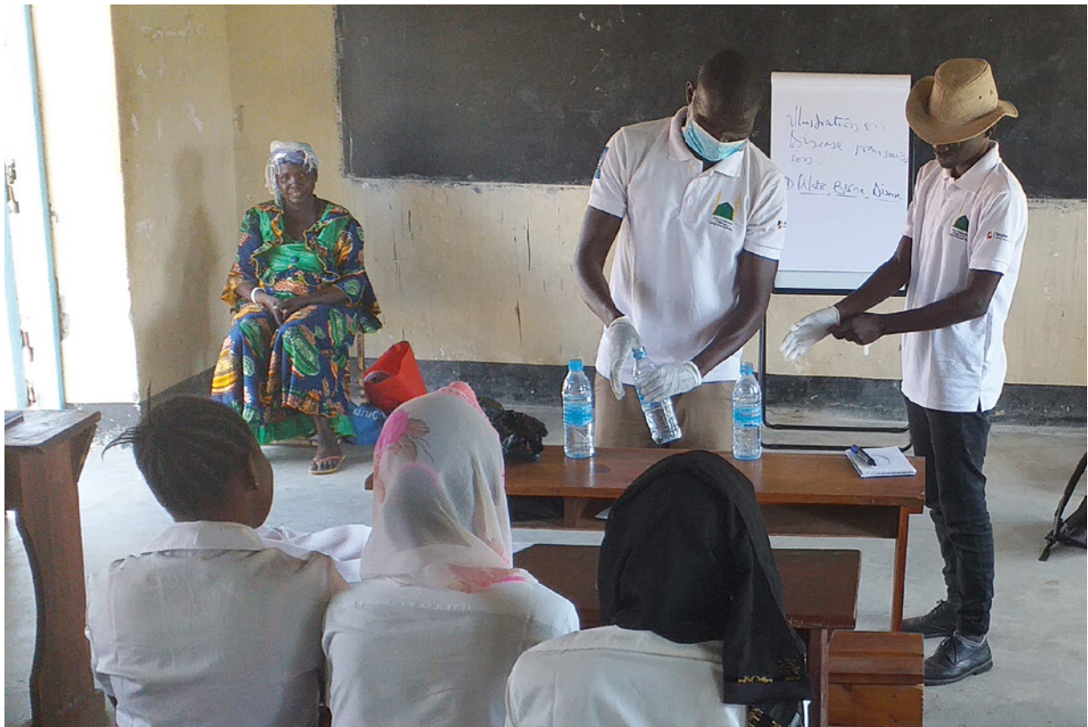
IDRA members share hygiene information in a school in Terekeka, 2019.

In implementing the pilot, an initial challenge was selecting and assessing LFAs as several of those interested in taking part did not meet the eligibility requirements, underlining the need to strengthen LFAs'