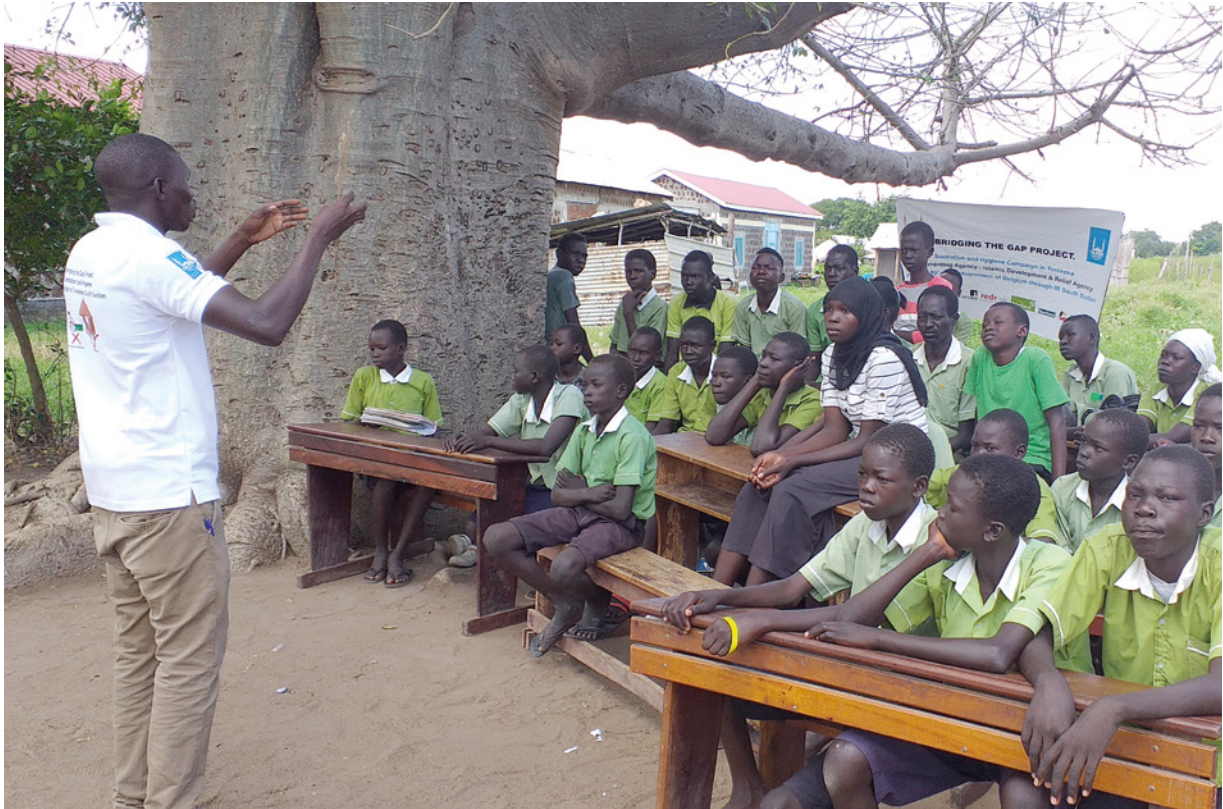
IDRA members carry out a sanitation and hygiene campaign at a primary school in Terekeka, 2019.