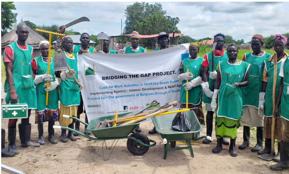
'Cash-for-work' humanitarian assistance carried out by Islamic Development Relief Agency (IDRA) in Terekeka, South Sudan, 2019.

For humanitarian management, the South Sudan Relief and Rehabilitation Commission (RRC) is an agency of the Government of South Sudan, the operational arm of the Ministry of Humanitarian Affairs and Disaster