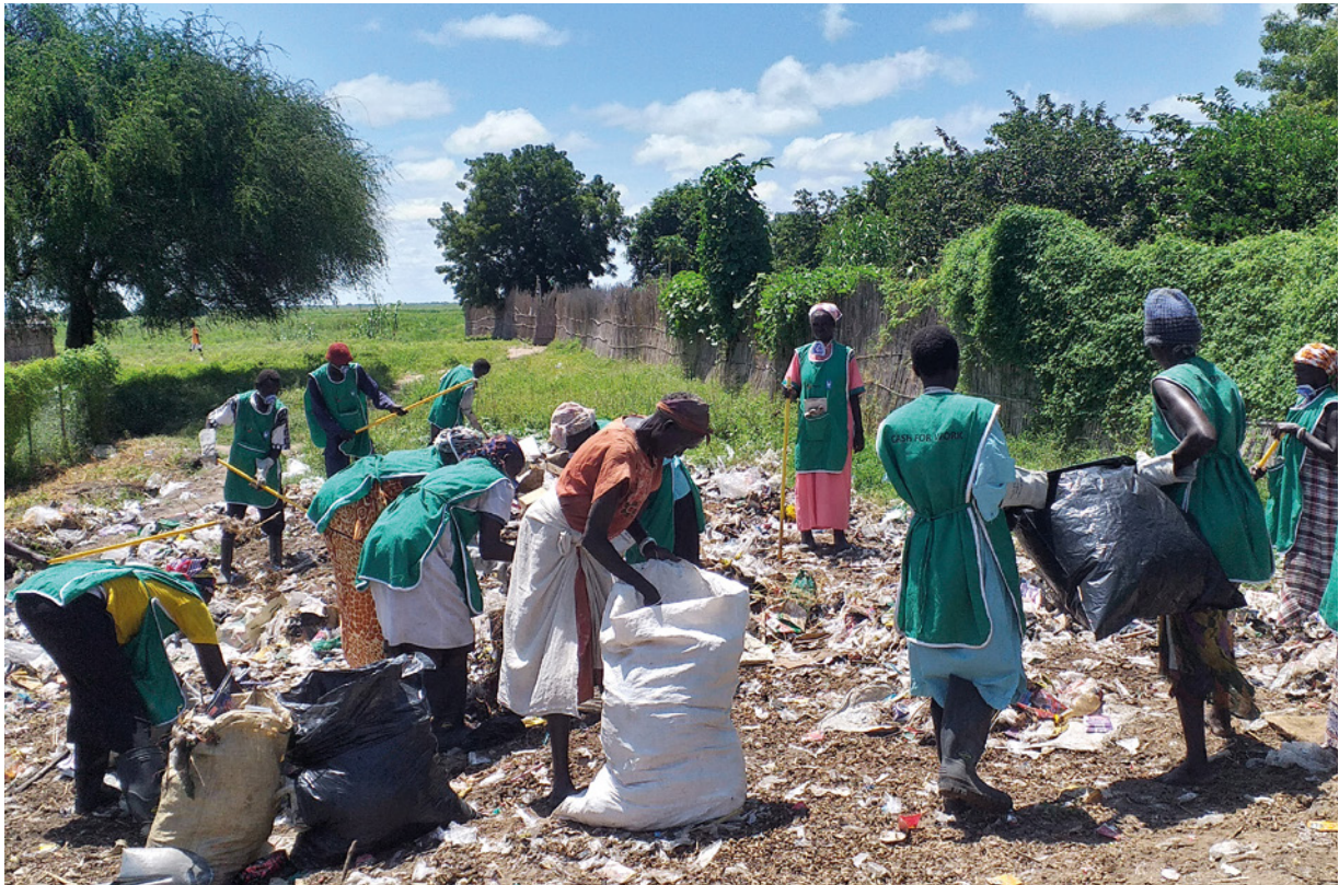
IDRA members organise a 'cash-for-work' humanitarian assistance programme in Terekeka, 2019.

When setting up the initiative, the consortium intended to involve staff working for secular international humanitarian organisations as these were most likely to be sceptical of the role of LFAs in humanitarian response. It became clear that the training was also relevant for international FBOs. Many staff working for FBOs do have a faith tradition themselves and the organisations are more likely to be sympathetic to thinking about faith and humanitarianism. Yet, it should not be assumed that international FBO staff have the same theological understanding or that they have any training in and experience of the analysis of religions in society, the central component of religious literacy training. FBOs as well as secular NGOs and agencies may experience similar challenges