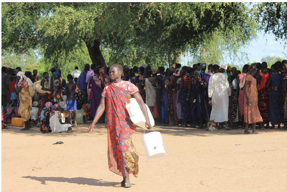
A community member from Lokweni village attends a humanitarian relief distribution by Islamic Development Relief Agency (IDRA), 2019.

The Bridging the Gap Consortium decided to implement the Bridge Builder Model in South Sudan to address the barriers and seize opportunities for increased partnership between LFAs and the international humanitarian system. The consortium chose South Sudan for this initiative as it is a country with stark humanitarian needs and a large number of international humanitarian actors present. It is also a country where crisis-affected communities align themselves with faith groups and, most importantly, where local faith actors are already responding to many of the humanitarian needs in the country.