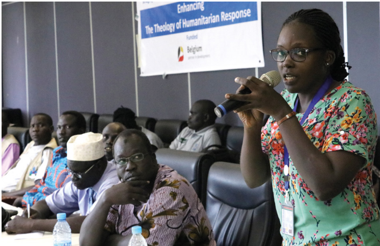
Participants at a theological workshop on the role of local faith leaders and humanitarian actors in humanitarian response, 2019.