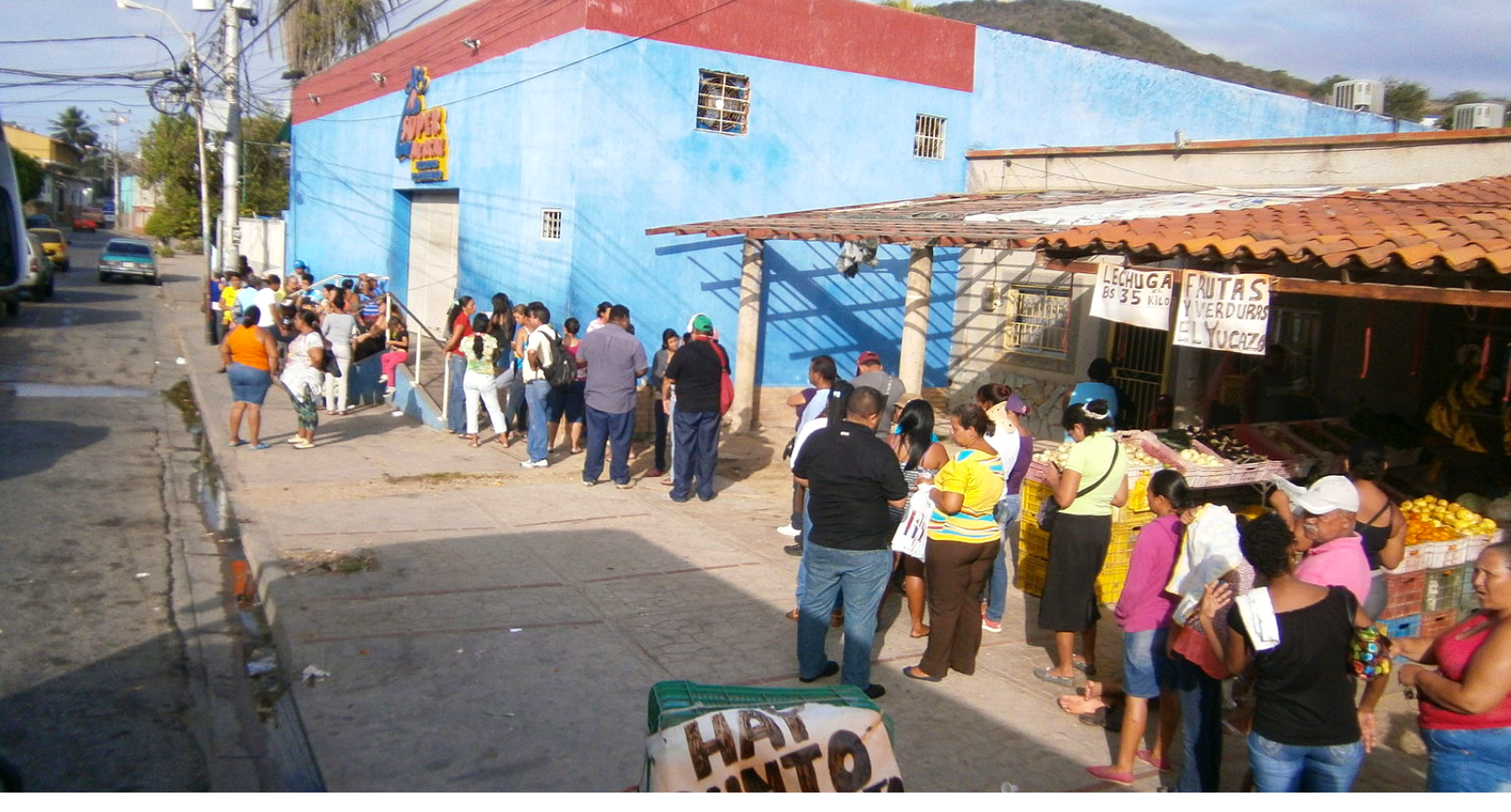
Photo credits: People lining up to get food in a supermarket in Caracas, Venezuela: Wikimedia Commons, March 25, 2014

production and food imports, Venezuelans in 2019 only had access to 42 percent of the calories and 35 percent of the proteins that were available to them when Maduro came to power in 2013. The situation is likely to worsen in the coming months, because severe fuel shortages <u>have hindered</u> food production and delivery in the midst of the national quarantine.