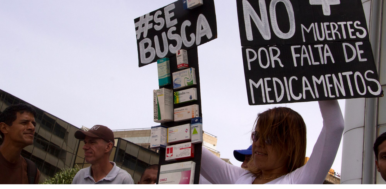
Photo credits: Citizens protest over the country's health crisis and medicine shortages in Caracas, Venezuela: Shutterstock, Edgloris Marys, April 25, 2017

did one in every five children under sixth months of age. The situation was even worse among newborns, almost one third of whom were malnourished.<sup>1</sup>