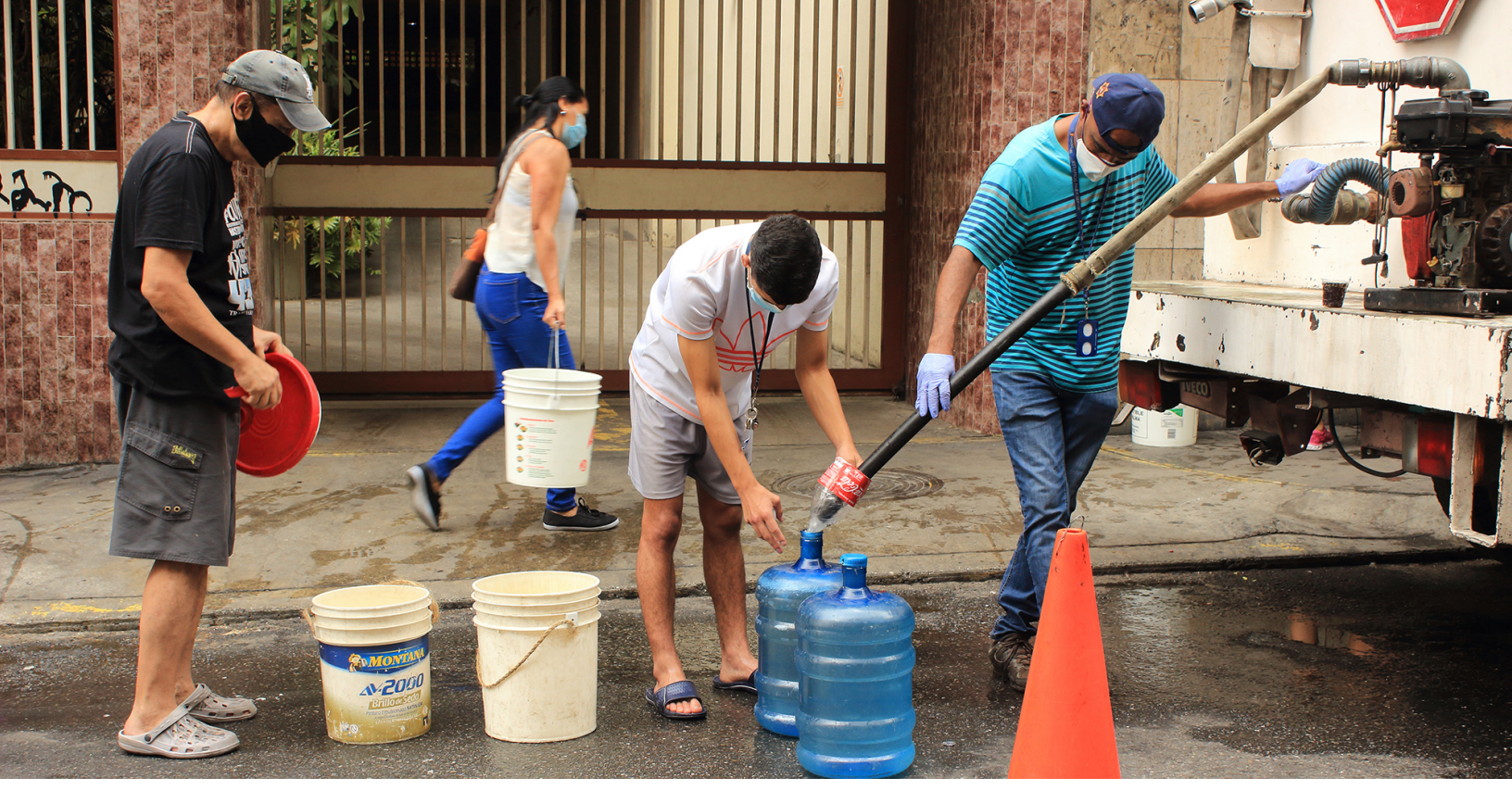
Photo credits: People fill containers with water from a water tank during quarantine because of the gradual collapse of the water system in Caracas, Venezuela: Shutterstock, Edgloris Marys, April 4, 2020