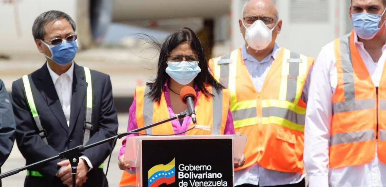
Photo credits: Venezuelan authorities hold a press conference following the donation of 300,000 medical tests from China: Nicolás Maduro Facebook, March 19, 2020

<u>been in contact</u> to discuss oil production and bilateral cooperation. Meanwhile, Cuba has reportedly sent <u>hundreds</u> of doctors to Venezuela.