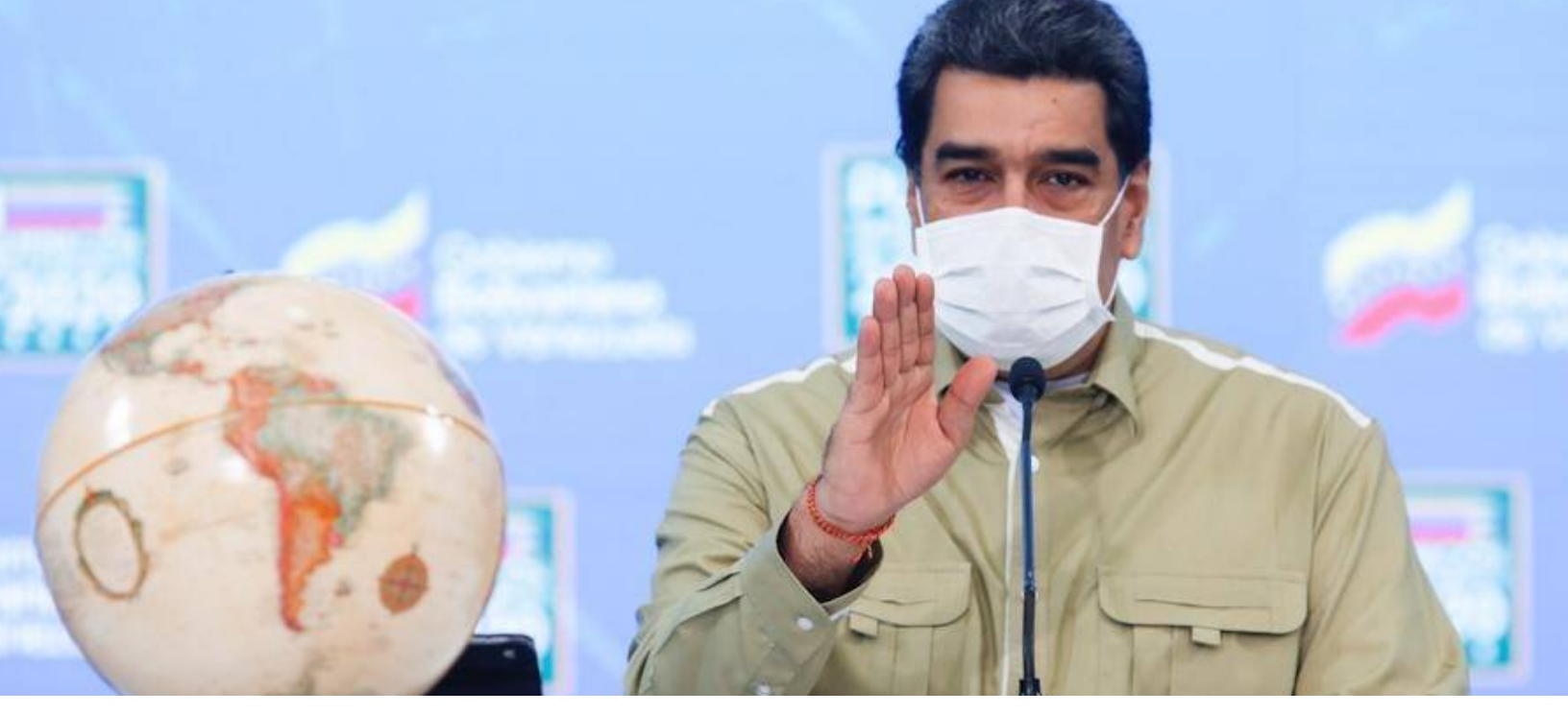
Photo credits: Nicolás Maduro during a press conference in Caracas: Nicolás Maduro Facebook- April 24, 2020