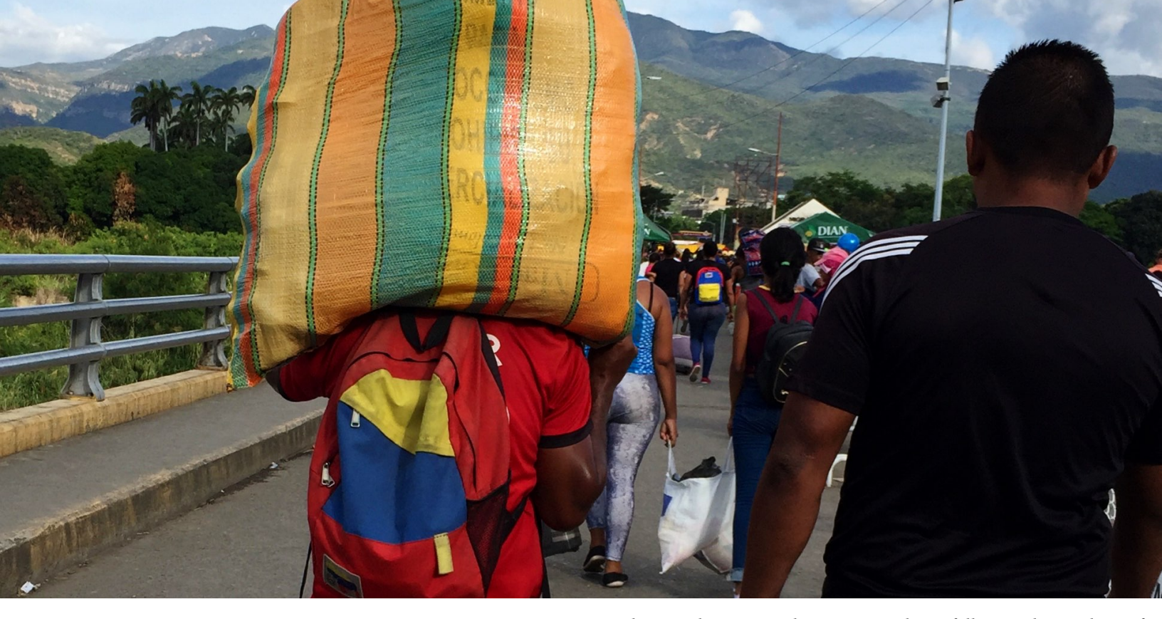
Photo credits: Venezuelans returning home following the purchase of needed provisions in Colombia. Simón Bolívar International Bridge, Villa del Rosario, Colombia: Cindy Arnson, November 2, 2019