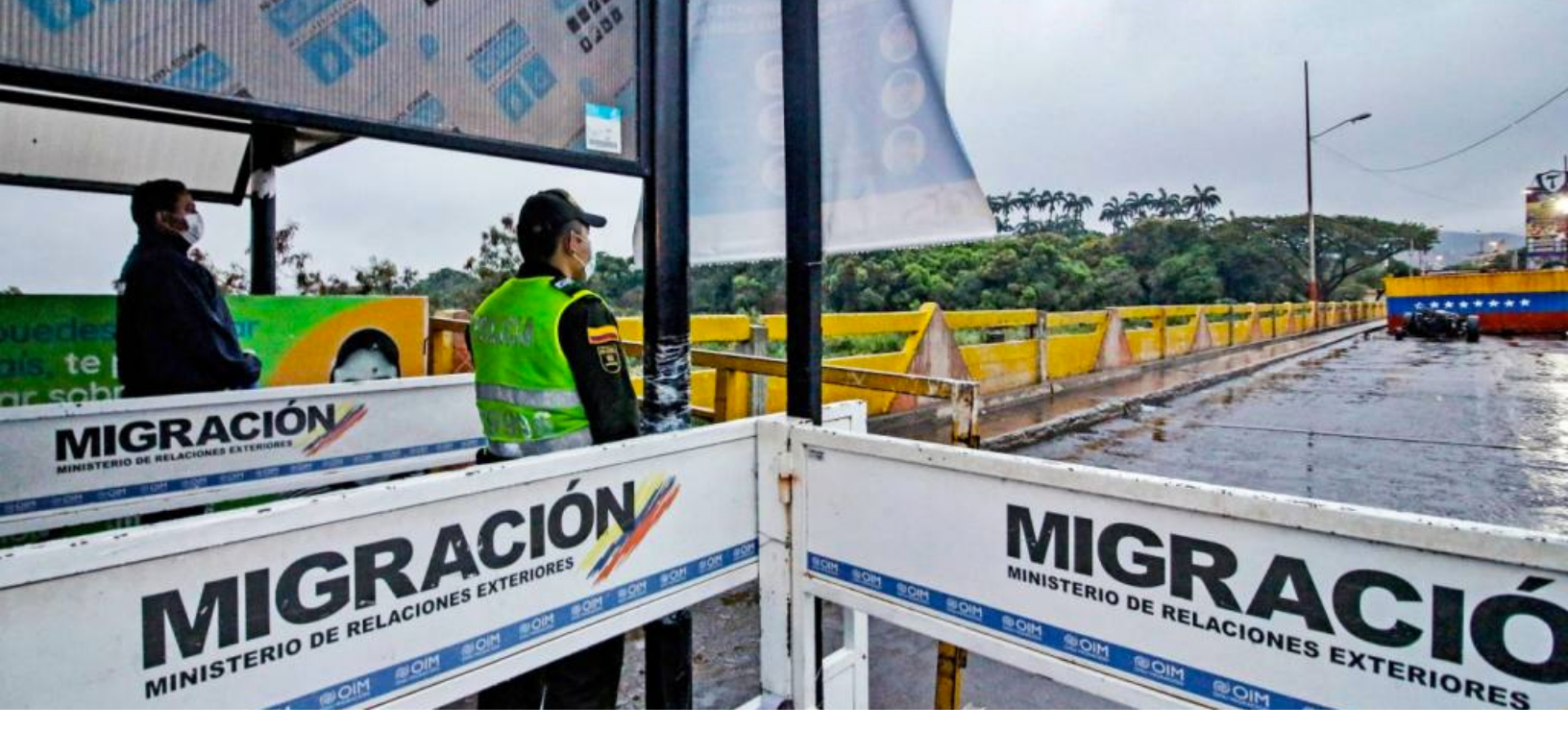
Photo credits: Colombian officials at the closed border with Venezuela, Villa del Rosario, Colombia: Wikimedia Commons, March 14, 2020)

According to the mayor of Cúcuta, <u>300 to 500</u> people arrive in the city every day hoping to go back to Venezuela. The Colombian migration agency calculates that <u>52,000</u> had crossed the border back into Venezuela as of May 12, but the number is likely to be even higher given that many use informal paths. Colombian authorities are also seeing a growing number of Venezuelans coming from the southern border with Ecuador, who have to cross through Colombia on their way home. Venezuelan migrants are also trying to leave Brazil, albeit in much smaller numbers. According to Brazilian Federal Police officers stationed along the border, somewhere between <u>10 and 20</u> Venezuelans go back to the country every day, more than 600 as of April 12.