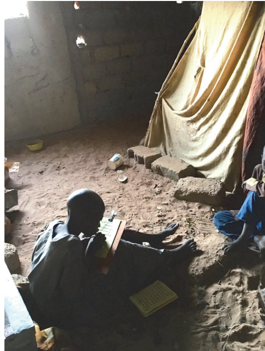
A talibé child studies the Quran in a daara in Touba, while another child looks on. Behind them is a makeshift tent where some of the children slept on night, on the sandy ground. January 8, 2019.

One public prosecutor – known for his willingness to initiate investigations and prosecutions of abusive Quranic teachers – suggested using creative strategies to open forced begging cases: “It would be very complicated to just grab any talibé on the street and prosecute the teacher for trafficking, so I look for other opportunities – even traffic accidents, if the child was in the street because he was forced to beg,” he said. As another example, he said, a talibé in conflict with the law for stealing opens a window to investigate whether the child was attempting to meet a forced begging quota. 158