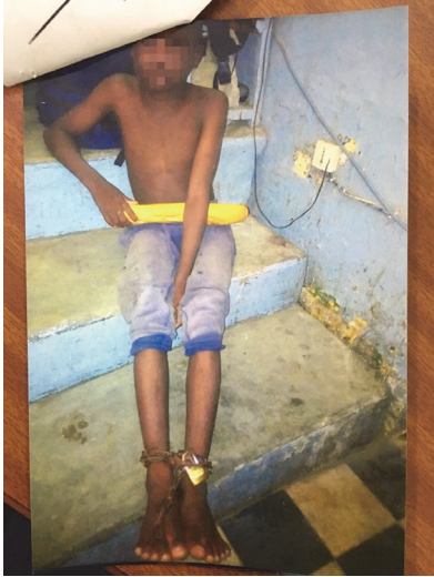
This 8-year-old talibé child ran away from his daara in Saint-Louis with chains still attached to his feet in August 2017. Original photo taken August 2017.

investigations, despite the fact that – with thousands of talibés begging in the streets – “it’s exploitation in plain sight.” 116