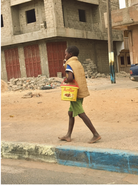
A talibé child in Dakar, Senegal, June 21, 2018.

Beyond the retrait program in Dakar, Senegalese police in multiple regions of Senegal often failed to initiate or pursue investigations into cases of forced begging or abuse against talibé children in 2017-2019. This dynamic and its detrimental effect on talibé children's access to justice is explored further in Section V of this report.