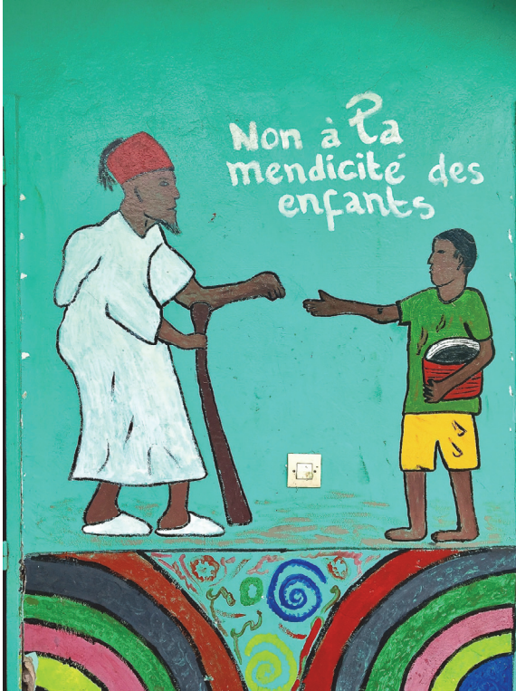
A painting on the wall of a children’s day center run by the NGO Enda Jeunesse Action in Dakar, June 21, 2018. The text reads, in French, “No to child begging.”

This report examines Senegal’s policy, programmatic and judicial efforts from 2017 to 2019 to protect talibé children from abuse, neglect and trafficking, bring those responsible to justice, and improve conditions in daaras . It makes recommendations on steps the new government should take to better protect talibé children and bring about lasting change.