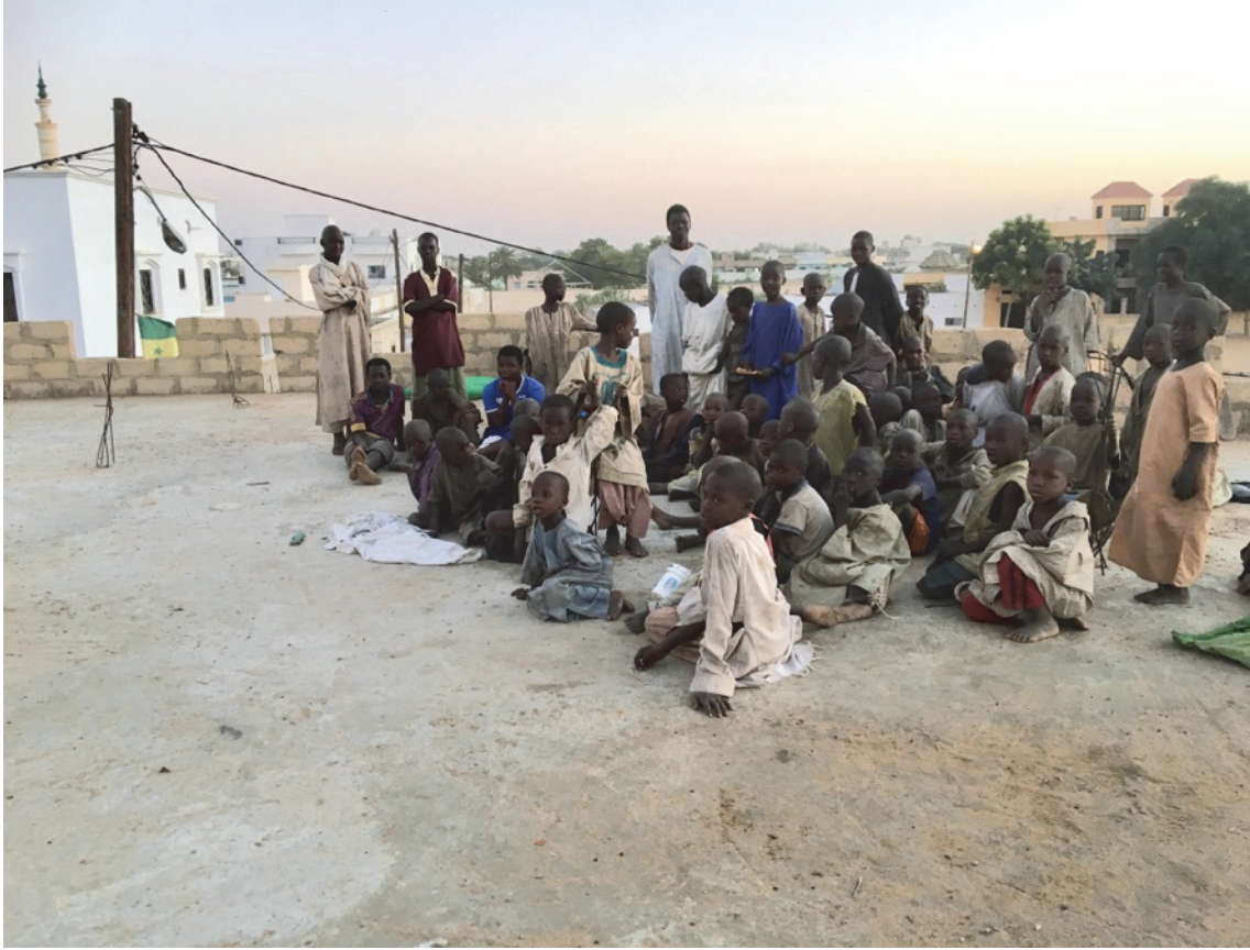
A group of talibé children on the rooftop terrace of a daara in Touba that housed over 100 talibés in a large, unfinished building with no paved floors. At night, the children either slept inside on sheets on the sand, or on the terrace, exposed to malaria-carrying mosquitos. January 8, 2019.

In Saint-Louis, where Human Rights Watch has visited dozens of squalid daaras since 2009, “there is a proliferation of daaras ,” according to a staff member at a local children’s center. “They come, they rent a house, and they install the children in conditions of extreme hardship. There is no effective system in place to eradicate this phenomenon,” he said. 53