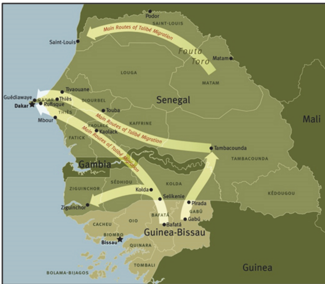
Key migration routes of talibé children in Senegal. Many talibés travel to Senegal from neighboring countries, including Guinea-Bissau and Gambia.

Human Rights Watch research suggests that hundreds of talibé children in 2017 and 2018 were victims of human trafficking, which under Senegalese law includes the act of harboring of children in a daara and exploiting them for money through forced begging, as well as the recruitment or transport of children for this purpose. 104 A June 2019 Human Rights Watch report also documented how some parents perpetuate such practices by repeatedly returning runaway children to abusive or exploitative daaras . 105