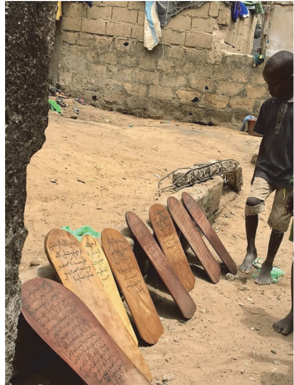
A talibé child looks at the tablets where the boys practice writing Quranic verses at a daara in Dakar, June 23, 2018. The children begged daily for money and all their meals.

The Interior Ministry should capitalize on this momentum and ensure that police officers in all regions receive adequate training in child protection. It should also fulfill its pledge to install special offices or units dedicated to juvenile affairs in all central police stations.