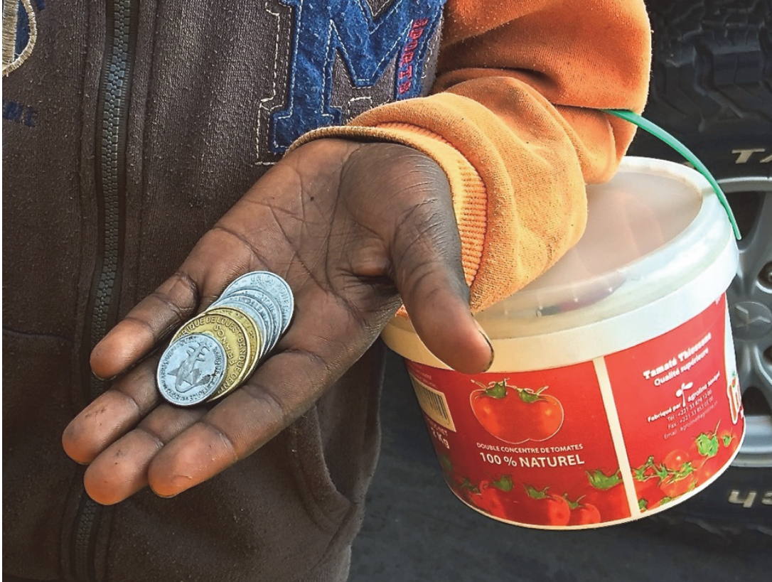
A talibé child begging at car windows in Dakar, June 19, 2018. Multiple talibés told Human Rights Watch that their Quranic teacher required them to return with a specific quota of money each day.