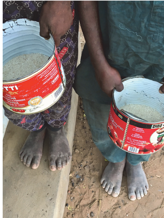
Two talibé children in Louga hold their begging bowls, which contain rice. The children said they begged daily for food and money. January 11, 2019.

Strong domestic laws in Senegal ban child abuse and willful neglect, sexual abuse of children, wrongful imprisonment or sequestration, endangerment, and human trafficking