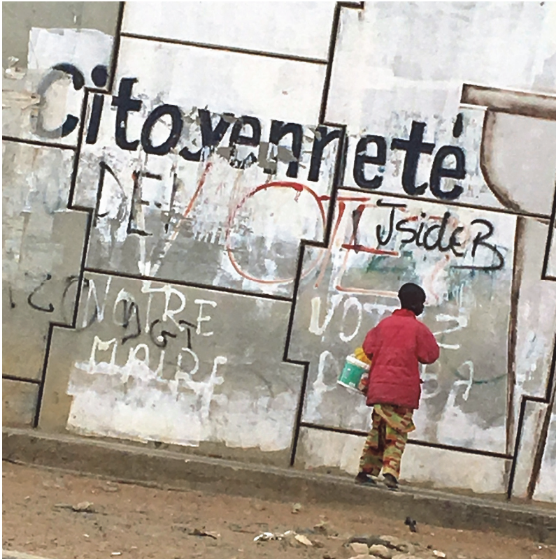
A talibé child near a major street intersection in Dakar, Senegal, June 19, 2018.

Finally, the international community should denounce ongoing abuses against talibé children; express support for an approach that equally prioritizes deterrence, social assistance, and public communication; and accompany the Senegalese government by providing financial, material or technical support to the priority areas identified in this report.