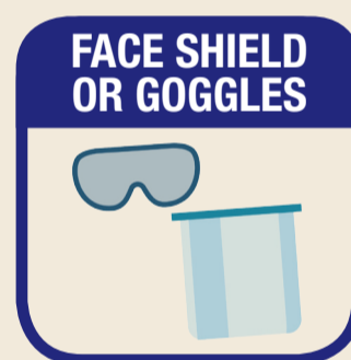
FACE SHIELD OR GOGGLES

Standard rubber boots that can be disinfected after use, or shoe covers that can be disposed of.