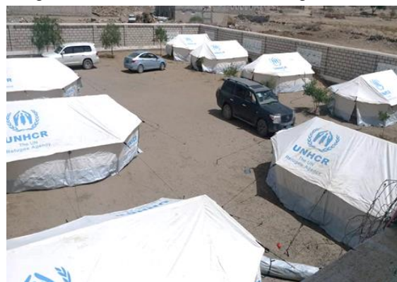
UNHCR tents are being installed at the Abu Ayoob School in Afar District, Al Bayda governorate to accommodate possible quarantine measures. © SDF/Abdullah Al Wajeeh, March, 2020.

During the reporting period, waves of displacement continued as a result of the fighting in Khab Wa Ash Sha'af district, Al-Jawf Governorate. Some 1,120 families are reported to have fled to locations within the same governorate, however in areas under control of different authorities. Shelter Cluster partner Building Foundation for Development (BFD), has begun distributing items in areas where there is still access, including 200