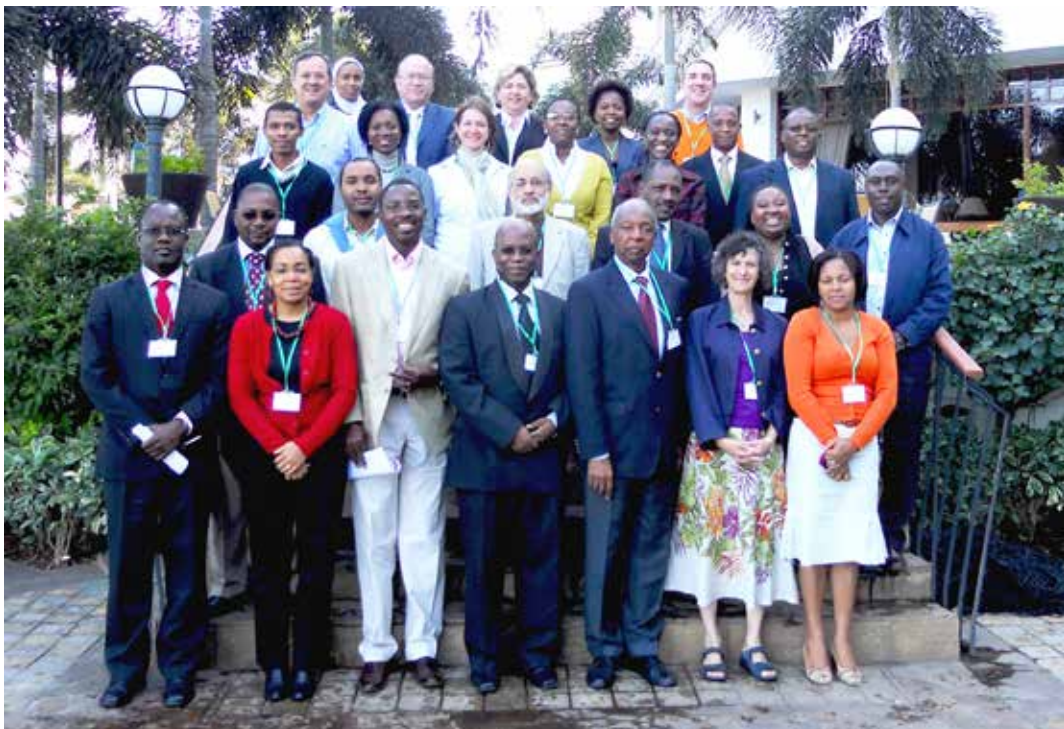
GARP-Mozambique leaders, African GARP collaborators and CDDEP colleagues at the working group launch.