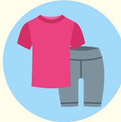
Change of clothes