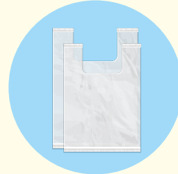
Plastic/ trash bags