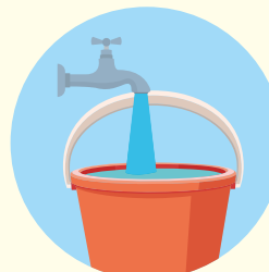
Water and pail