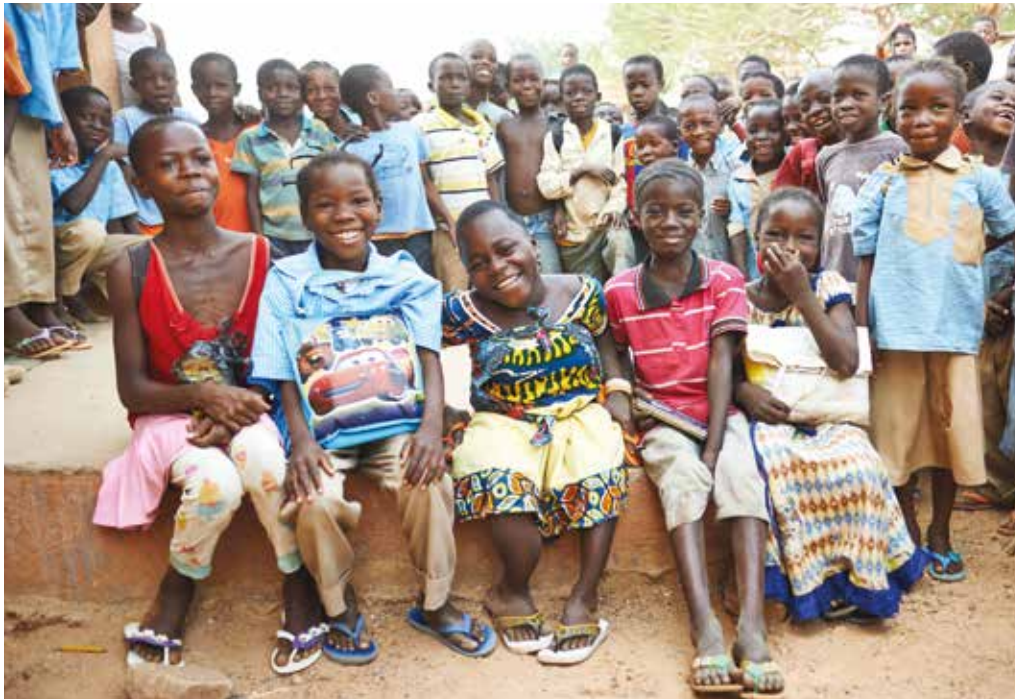
Assana, a girl with a physical disability, with her classmates.

Our strategy aims for three main results: