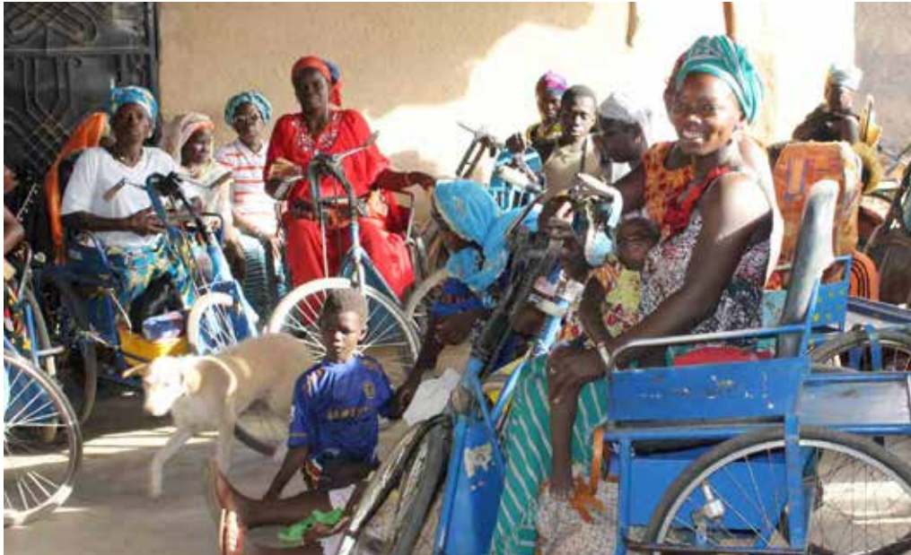
Women with disabilities at a meeting.

The Ministry of Women, National Solidarity and Family (MFSNF) through the SP COMUD/H ensures the coordination and capitalisation of actions in favour of persons with disabilities in the context of the implementation of the Convention on the Rights of Persons with Disabilities (CRPD).