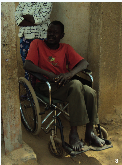
Figure 3 and 4 Project participants in Tenkodogo, Burkina Faso Handicap International, Burkina Faso

citizens including people with disabilities. Each neighbourhood is organised around the standpipe by a Management Committee composed of district resource persons known for their moral integrity. This Committee appoints one person in the area to manage the standpipe. The standpipe manager sells water, pays his bill and pays part of the profit to the Committee. Some people with disabilities are in charge of the management of some standpipes, and this has become an income generating activity for them. This allows people with disabilities who previously did not have access to a source of income to improve their living conditions, provide schooling for children, purchase food and pay for health care.