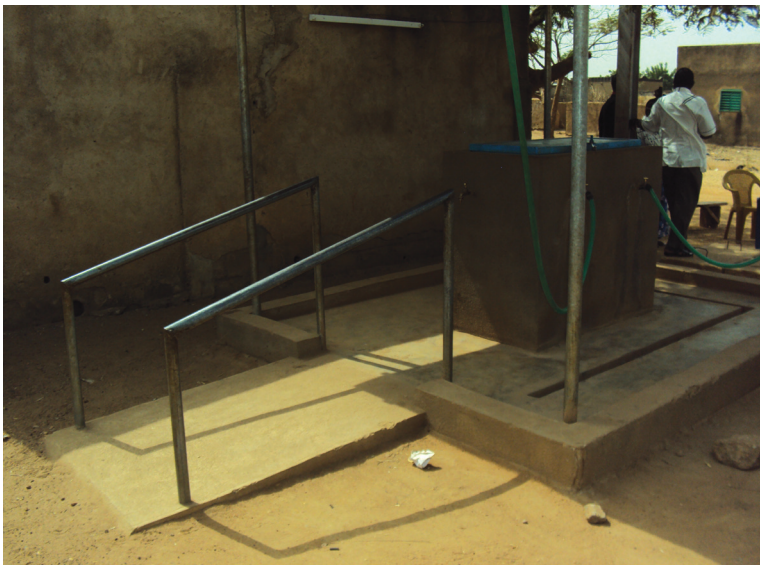
Figure 2 Standpipe in the municipality of Garango, Burkina Faso