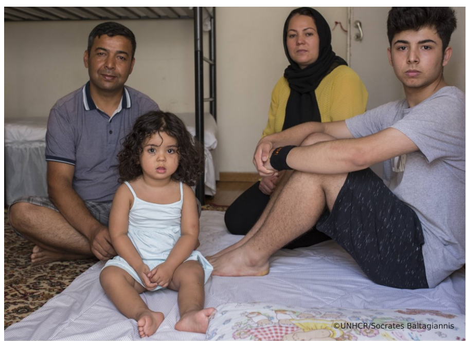
An Afghan family inside their apartment under UNHCR ESTIA accommodation programme in Athens