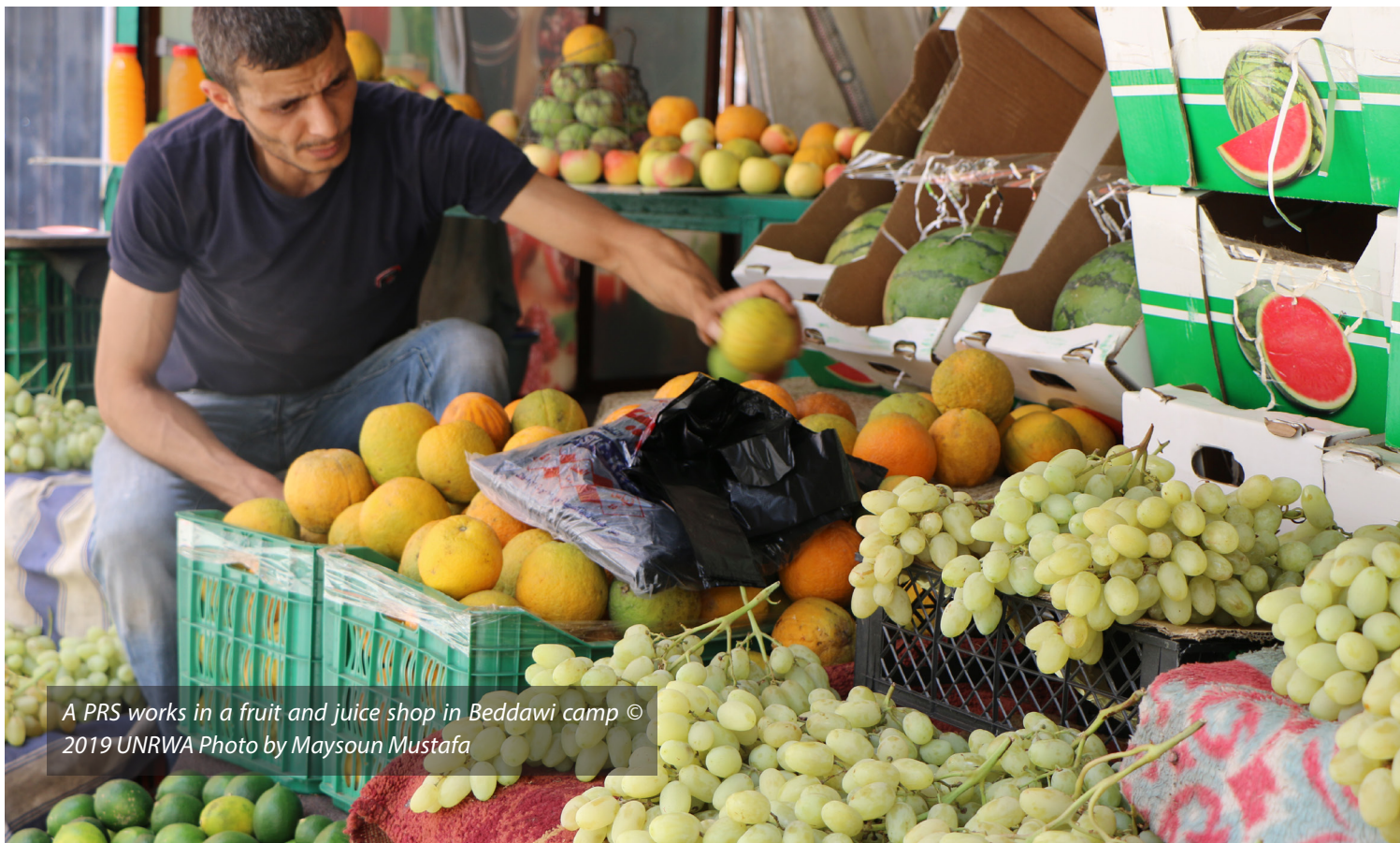
A PRS works in a fruit and juice shop in Beddawi camp

Increasing access to livelihood and employment opportunities—especially for PRS youth—is, therefore, vital and remains a key priority under this appeal. In line with its youth strategy, the Agency's youth unit will continue to support PRS and PRL youth with employment support services to improve their access to livelihoods and allow them to live in dignity.