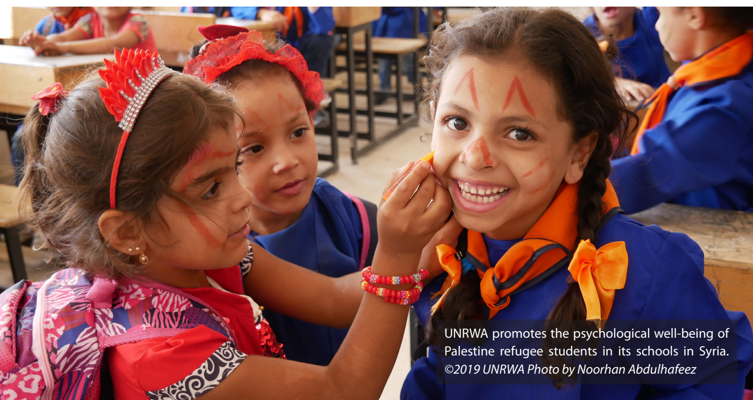
UNRWA promotes the psychological well-being of Palestine refugee students in its schools in Syria.