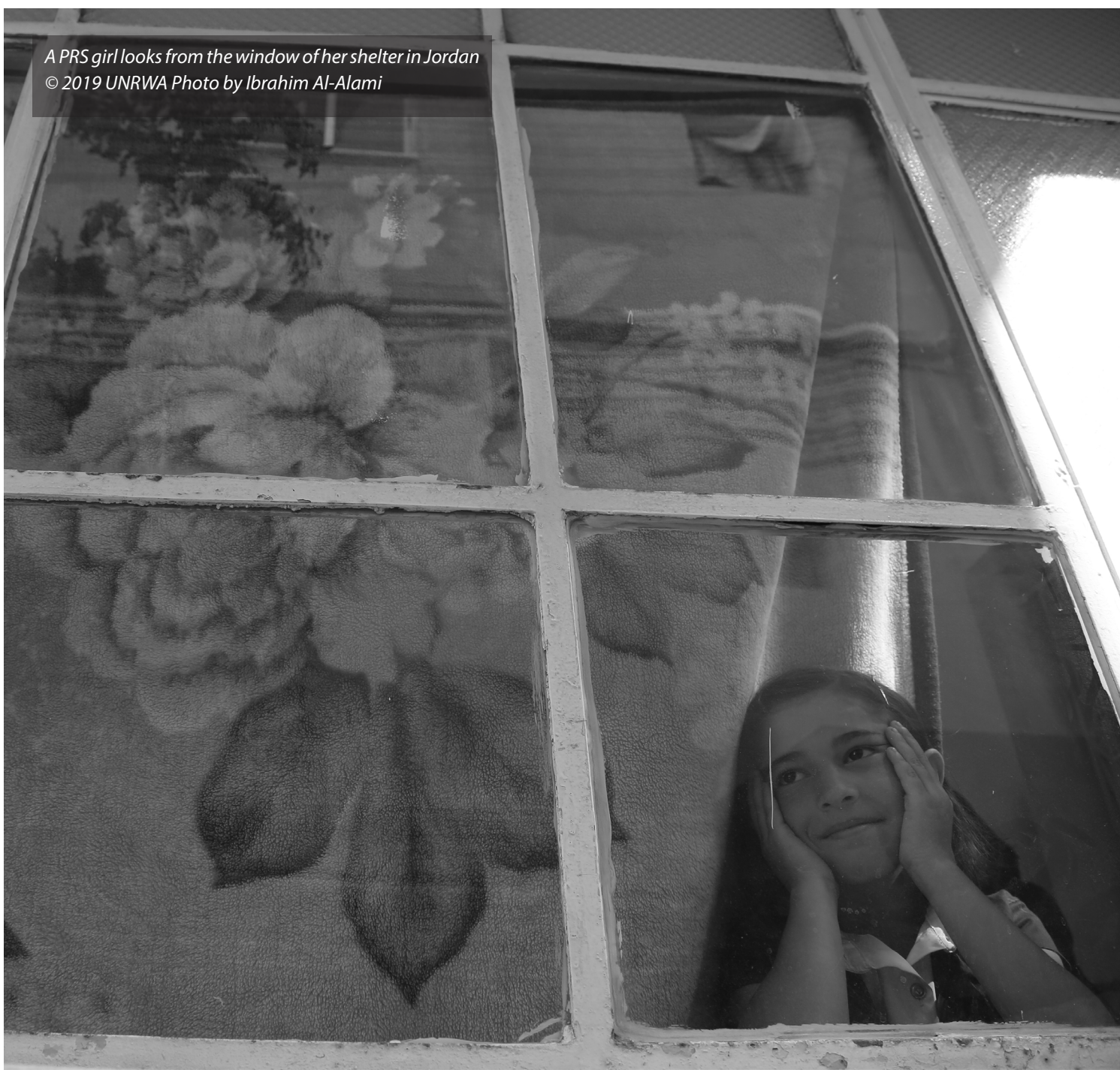
A PRS girl looks from the window of her shelter in Jordan

The legal and protection environment, in particular for the most vulnerable PRS, will remain restricted, as will access to employment, services, civil registration and legal processes. The Government of Jordan's policy of non-admission of PRS is expected to remain in place; the risk of forced return raising concerns of refoulement, particularly for those without valid documentation or identified as security cases, will remain high.