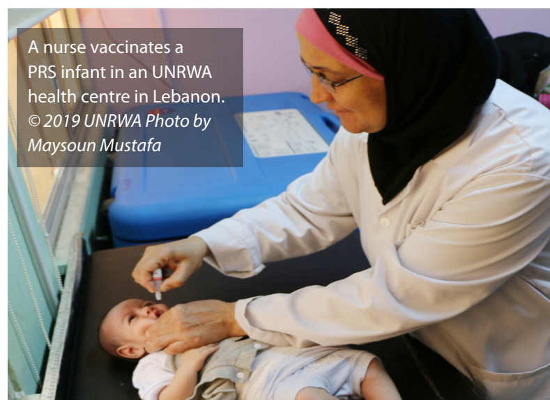
A nurse vaccinates a PRS infant in an UNRWA health centre in Lebanon.

crucial to ensure the well-being of PRS, with a planned target of 4,000 hospital referrals in 2020.