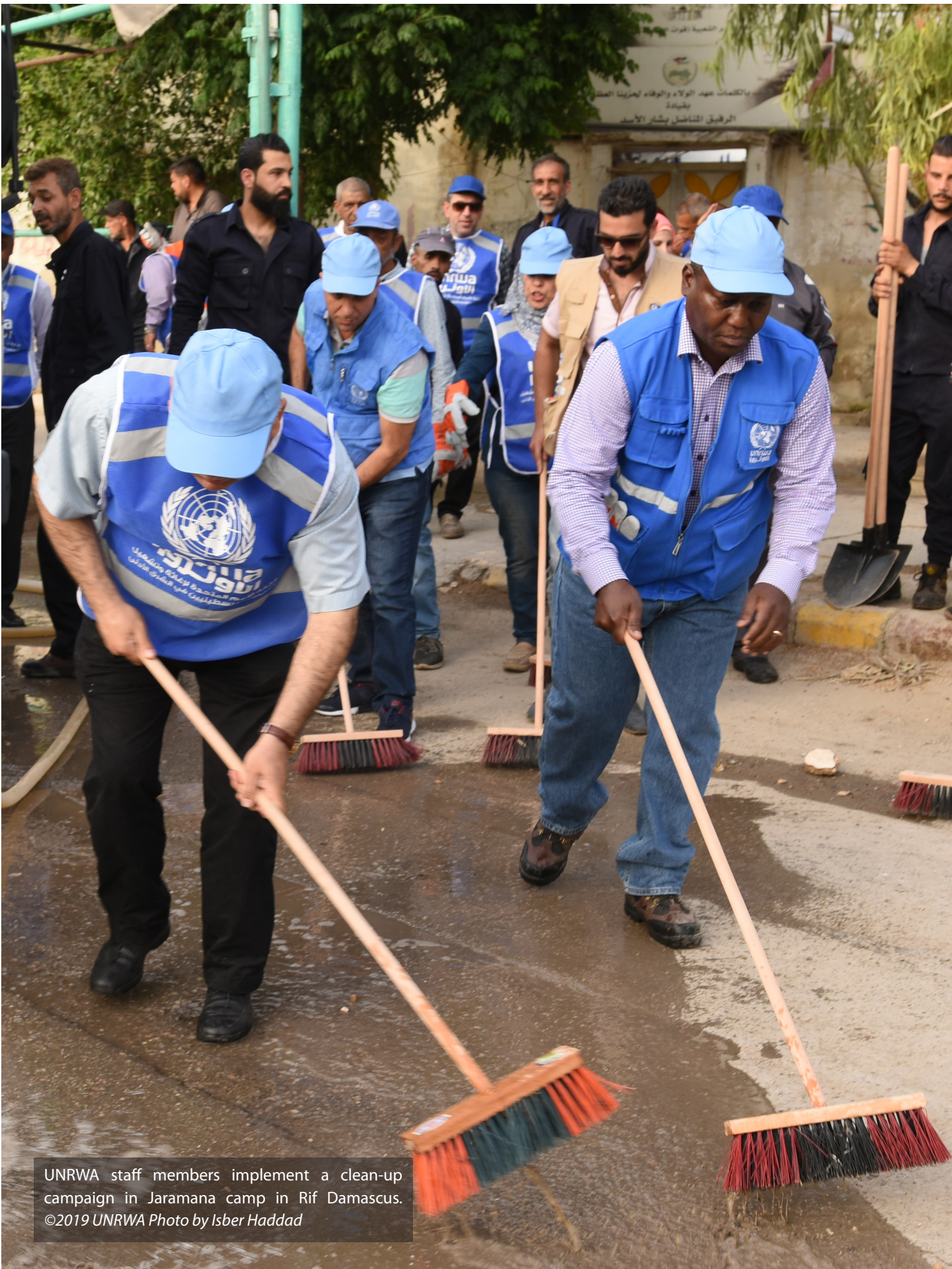
UNRWA staff members implement a clean-up campaign in Jaramana camp in Rif Damascus.