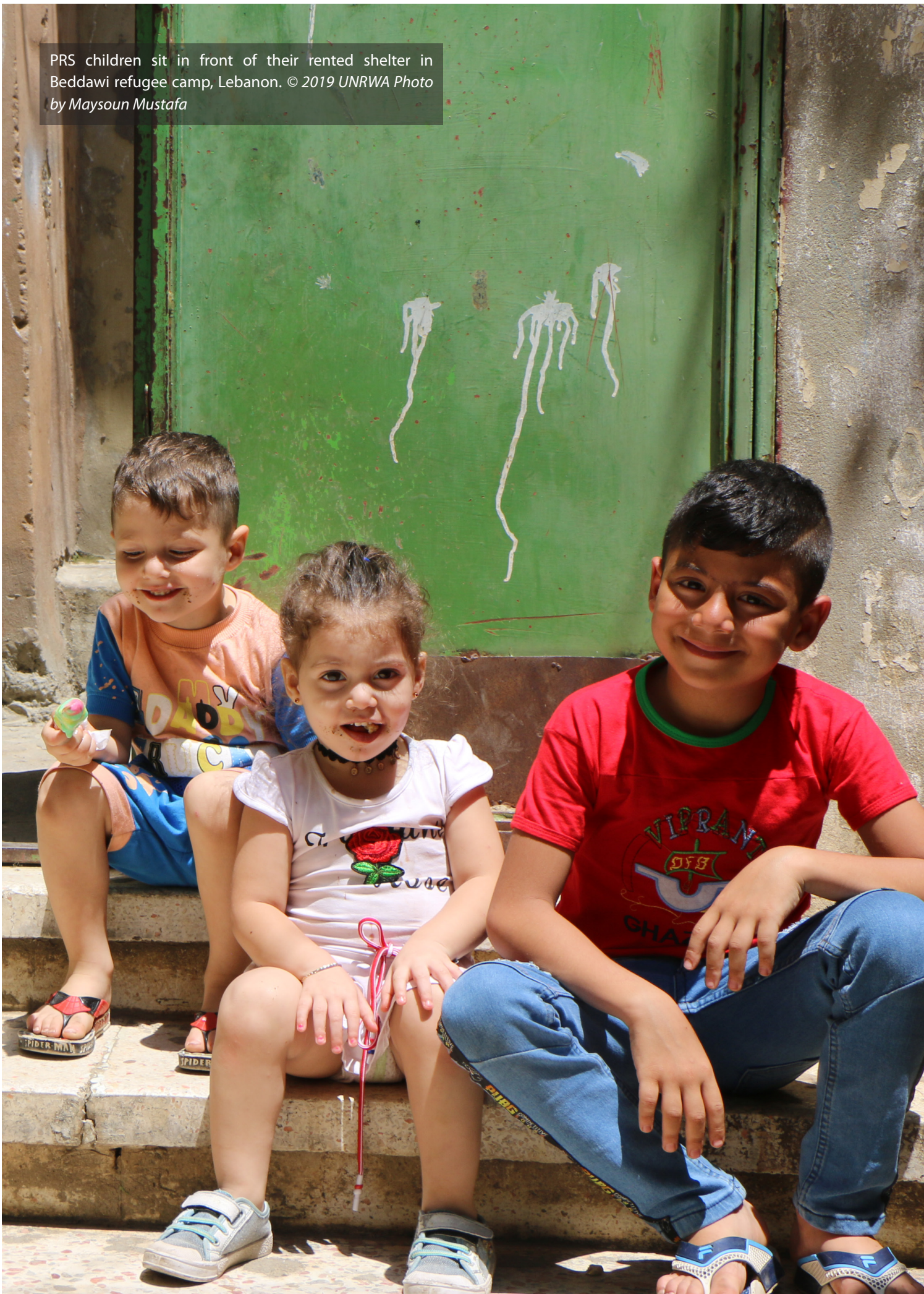
PRS children sit in front of their rented shelter in Beddawi refugee camp, Lebanon.