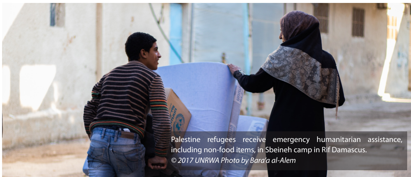
Palestine refugees receive emergency humanitarian assistance, including non-food items, in Sbeineh camp in Rif Damascus.