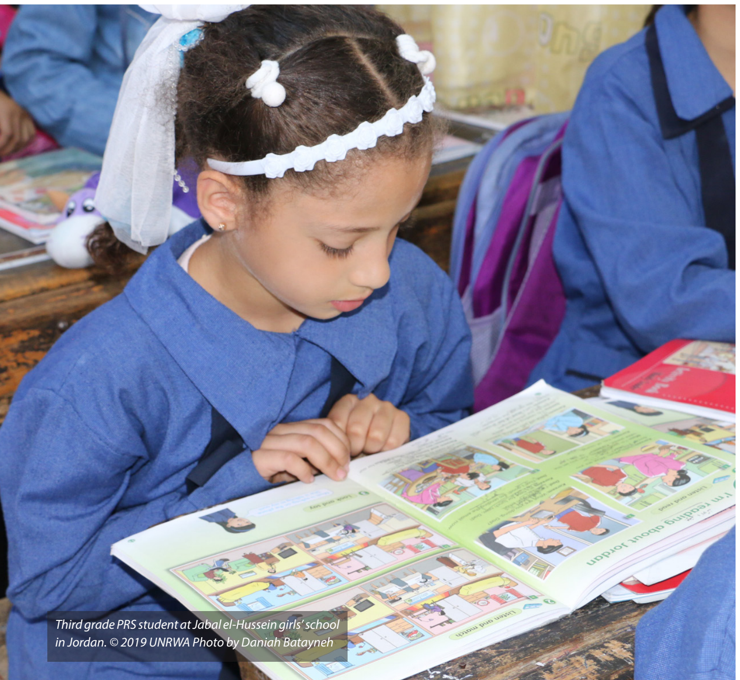
Third grade PRS student at Jabal el-Hussein girls' school in Jordan.

UNRWA will also ensure free admission to its Vocational Training Centres (VTCs) and the Faculty of Educational Sciences and Arts (FESA) to support PRS's access to the labour market and strengthen their livelihood opportunities. In 2020, based on availability of funds, UNRWA will undertake the repair and maintenance of these educational facilities through the rehabilitation of workshops and the provision of new tools and equipment in support of the educational process, to ensure a safe, secure and conducive learning environment.