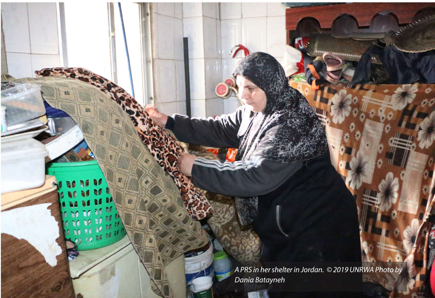
A PRS in her shelter in Jordan.

In 2020, in coordination with the UNRWA Syria field office (SFO), the Protection Unit in Jordan will continue to monitor PRS returns to Syria and possible new displacement to Jordan due to the absence of conditions necessary for a stable resettlement in the country. The Agency will continue to engage with the international human rights system based on the IHRS framework and with support from UNRWA HQ.