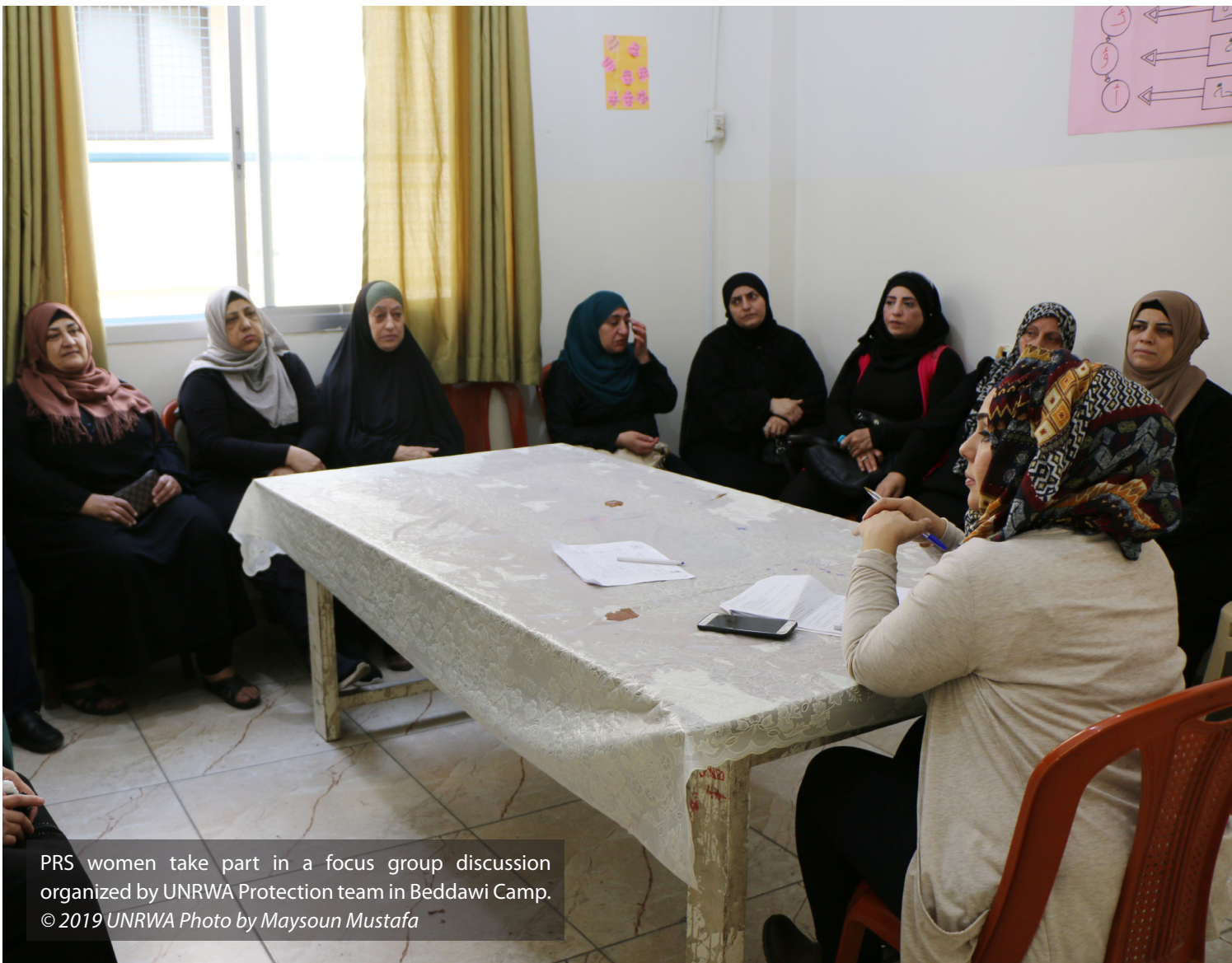
PRS women take part in a focus group discussion organized by UNRWA Protection team in Beddawi Camp.

In 2020, the UNRWA Protection Unit in Lebanon will put a stronger focus on international protection and protection monitoring along with the mainstreaming and integration of protection in the Agency's programmes. Protection monitoring and documentation will focus on the collection of individual cases involving alleged abuses of human rights by duty bearers to identify and track trends for advocacy and interventions. In addition, the Protection Unit will conduct focus group discussions and individual interviews with both PRS and PRL in host communities to understand the issues and challenges PRS face in making the choice of whether to remain in Lebanon or return to Syria. UNRWA will also continue to conduct interviews with PRS newly arrived from Syria. The Agency will furthermore continue to engage with the international human rights system in line with the IHRS framework and with the support of UNRWA HQ.