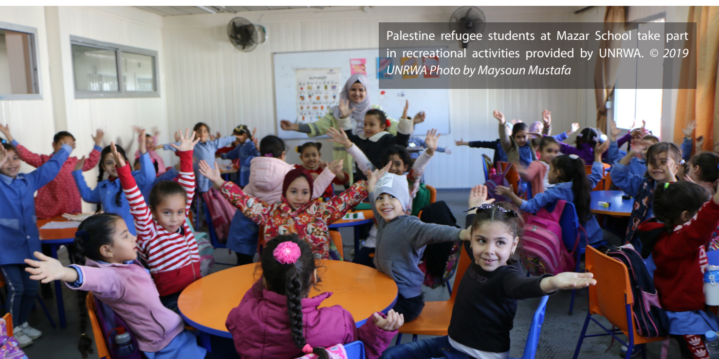
Palestine refugee students at Mazar School take part in recreational activities provided by UNRWA.

In addition, in alignment with the Ministry of Education and Higher Education in Lebanon, UNRWA aims to support the enrolment of PRS and PRL students in various trade and semi-professional vocational courses at its Sibliin Training Centre (STC). Through its vocational training services, the Agency supports PRS and PRL youth in Lebanon to realize their full potential and become self-reliant by providing the necessary market-oriented skills and abilities that contribute to sustained livelihoods.