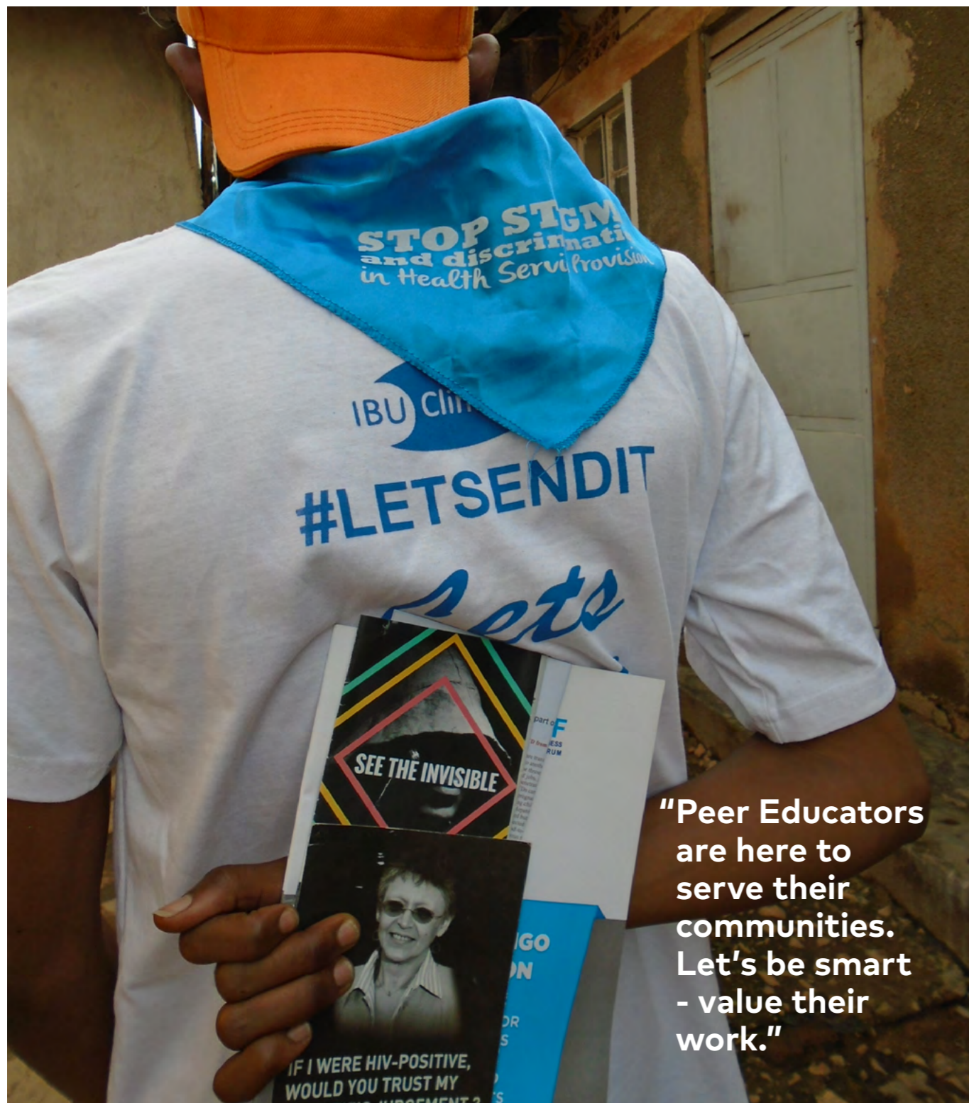
© Ruthiana Amor 2018 PhotoVoice International HIV/AIDS Alliance PITCH Uganda

"Peer Educators are here to serve their communities. Let's be smart - value their work."